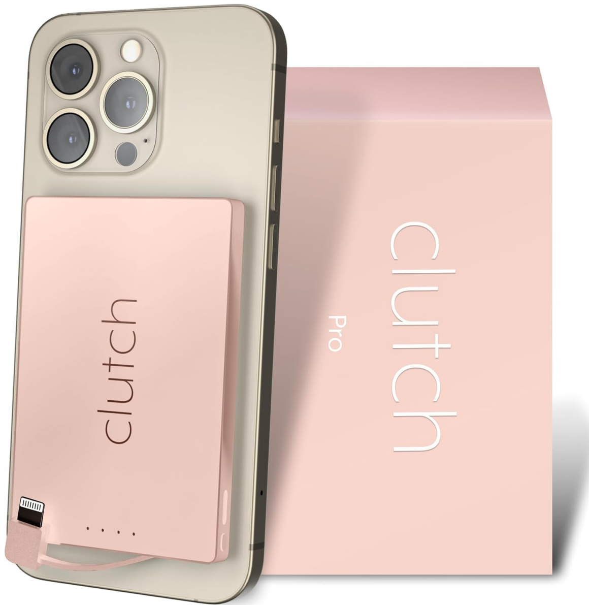
Image: The pink Clutch Pro Portable iPhone Charger, showcasing its compact and sleek design.