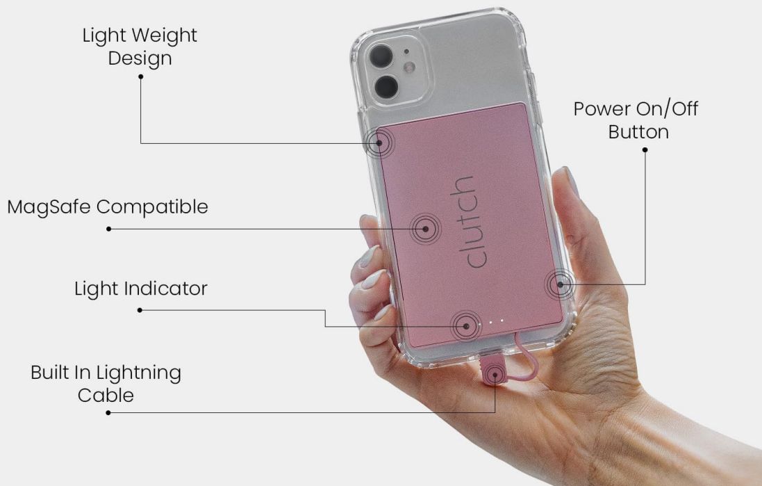
Image: The Clutch Pro attached magnetically to an iPhone, demonstrating its secure connection.