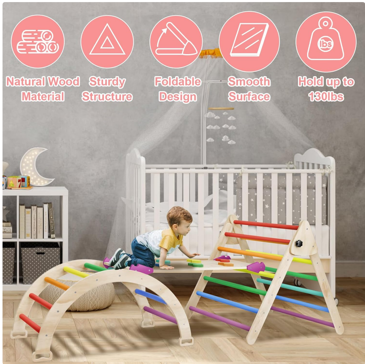
Figure 4: The foldable design allows for convenient storage when not in use.