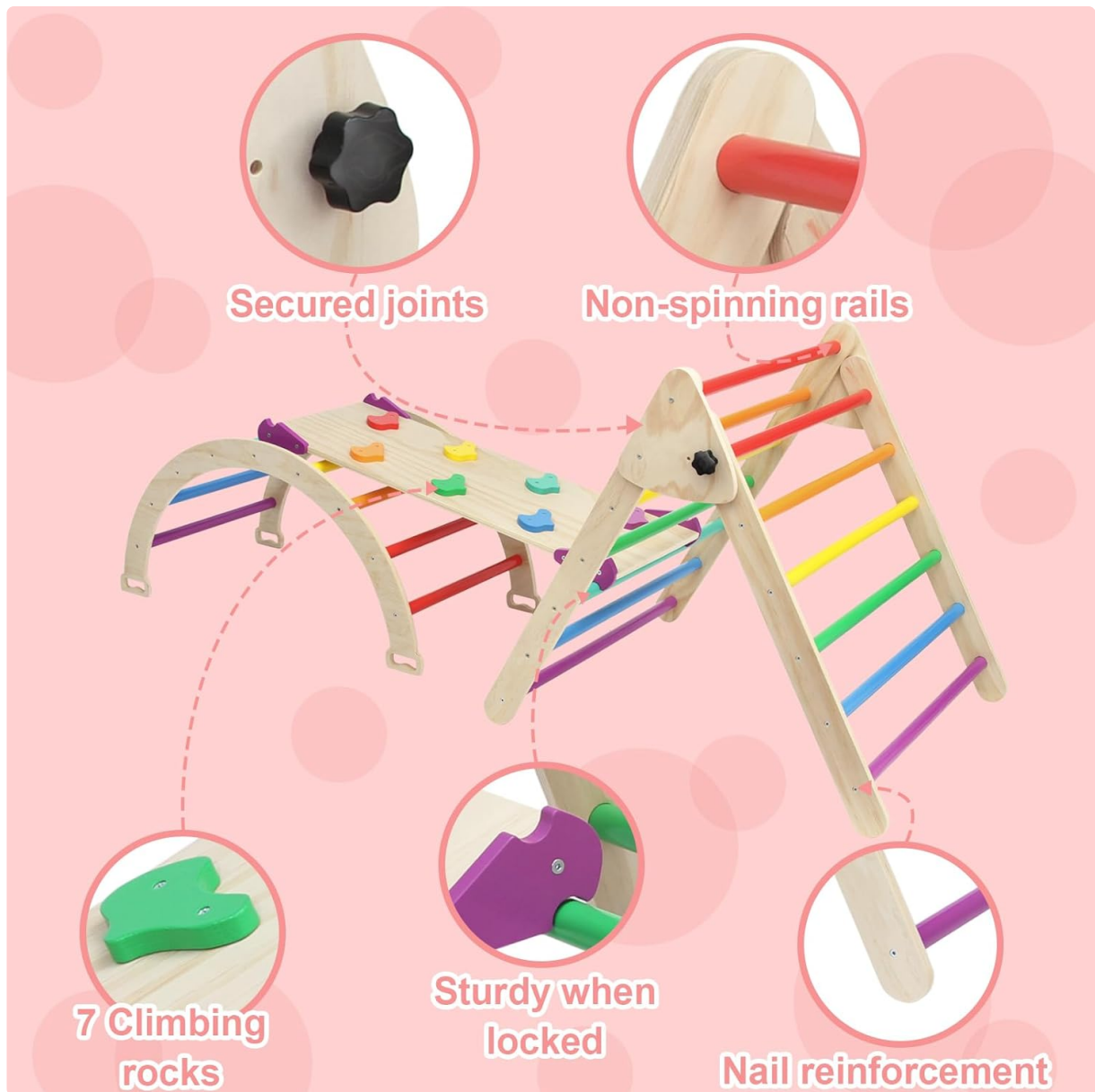
Figure 3: Visual guide to the 5-in-1 play configurations.

Video 2: Overview of the EDOSTORY 5-in-1 Pikler Triangle Set, demonstrating various play configurations and features.