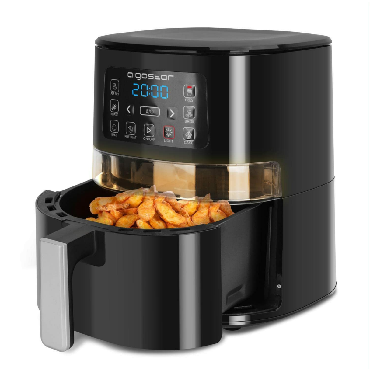
Figure 3.1: Aigostar Maha 4L Air Fryer with its illuminated viewing window, showing prepared food.