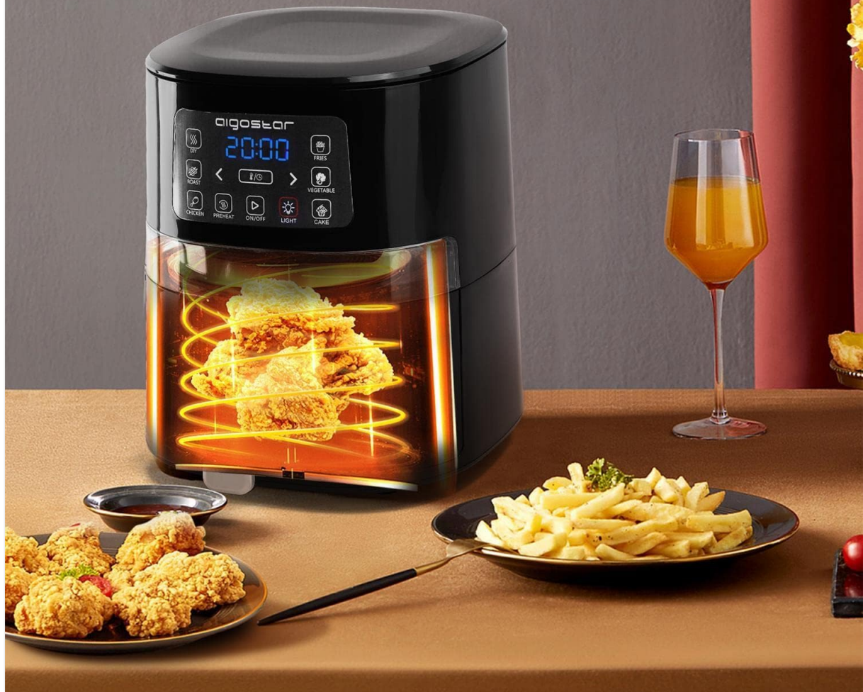
Figure 5.2: Rapid 360-degree hot air circulation for efficient cooking.