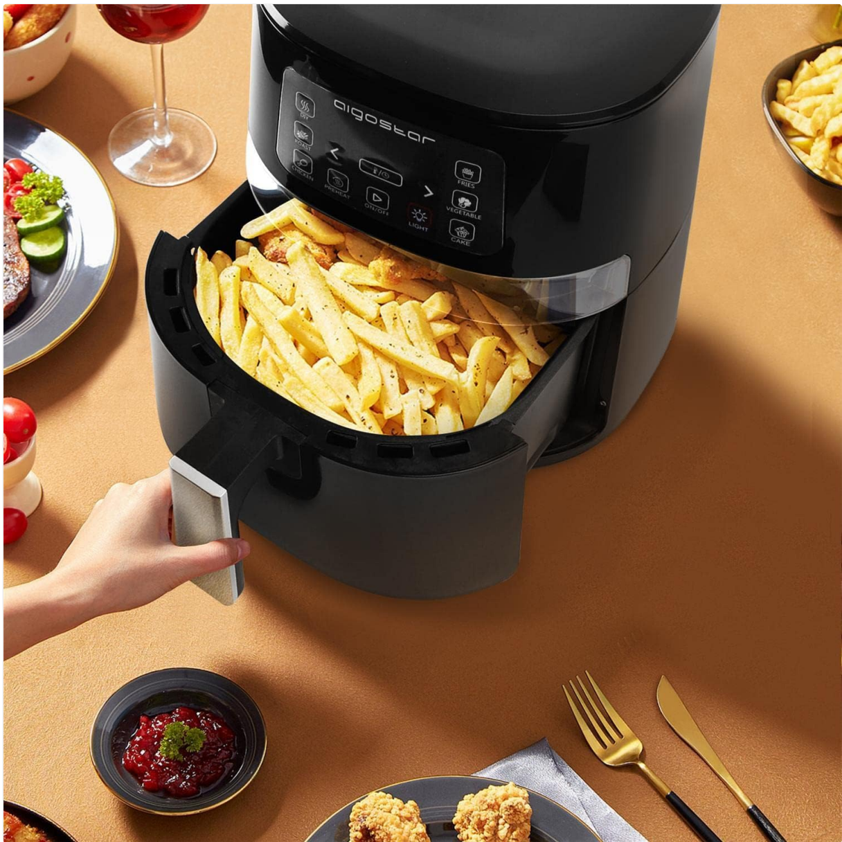
Figure 5.3: Removing the non-stick cooking basket.