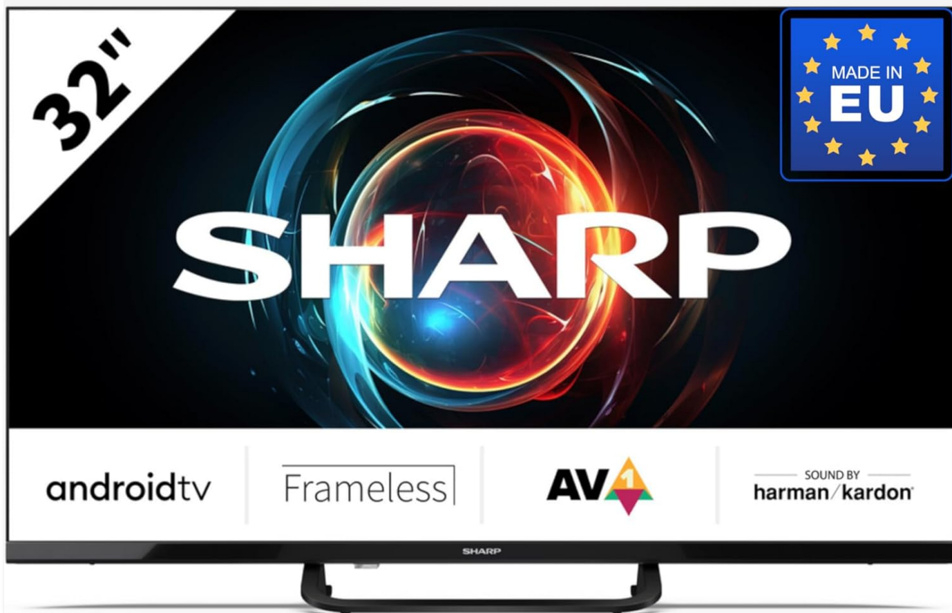
Image: The SHARP 32FH8EA 32-inch Full HD Android TV, showcasing its frameless design and Android TV branding.

This manual provides comprehensive instructions for the setup, operation, maintenance, and troubleshooting of your new SHARP 32FH8EA 32-inch Full HD Android TV. Please read this manual carefully before using the television to ensure proper and safe operation. Keep this manual for future reference.