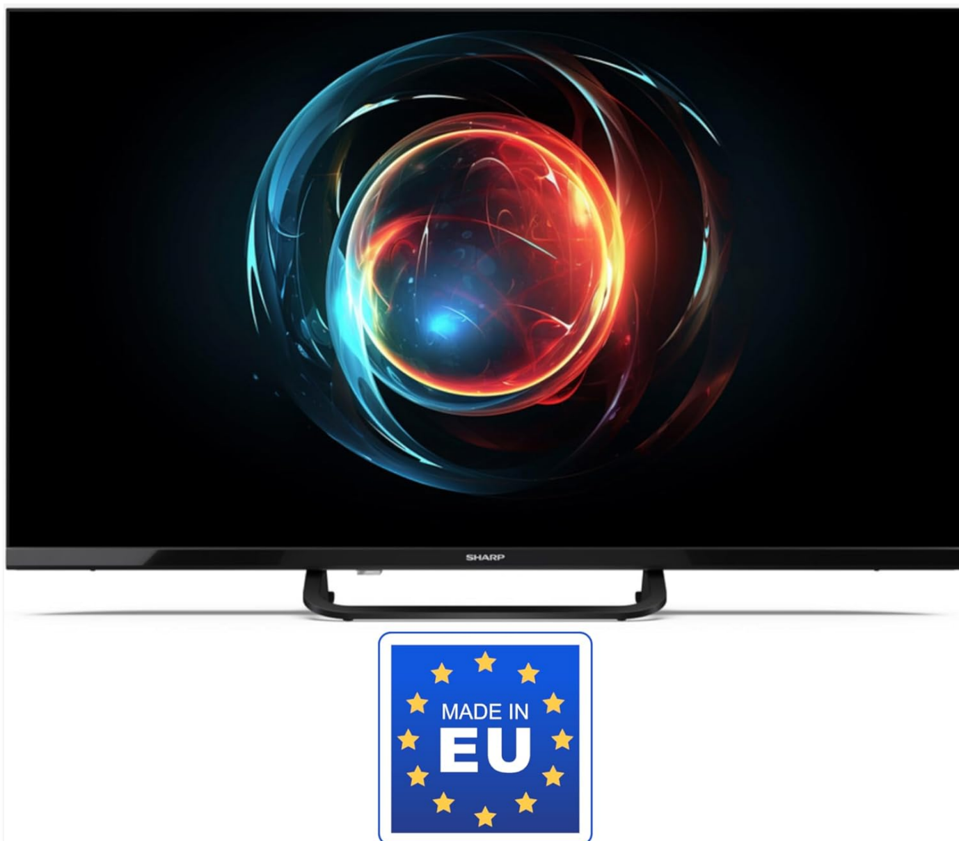
Image: The SHARP 32FH8EA television with its included stand, ready for placement.