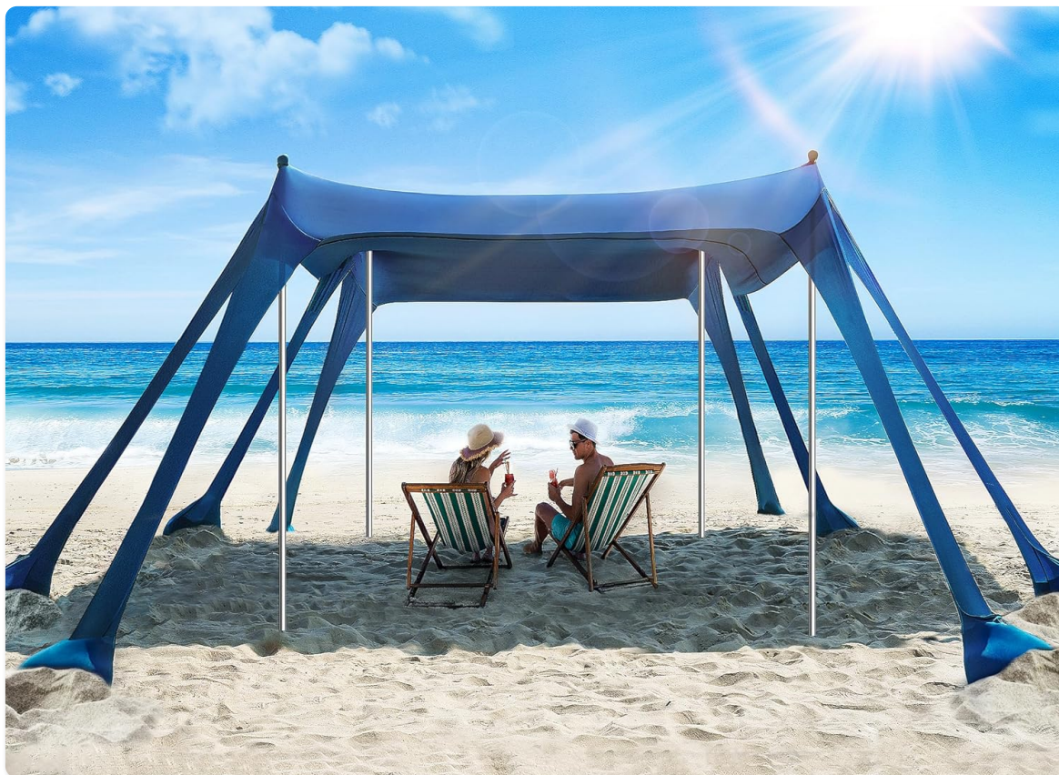
Image: Vibemo 10x10ft Beach Tent Sun Shade providing ample shade on a sunny beach.

Thank you for choosing the Vibemo 10x10ft Beach Tent Sun Shade. This manual provides essential instructions for the proper setup, use, and maintenance of your sun shelter. Designed for ease of use and optimal sun protection, this tent is ideal for beaches, parks, camping, and backyard activities.