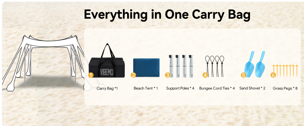
Image: Visual representation of all items included in the package.