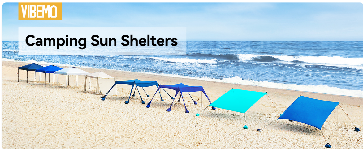
Image: Tips for achieving maximum stability for your beach tent.