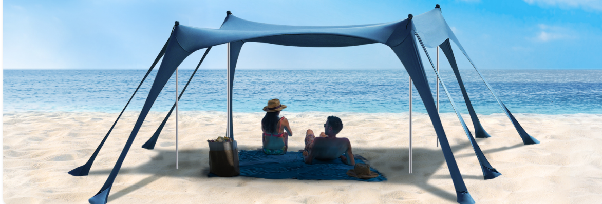
Image: The versatile Vibemo Beach Tent in various outdoor settings.