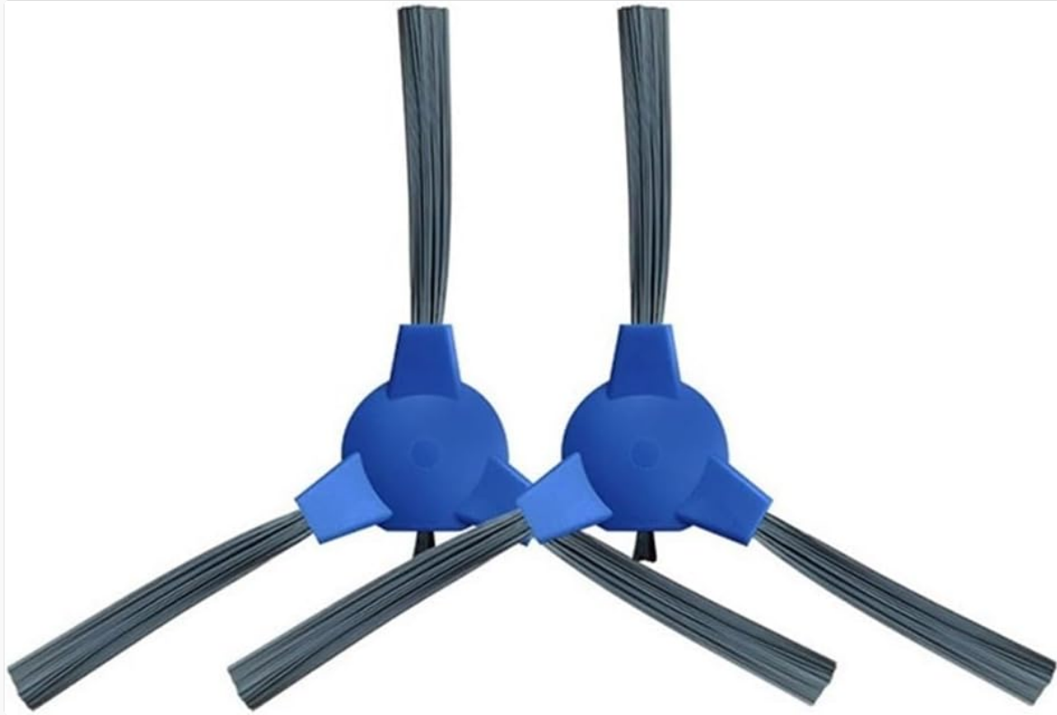
Image 3: Two side brushes, showing their three-arm design, ready for attachment to the robot vacuum.