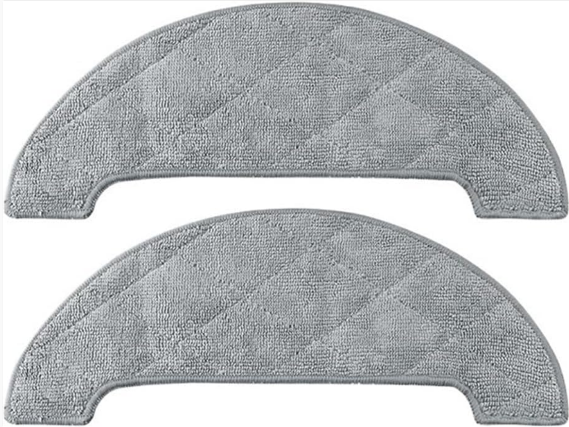
Image 5: Two grey, semi-circular mop cloths with textured surfaces, designed for wet cleaning.