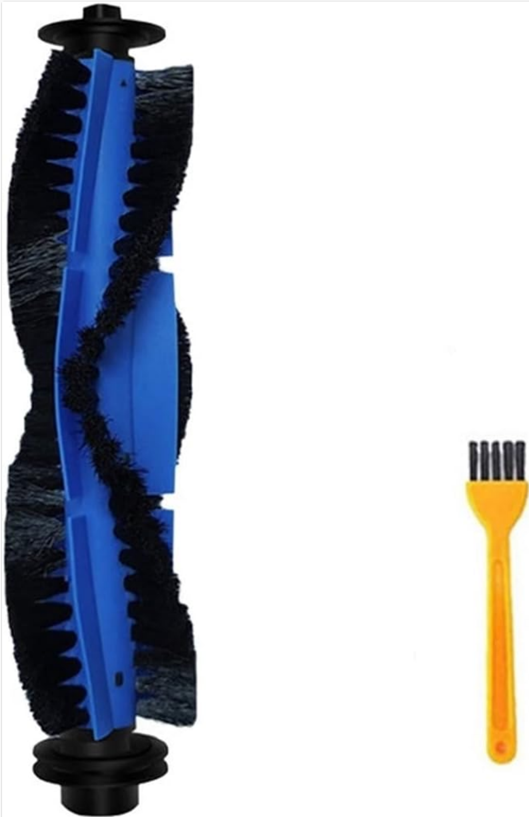
Image 2: A main brush and the accompanying cleaning tool, ready for installation or maintenance.