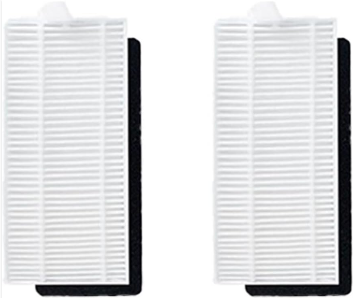
Image 4: Two rectangular HEPA filters with white pleated material and black frames, designed to capture fine particles.