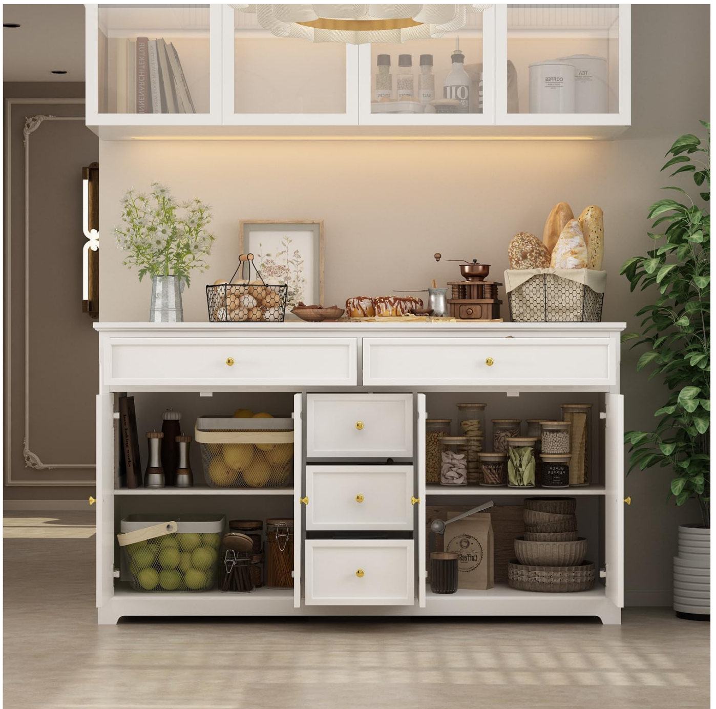
Image 4.1: The buffet cabinet with its doors open, illustrating the spacious interior and organized storage of various kitchen and dining items.