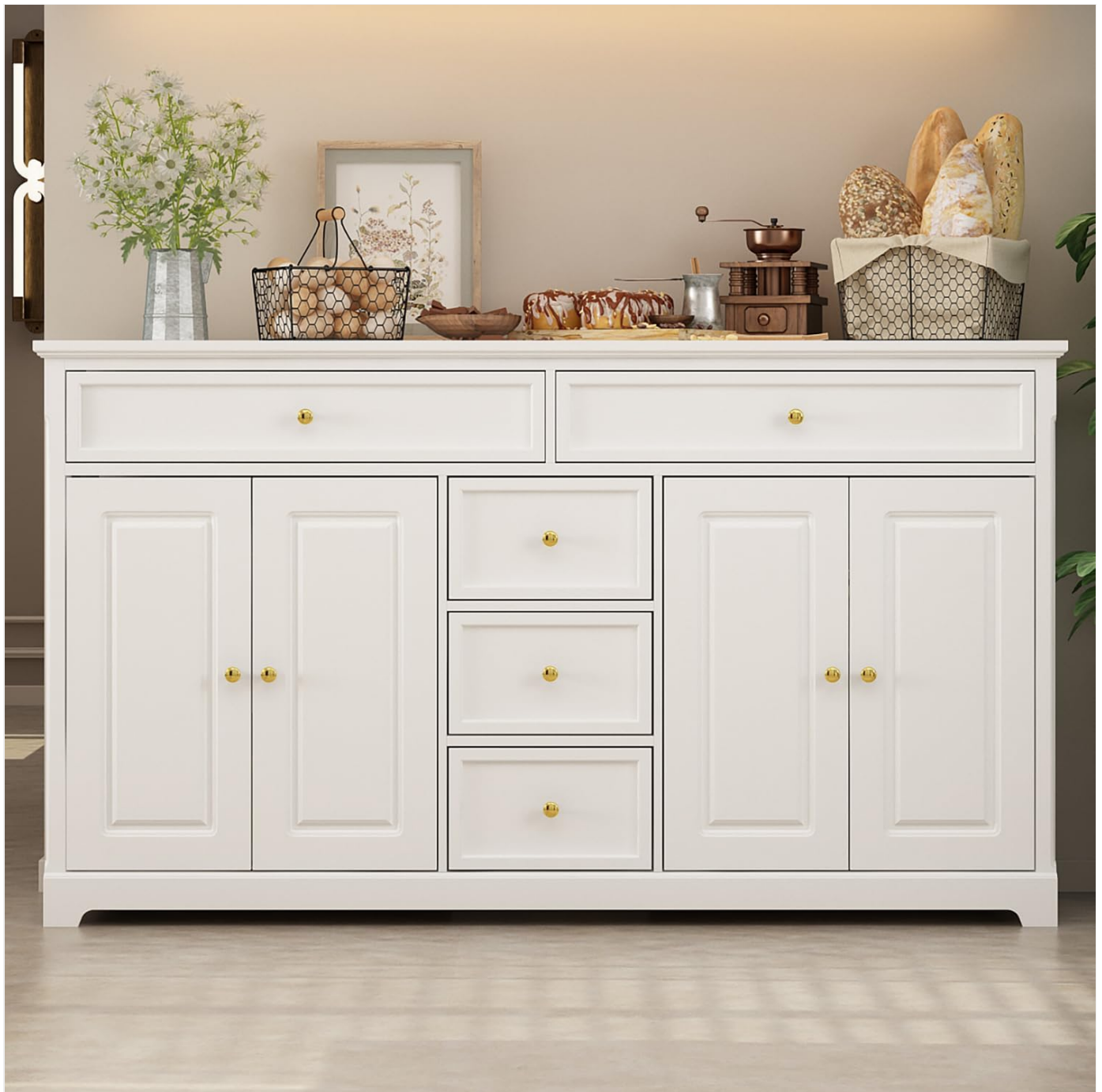
Image 1.1: The FUFU&GAGA Buffet Cabinet, showcasing its elegant design and storage capabilities in a typical home environment.