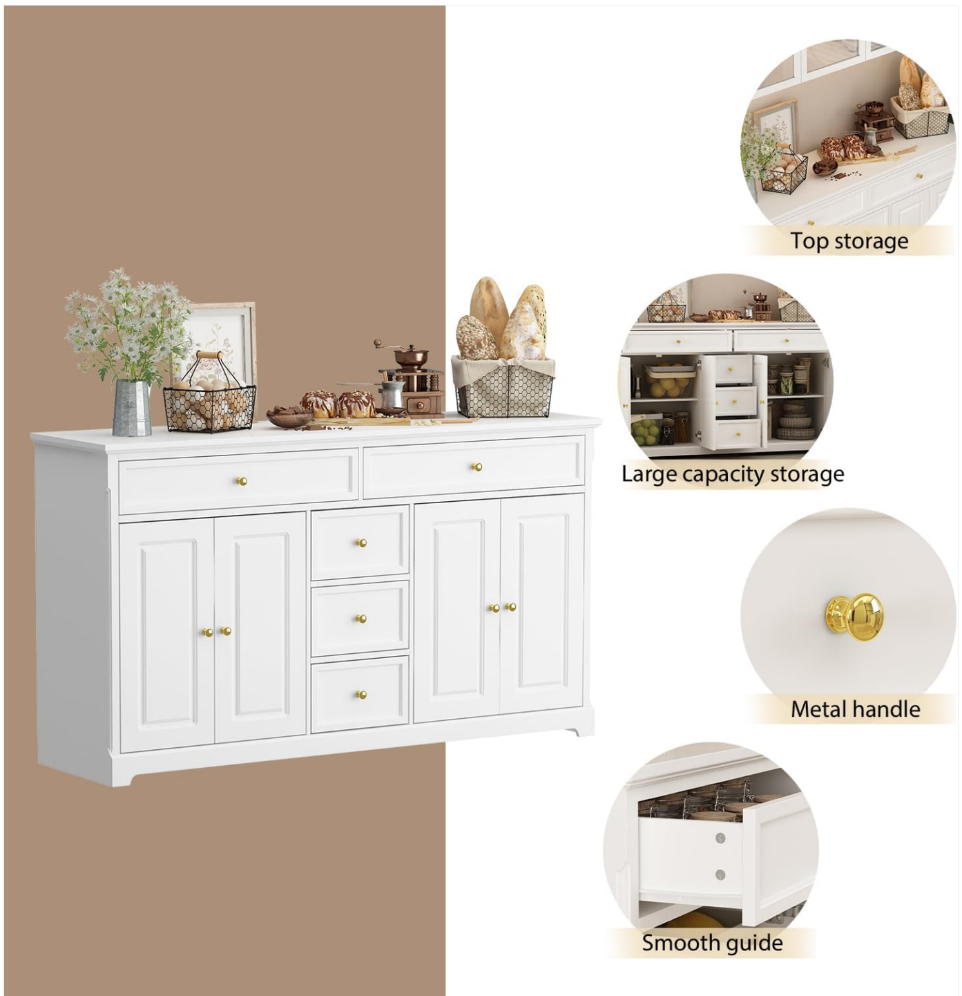
Image 4.2: A visual summary of the cabinet's key features, including its ample top storage, large internal capacity, durable metal handles, and smooth-gliding drawers.