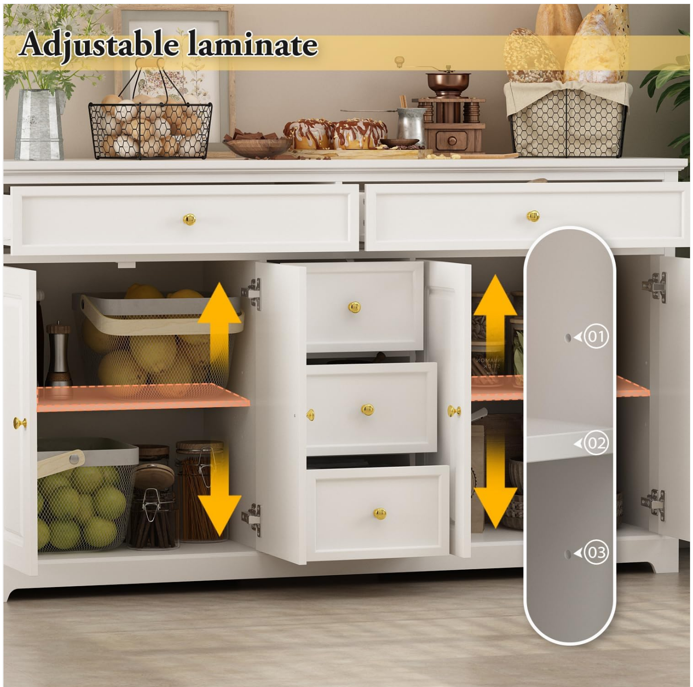
Image 3.2: Illustration of the adjustable laminate shelves within the cabinet, demonstrating how shelf height can be customized to fit various items.