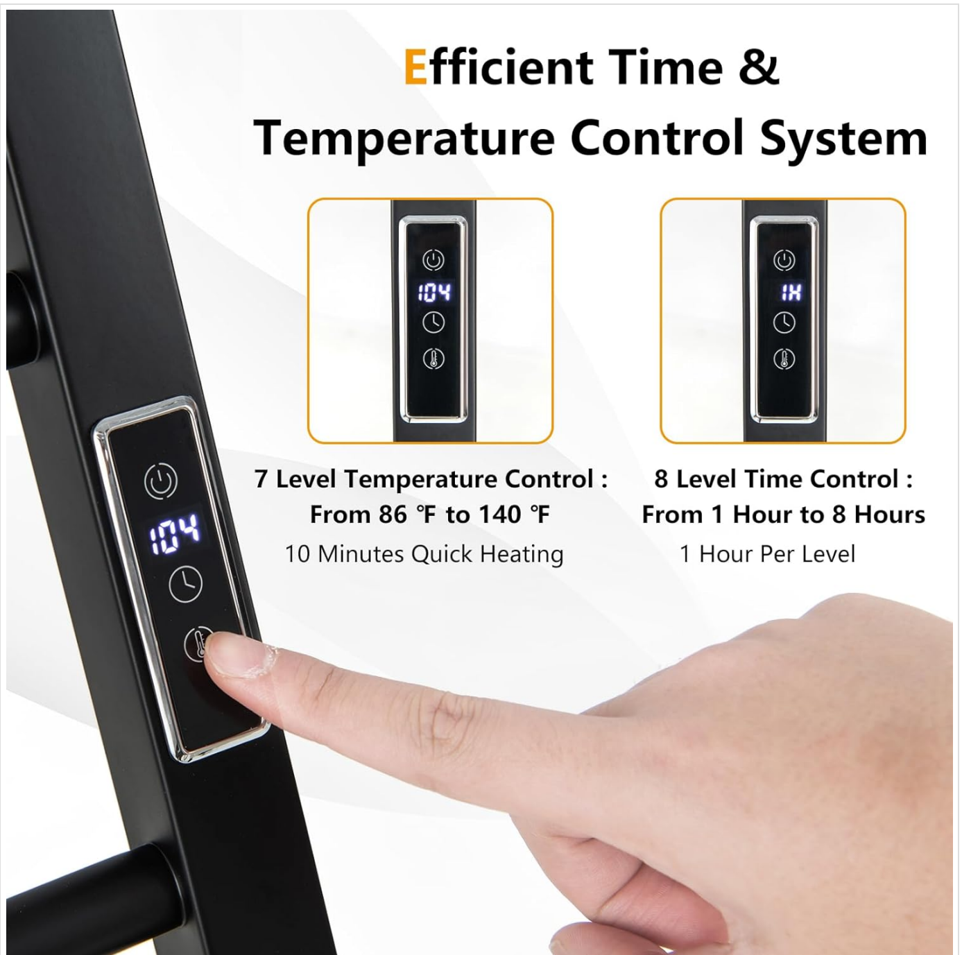
Image: A detailed view of the control panel, illustrating the LED display for temperature and time settings, and the power and timer buttons.

8 Level Time Control : From 1 Hour to 8 Hours 1 Hour Per Level