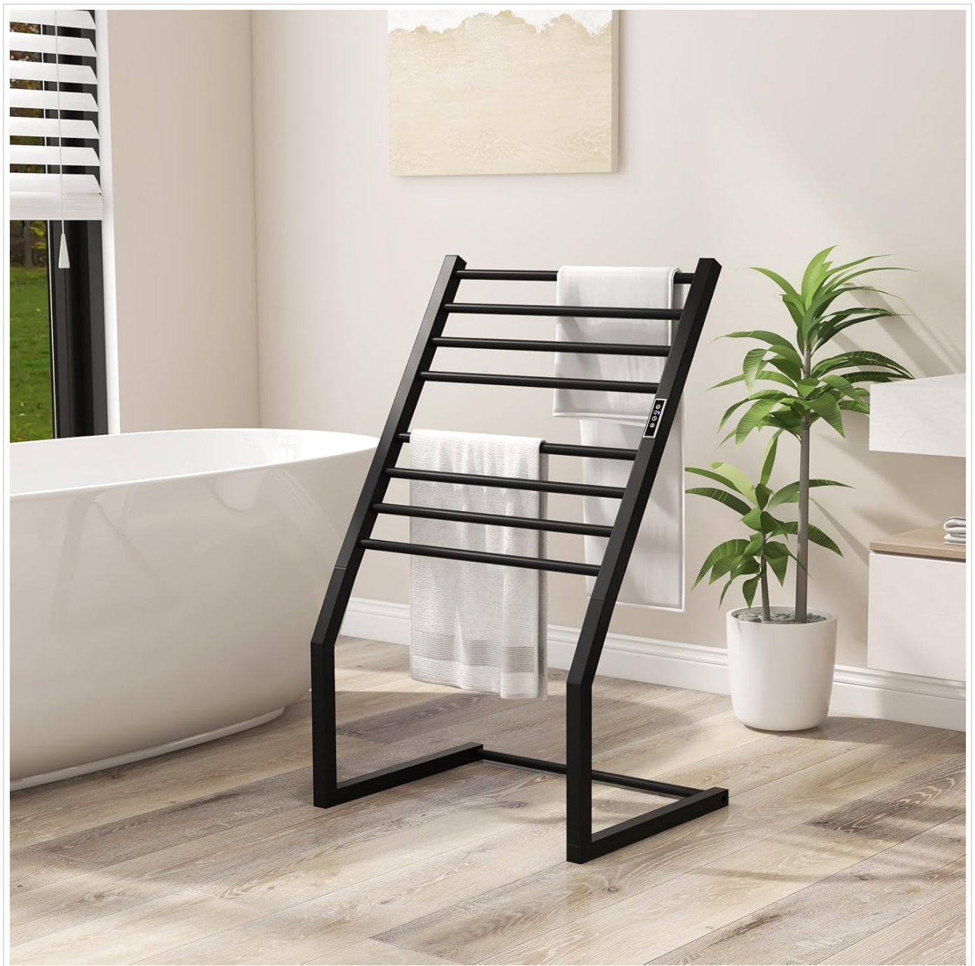
Image: The heated towel rack positioned freestanding in a bathroom, demonstrating its stability and design.