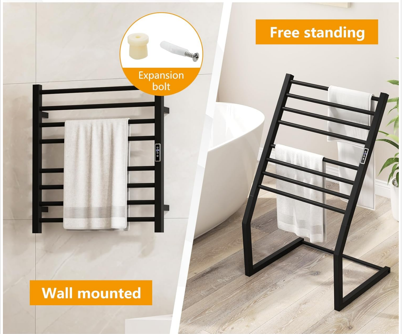
Image: A visual comparison of the wall-mounted and freestanding installation methods, including a close-up of the expansion bolt for wall mounting.