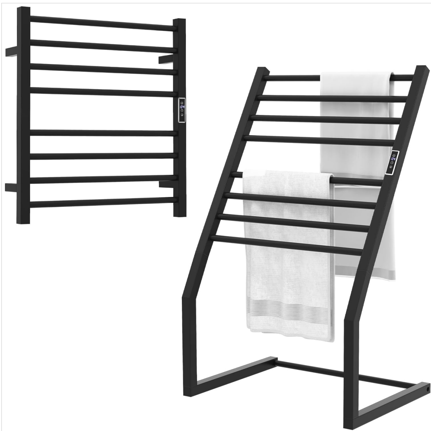
Image: The COSTWAY Heated Towel Rack shown in both its wall-mounted and freestanding configurations, highlighting its versatile design.