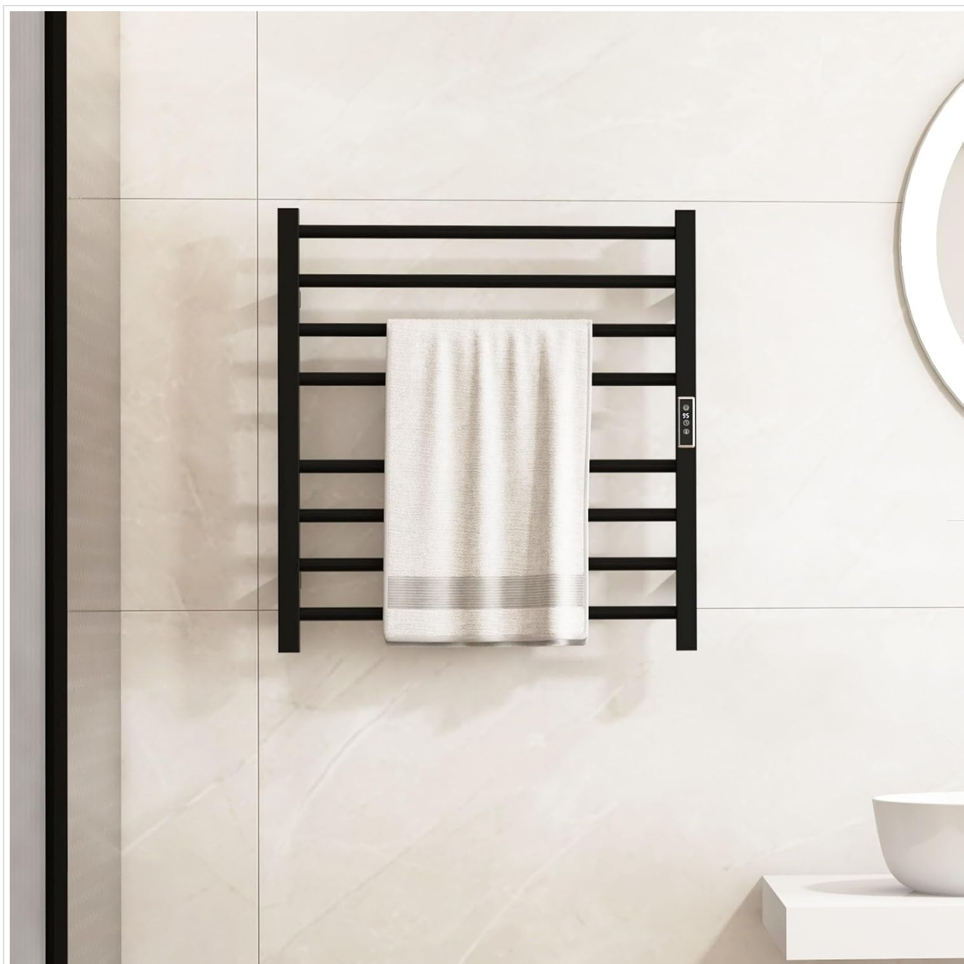
Image: The heated towel rack securely mounted on a bathroom wall, demonstrating its space-saving design.