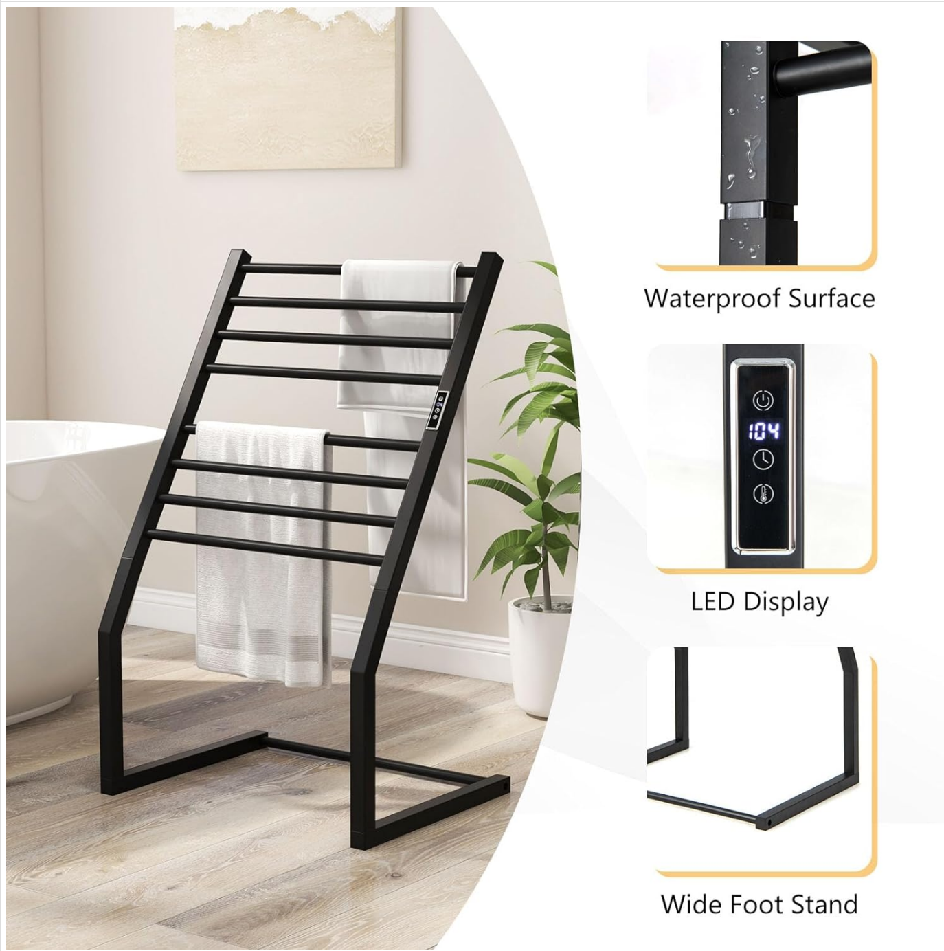
Image: Detailed views highlighting the waterproof surface for easy cleaning, the clear LED display, and the stable wide foot stand for freestanding use.