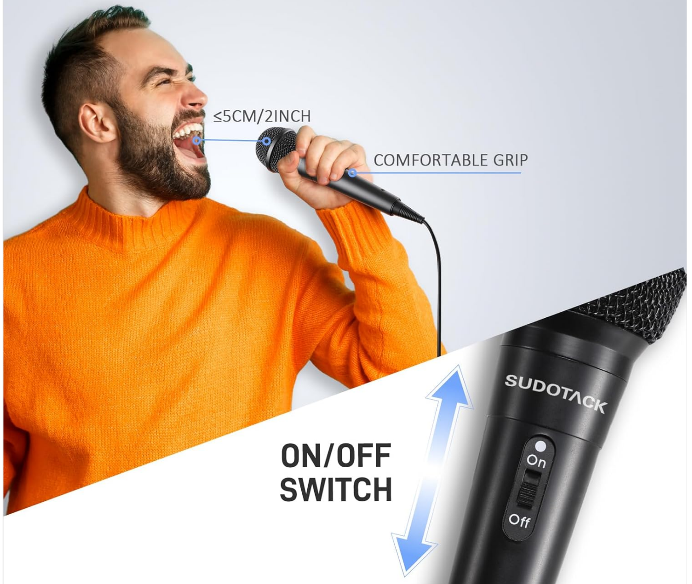
Image: A person demonstrating the easy-to-operate ON/OFF switch and the comfortable grip of the microphone.