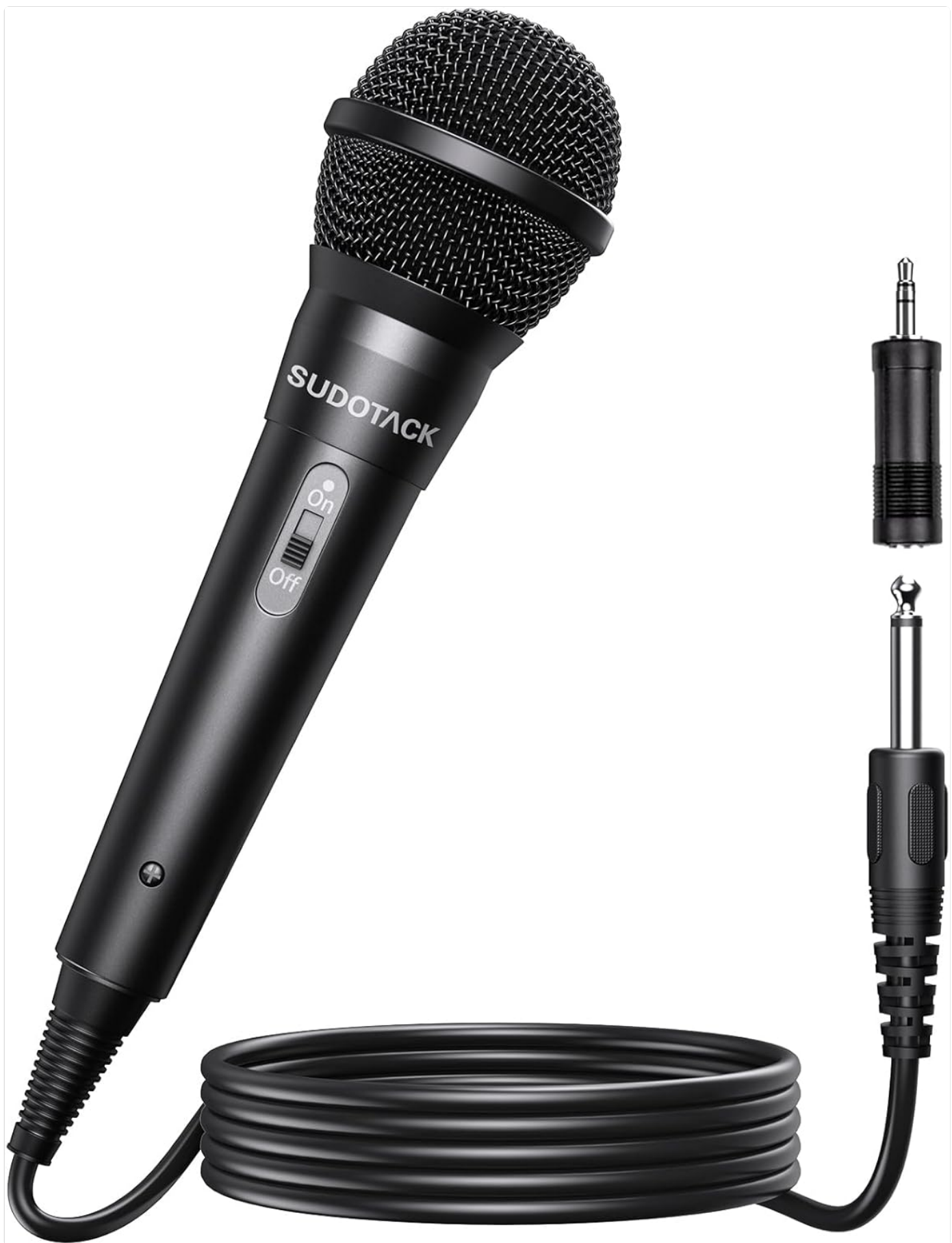
Image: SUDOTACK K03 Wired Handheld Dynamic Vocal Microphone with attached cable and included 3.5mm adapter.