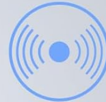
High Signal Output