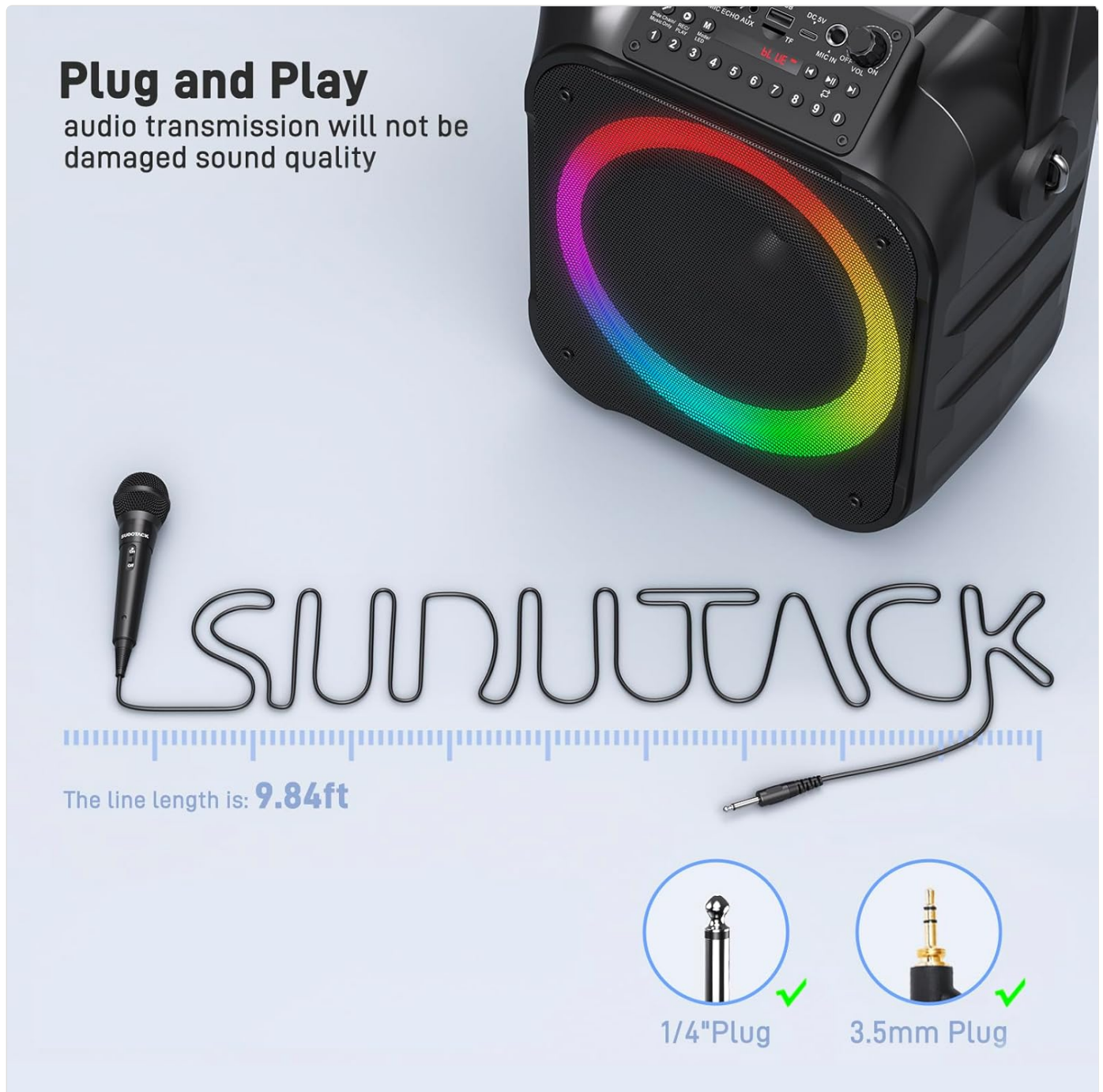
Image: Illustration demonstrating the microphone's wide compatibility with different audio equipment, including mixers and speakers.