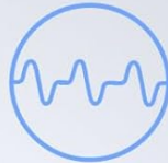
Ultra-Wide Frequency Response