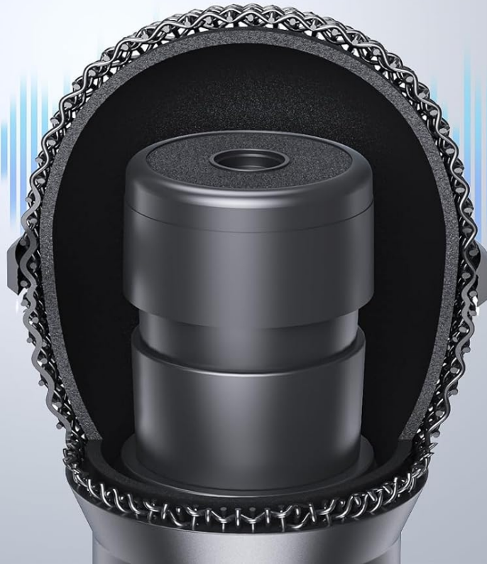
Image: Diagram highlighting the microphone's studio-quality audio capabilities, including its unidirectional moving coil and wide frequency response.