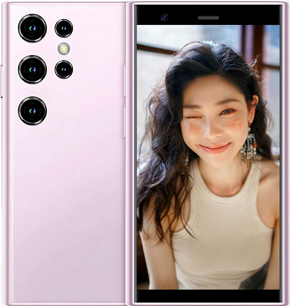
Image: Front and back view of the Hipipoo Mini Smartphone S23Pro, showcasing its compact design and camera layout.