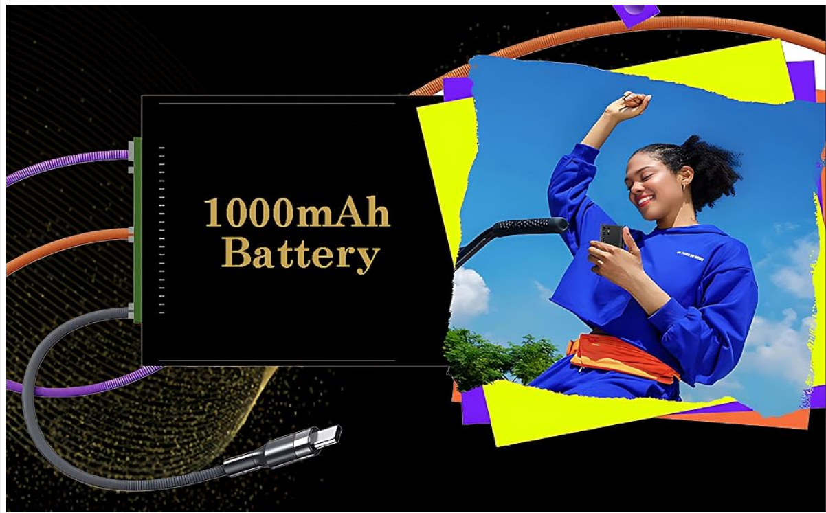
Image: Overview of the Hipipooo Mini Smartphone S23Pro's core features and specifications.