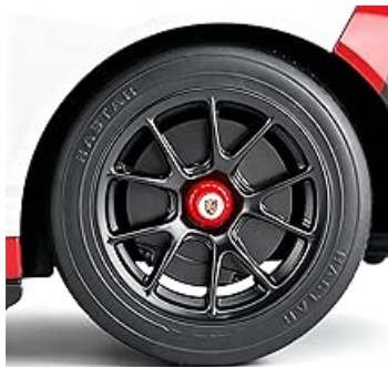
Image 3.2: Detail of the car's wheel, showing the RASTAR branding.

If the car does not drive straight when the steering control is centered, locate the steering trim adjustment on the underside of the car. Turn the knob slightly left or right until the car maintains a straight path.