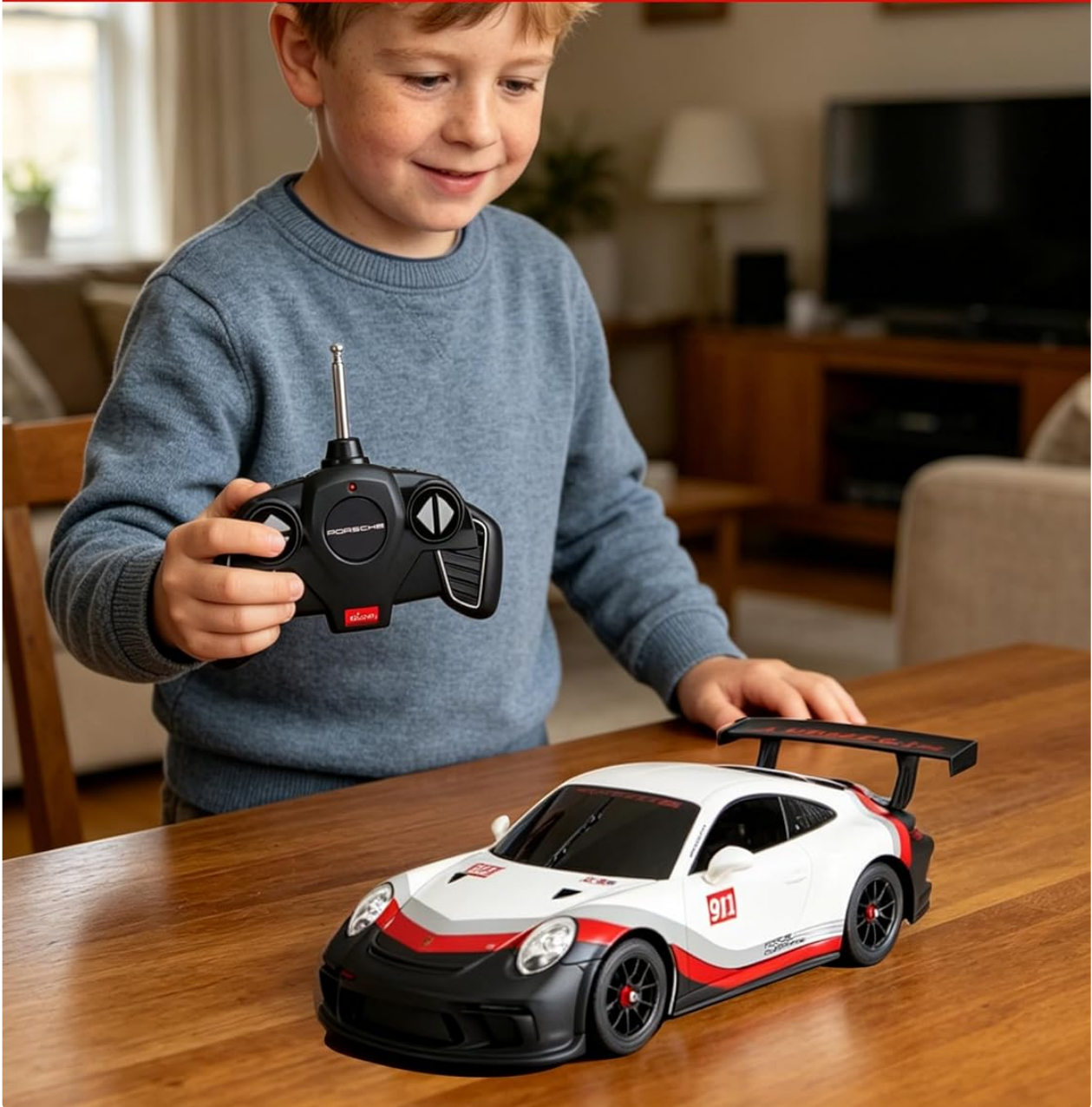
Image 2.1: The RC car and its remote controller, ready for battery installation.

Low Speed | Play | Display | Safety Materials