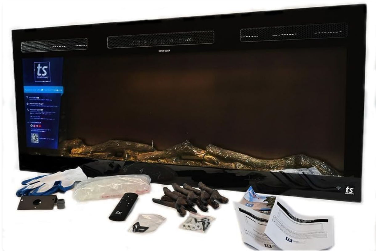
Image: The Touchstone Fury 50 Inch Electric Fireplace unit shown with its remote control, mounting hardware, crushed glass crystals, and log set.