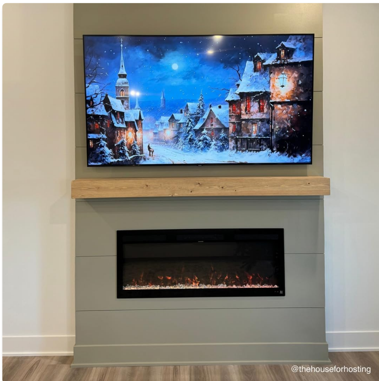
Image: The fireplace integrated into a living space, illustrating its ability to provide supplemental heat with timer and thermostat options.