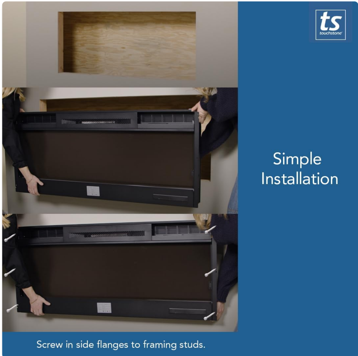
Image: A visual guide demonstrating the simple recessed installation process, from preparing the wall opening to securing the fireplace unit.

For recessed installation, ensure your wall framing is prepared according to the rough opening dimensions. The fireplace unit can then be inserted into the opening and secured by screwing the side flanges to the framing studs.