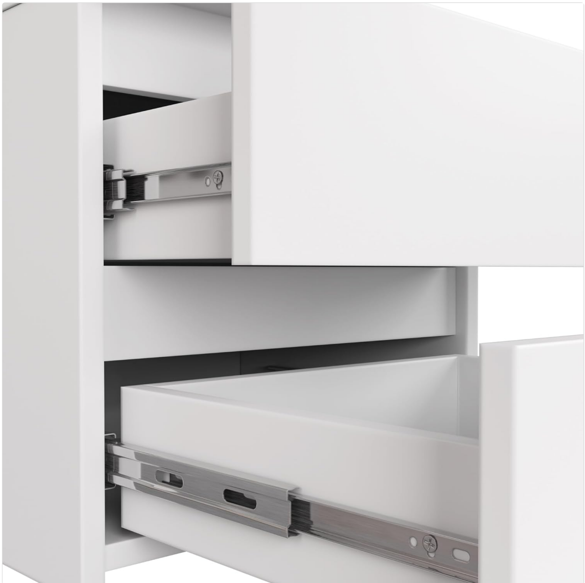
Image: Close-up of the roller drawer slides installed within the commode.

Attach the roller drawer slides to the inner sides of the commode frame. Ensure they are level and correctly oriented for smooth drawer operation.