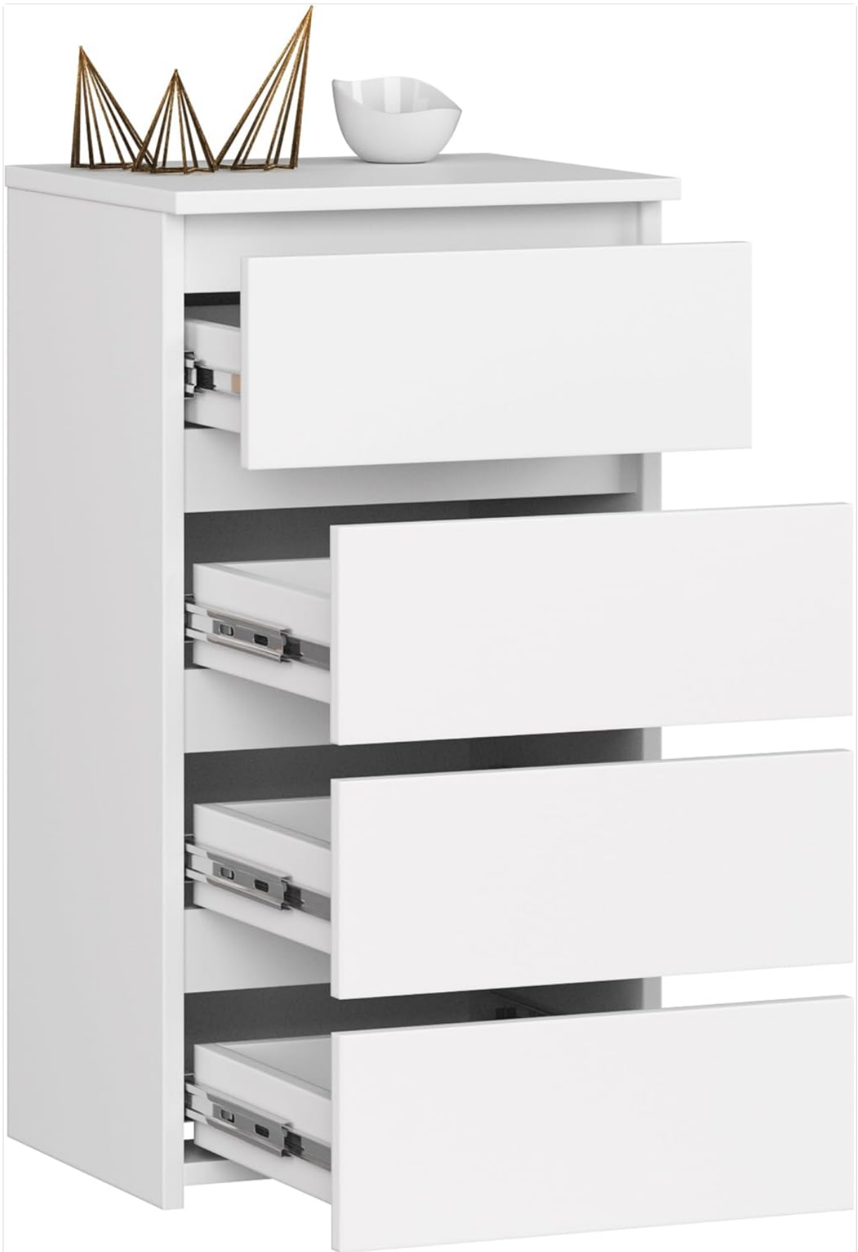
Image: The commode with all four drawers partially extended, showcasing the roller mechanism.