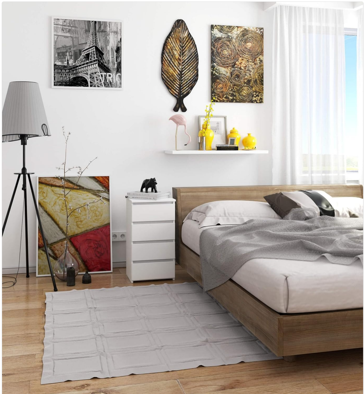
Image: The Akord 4-Drawer Commode positioned as a bedside table in a modern bedroom.