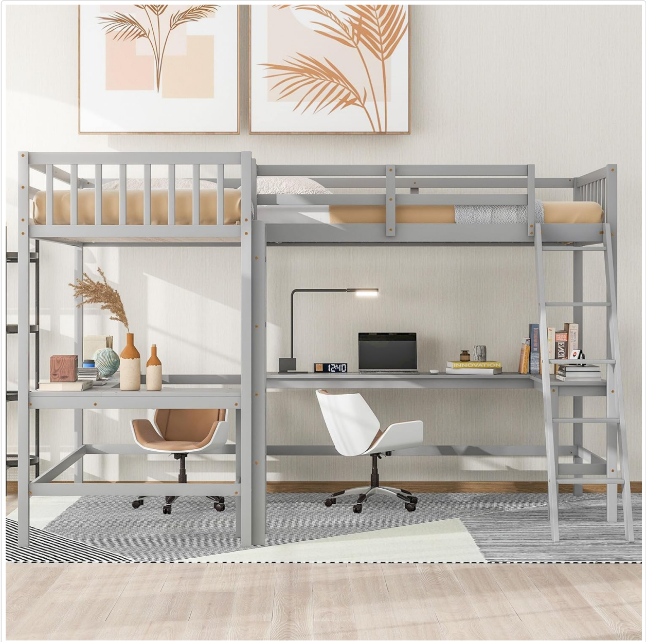
This image focuses on one segment of the loft bed, demonstrating the clear separation between the elevated twin bed and the dedicated workspace provided by the L-shaped desk.