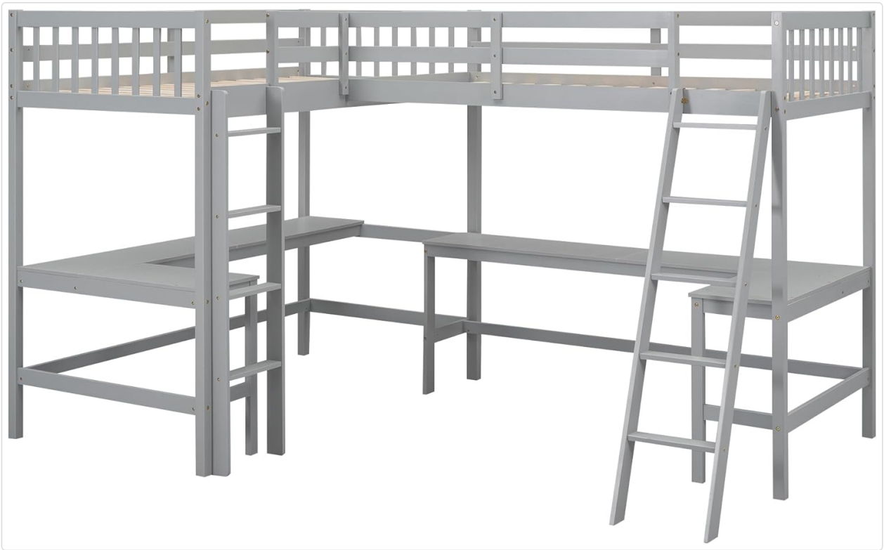
A detailed view of the L-shaped desk area, highlighting the sturdy construction and the integrated design that provides ample workspace.