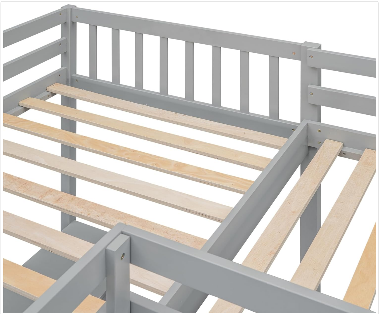
This image shows the robust wooden slat foundation designed to support the mattress, ensuring proper ventilation and durability for the twin beds.