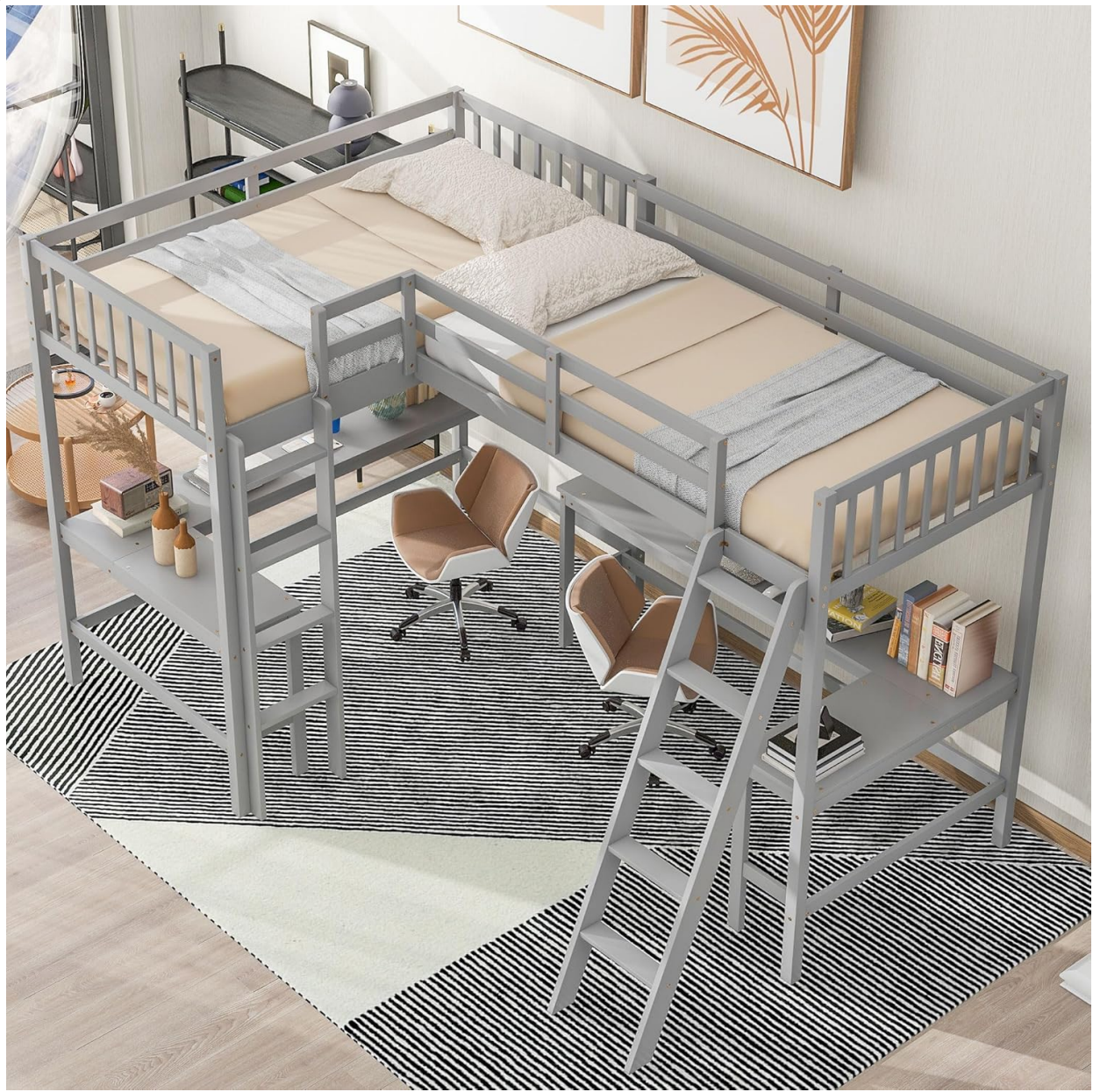
An overhead perspective of the loft bed, illustrating how the two twin beds are arranged in an L-shape, maximizing sleeping capacity while integrating the desk areas below.

storage, a reading nook, or a play area.