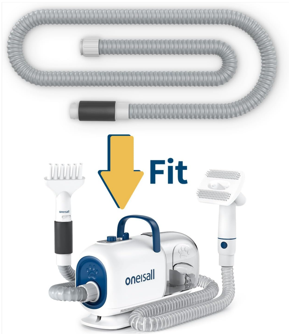
Image 1: The oneisall Blowing Horse attachment shown correctly connected to the hose of the main grooming vacuum unit. The image is labeled "Fit" to indicate proper assembly.