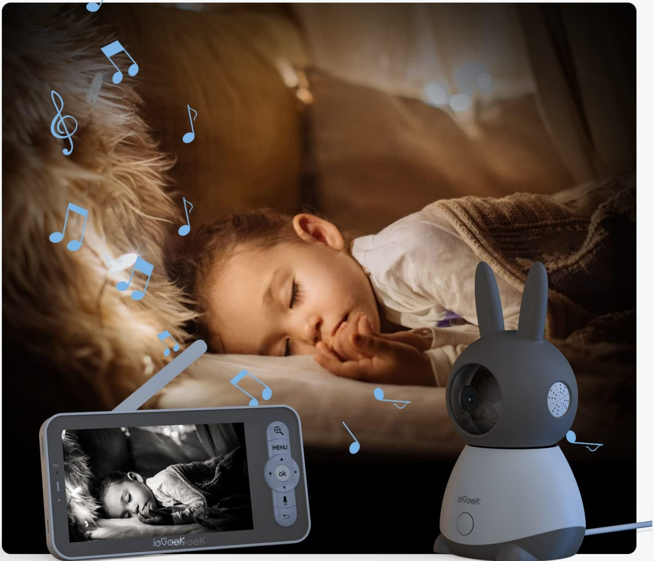
Image: Clear two-way audio feature, enabling communication with your baby.

Monitor your baby's sleep at any time during the night