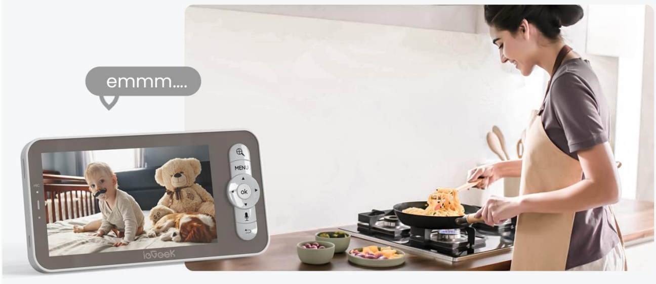
Image: Clear infrared night vision for monitoring your baby's sleep at night.