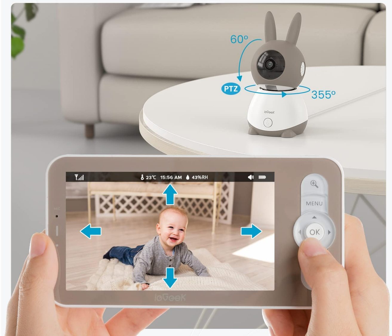
Image: ieGeek camera demonstrating its 360° vision and auto-tracking.

Automatic tracking baby's movement or remote control the camera