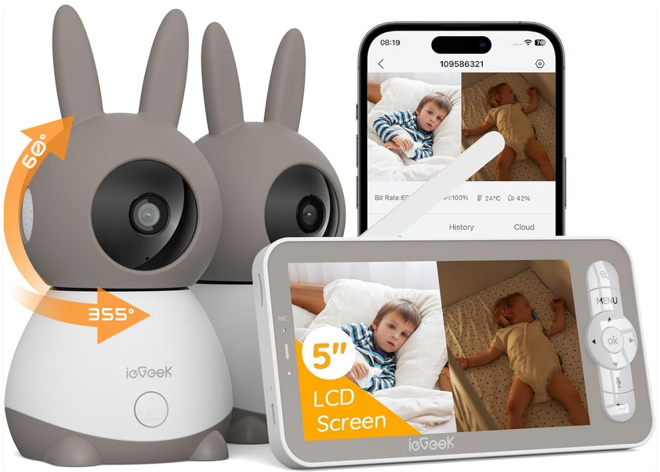
Image: The ieGeek 2K Split-Screen Baby Monitor system, showing the monitor and two cameras.