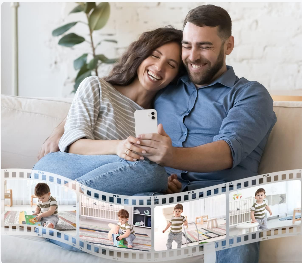
Image: Record and playback interesting moments of your baby at any time.

Capture and view cute clips of your baby at any time