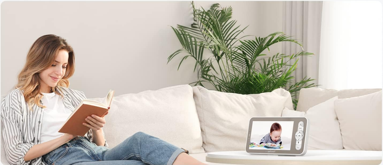
Image: Demonstrating monitoring options: via smartphone app for remote access and via the dedicated monitor for local use.