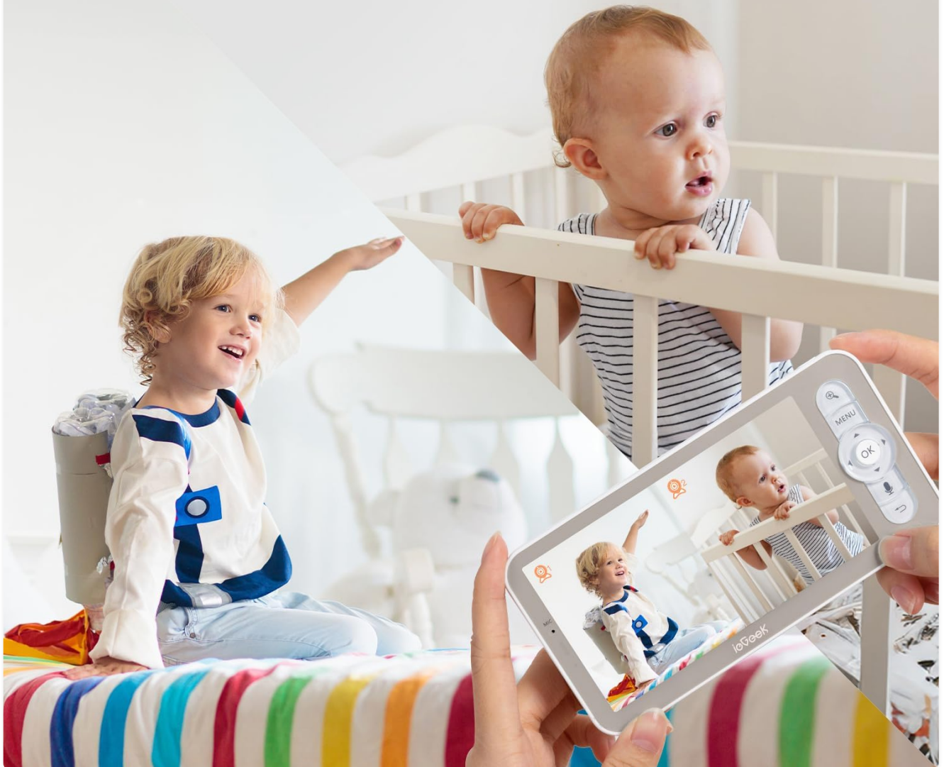
Image: One monitor displaying video streams from two cameras simultaneously.

display video streaming from two cameras on the same screen