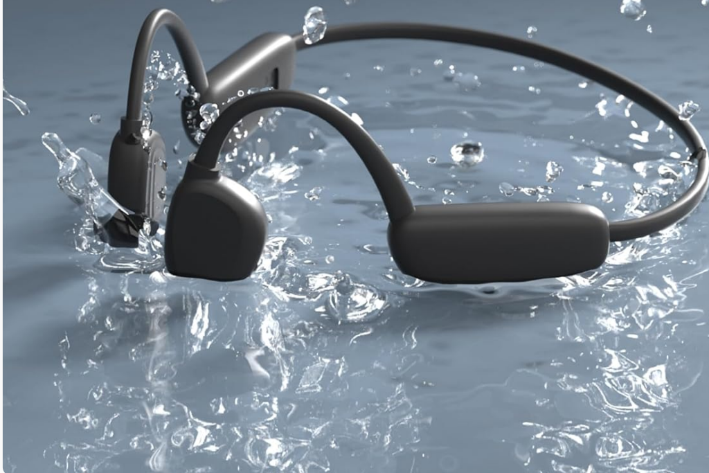
Image: The Yintar X17 headphones are shown partially submerged in water, emphasizing their IPX8 waterproof capability.

Build in 32GB Easy control Open-Ear comfort Safety & connection