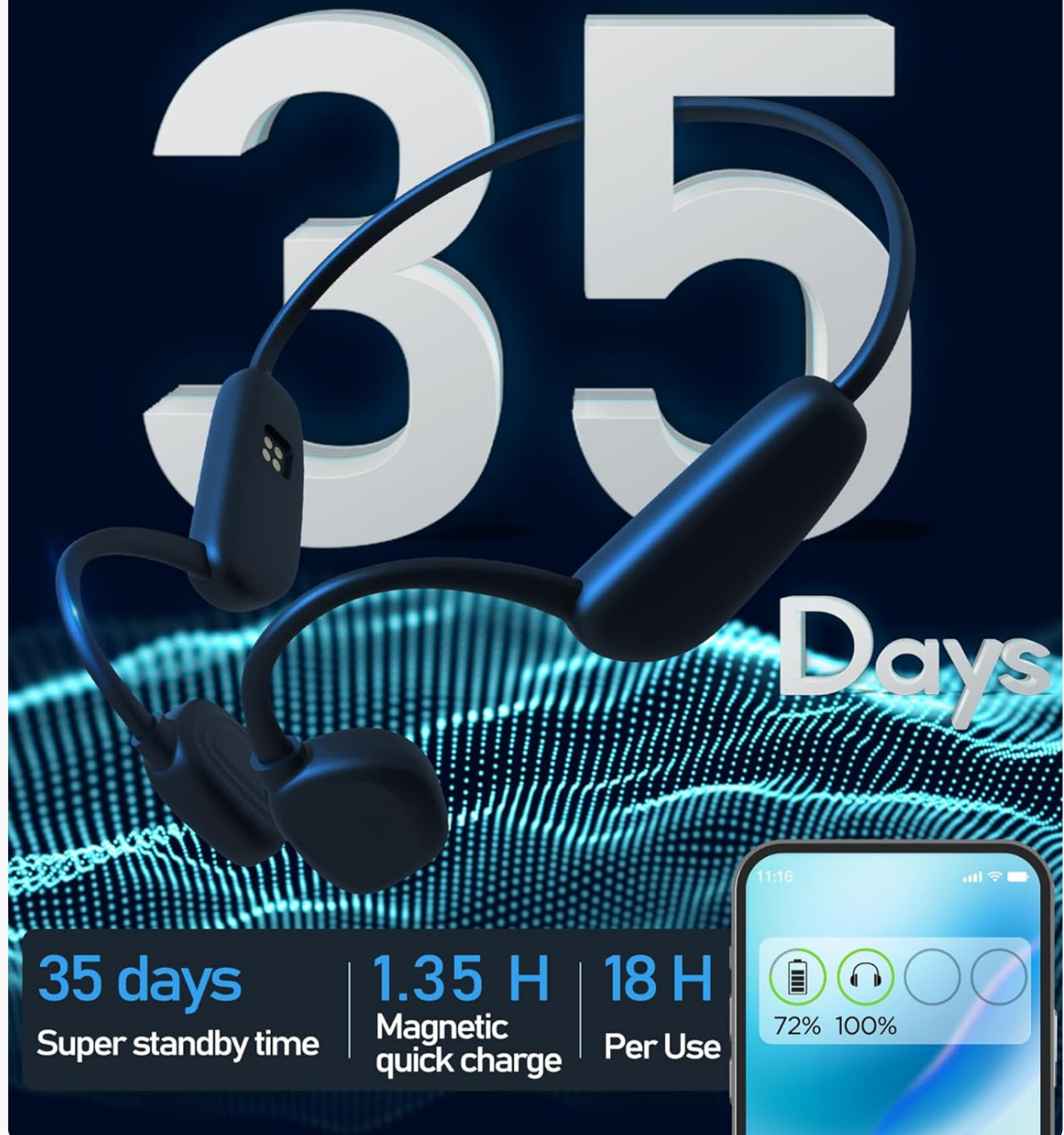
Image: A visual representation of the Yintar X17's battery performance, showing 35 days standby, 1.35 hours quick charge, and 18 hours playtime.