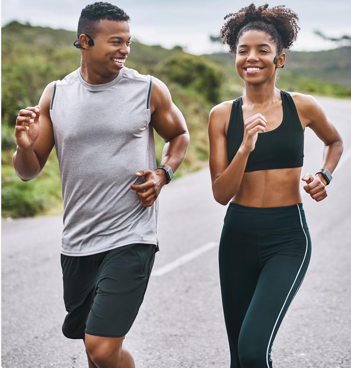
Image: A couple is shown running while wearing the Yintar X17 headphones, demonstrating their secure and stable fit during exercise.

Your browser does not support the video tag.