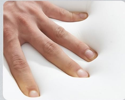
Image: A detailed view of the wide, thick padded seat cushion, highlighting its high-density memory foam for comfort and support.