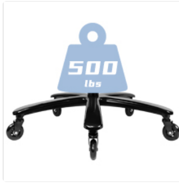
Image: A close-up view of the chair's sturdy five-star metal base and smooth-rolling wheels, highlighting its stability.

Image: Detailed dimensions of the Kassipo office chair, including height, width, and depth measurements for various components.