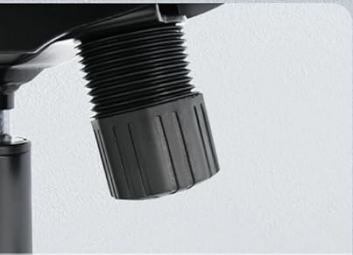
Rocking Pressure Adjustor