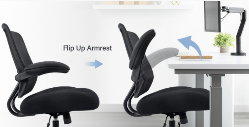
Image: A demonstration of the chair's flip-up armrests, showing how they can be raised to save space or allow closer access to a desk.

The ability to flip up the armrests when not in use allows for better space utilization.