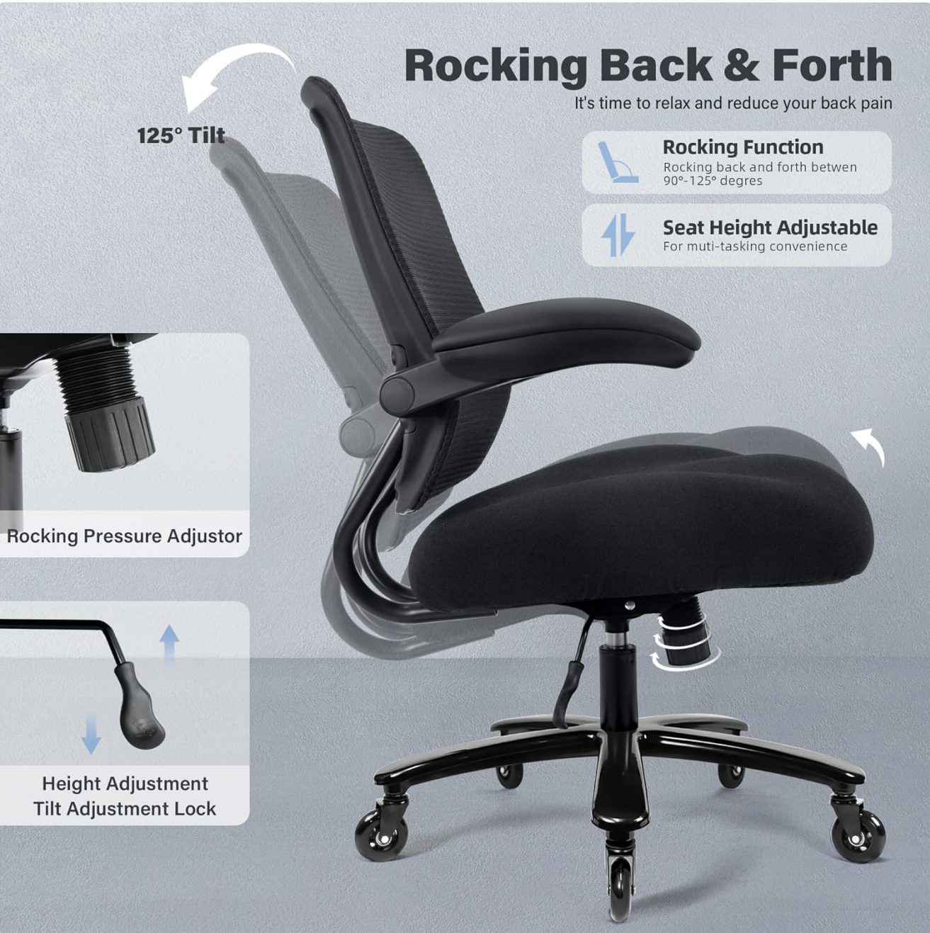
Image: Visual guide to the chair's rocking function (up to 125° tilt) and seat height adjustment lever, including the rocking pressure adjustor.