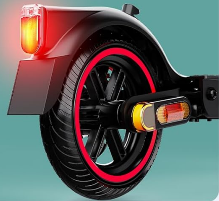
Image: The scooter's lighting system, including front and rear turn signals and the headlight.

Be seen from behind. The red taillight keeps you visible in dim conditions and bad weather.