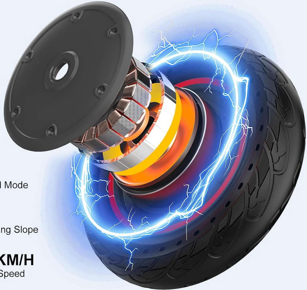
Image: An exploded view of the 350W brushless motor, highlighting its components.