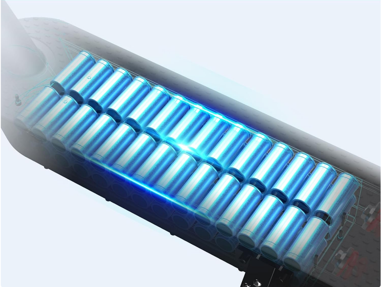
Image: A cutaway view of the scooter's deck, revealing the 7.8AH lithium battery cells.

Powering your ride with a 7.8Ah battery for up to 30 km(18.6 Miles). Our integrated BMS ensures comprehensive protection for safe, reliable, and long-lasting performance.