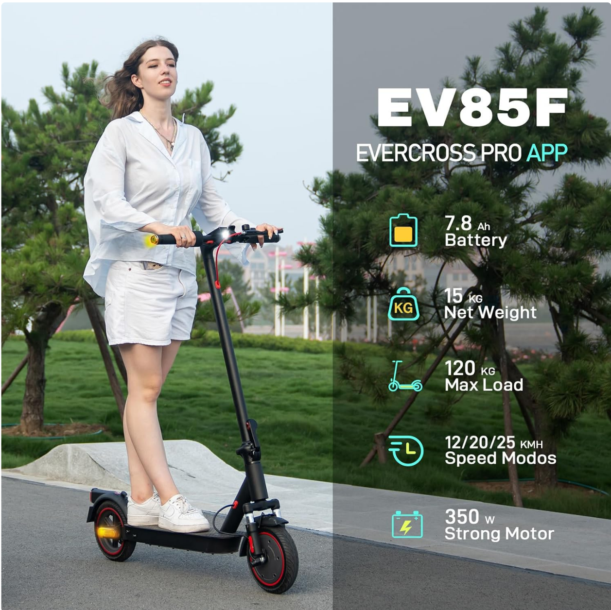
Image: The EVERCROSS EV85F Electric Scooter in use, showcasing its compact design and key specifications.