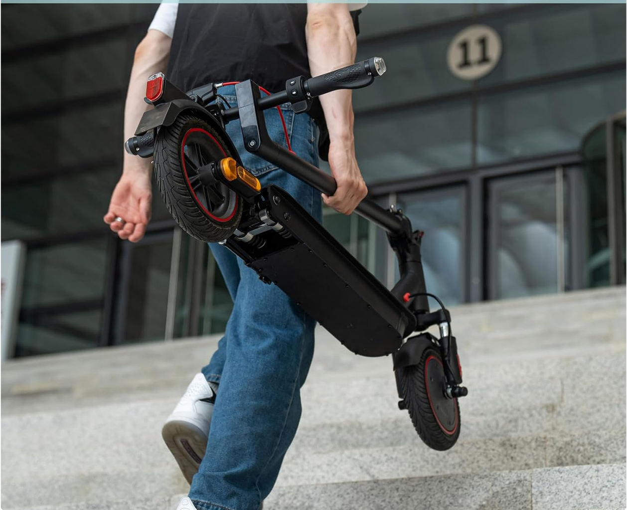
Image: The scooter in its folded state, demonstrating its portability.