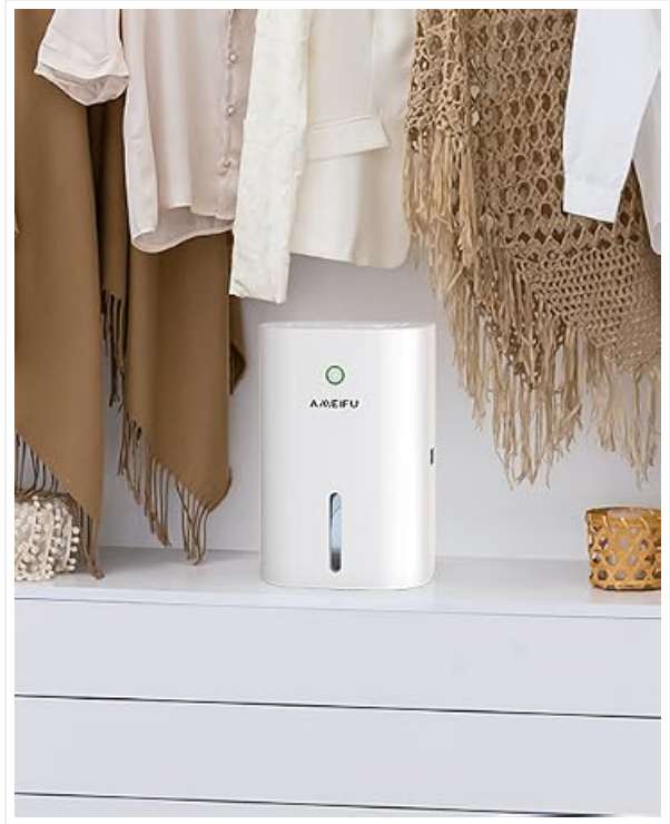
Images: The dehumidifier in a washroom and a closet, demonstrating its versatility.