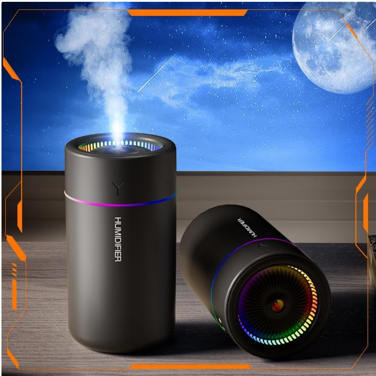
Image 1.1: The KISSWILL LMH-1 Mini USB Desktop Humidifier in operation, showing mist output and ambient lighting.