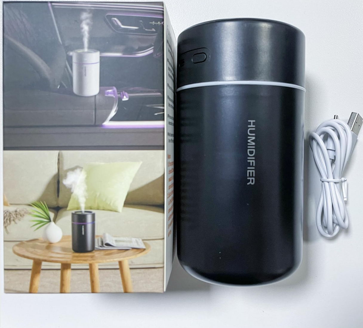
Image 2.1: The humidifier body, instruction manual, and USB-C cable as included in the package.