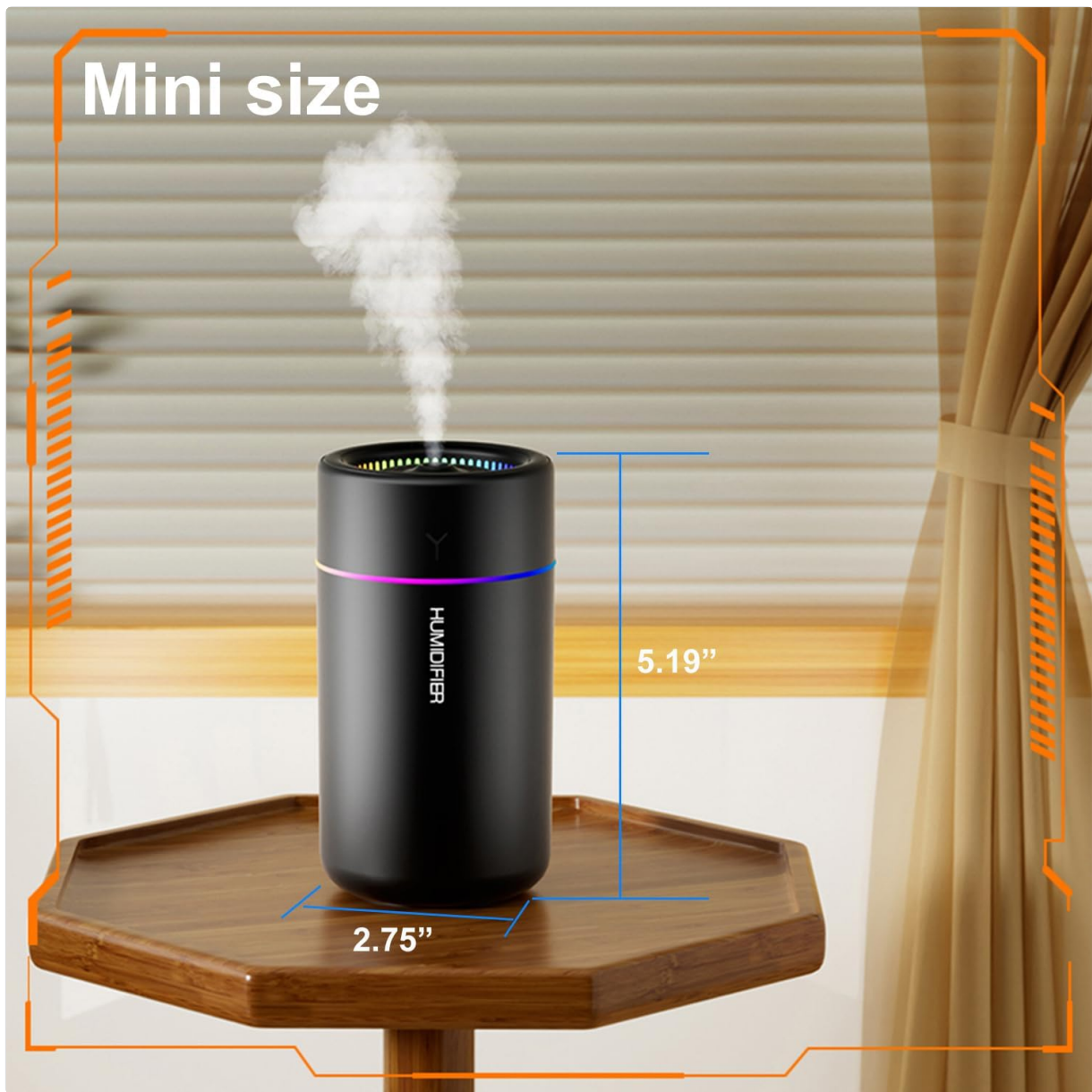
Image 8.1: The physical dimensions of the humidifier, approximately 2.75 inches in diameter and 5.19 inches in height.