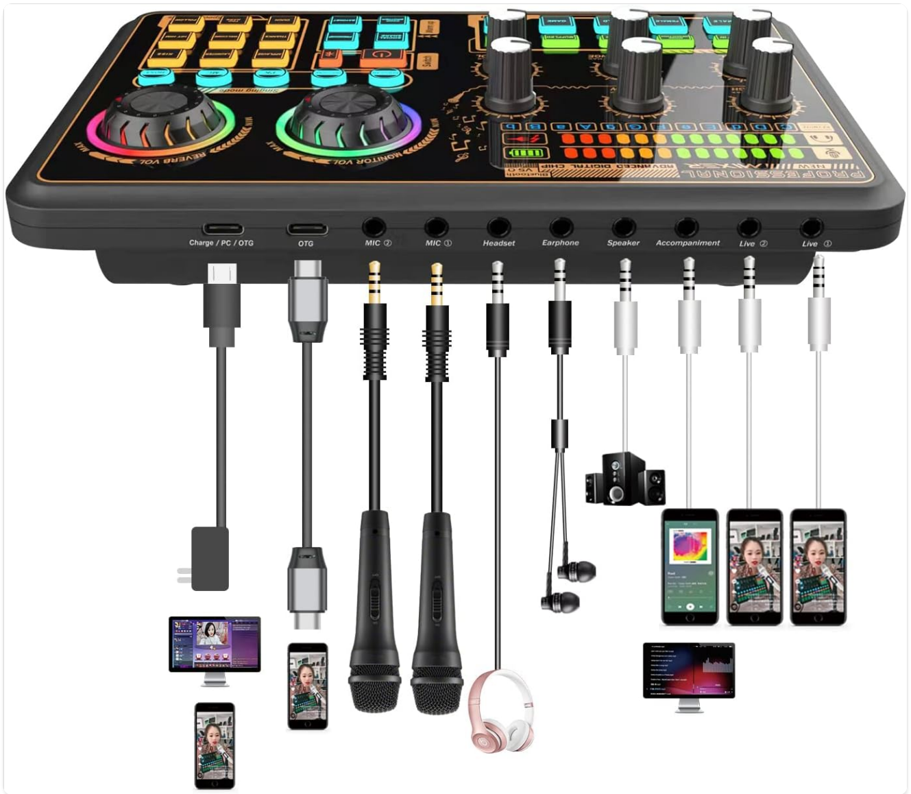
Figure 7: The Hosabely SK600-CC Audio Mixer showcasing its vibrant, multi-color LED breathing lights, which synchronize with audio input.