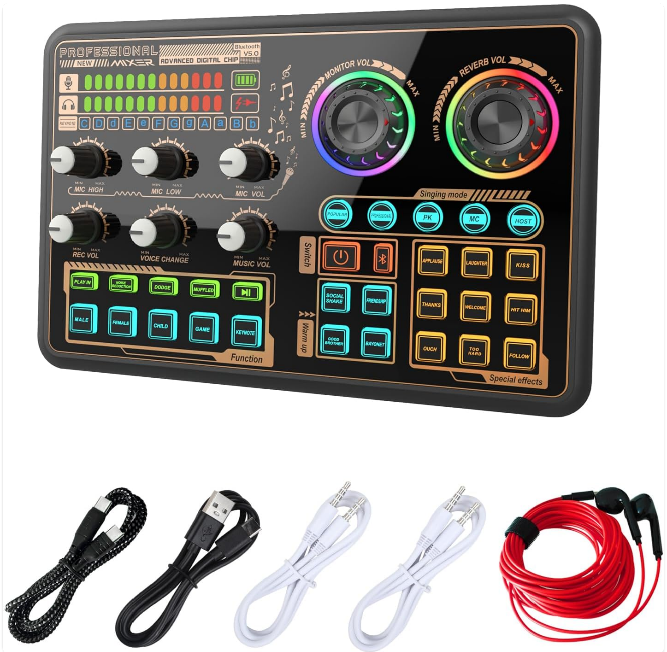
Figure 1: Front view of the Hosabely SK600-CC Audio Mixer, showcasing its control panel and LED lights.