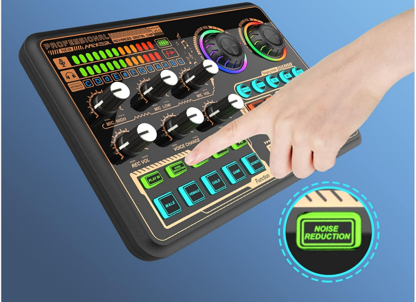
Figure 3: The Hosabely SK600-CC mixer highlighting its multi-device and multi-system compatibility, including Android, Windows, iOS, PC, Laptop, and Tablet/iPad.

Focus on your sound, away from background noise