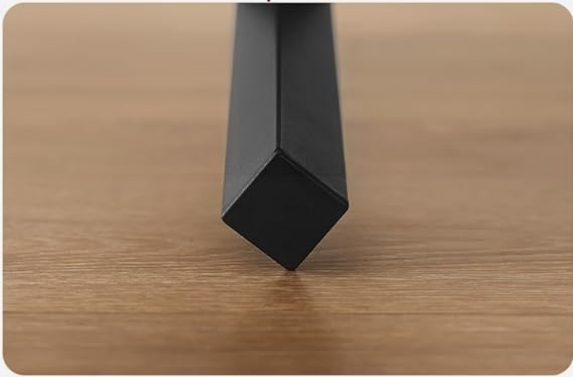
Anti-Slip Pads on the Chairs

Image: Close-up view of the adjustable table feet and anti-slip pads on the chairs, which help maintain stability.