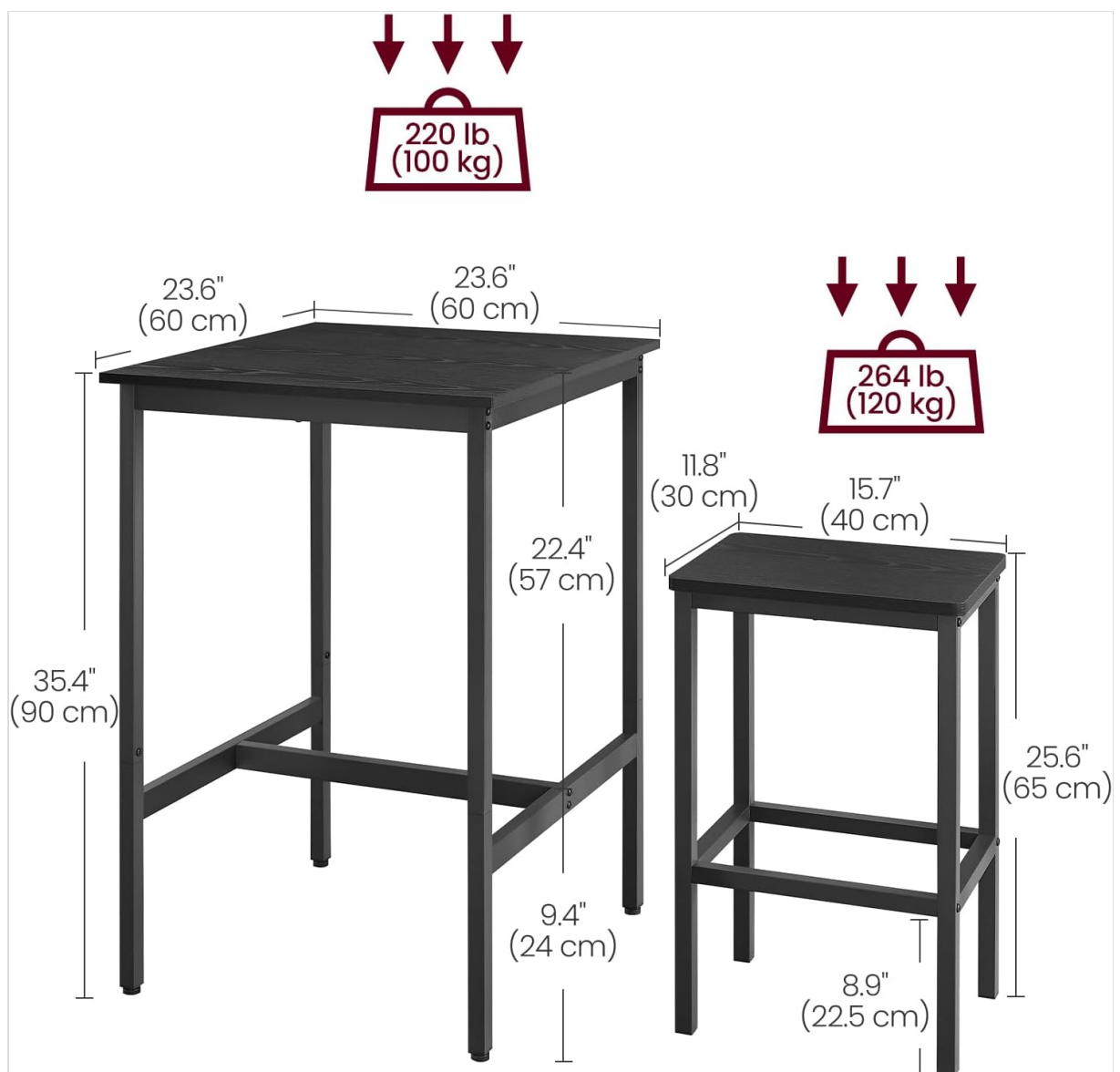
Image: Dimensions of the VASAGLE Bar Table and Chairs Set, showing the table at 23.6"D x 23.6"W x 35.4"H and chairs