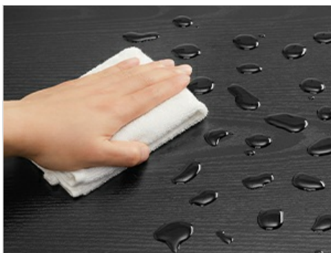
Image: A hand wiping the table surface with a cloth, illustrating proper cleaning technique.