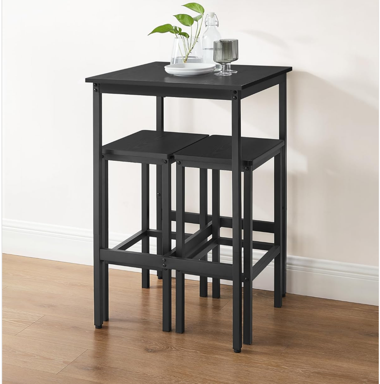
Image: The bar table with both stools neatly tucked underneath, demonstrating its space-saving feature.