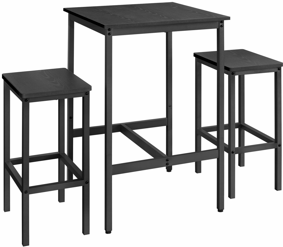
Image: The VASAGLE Bar Table and Chairs Set, featuring a square table and two stools in an ebony black and ink black finish.