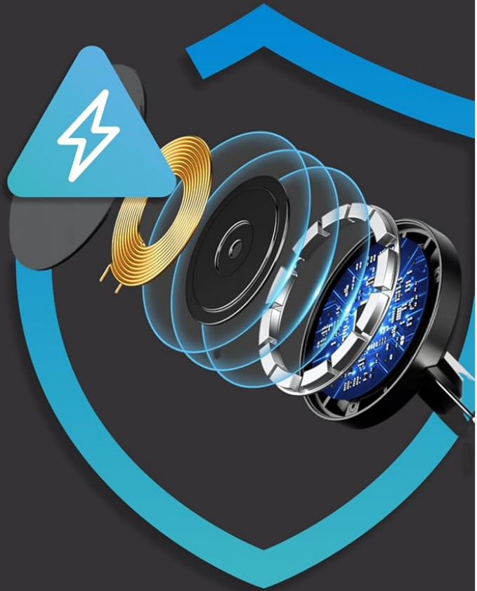
Image: An infographic detailing the built-in safety mechanisms of the charging station, including protection against lightning, short-circuits, overcharging, and overvoltage.