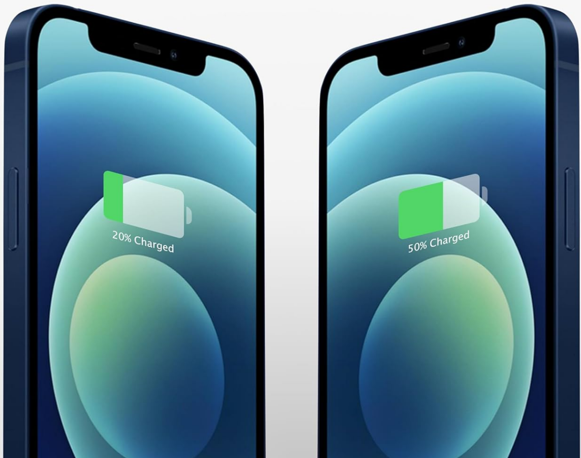
Image: A visual comparison illustrating that 15W charging is 2.5 times faster than 5W charging, reaching 50% charge in 30