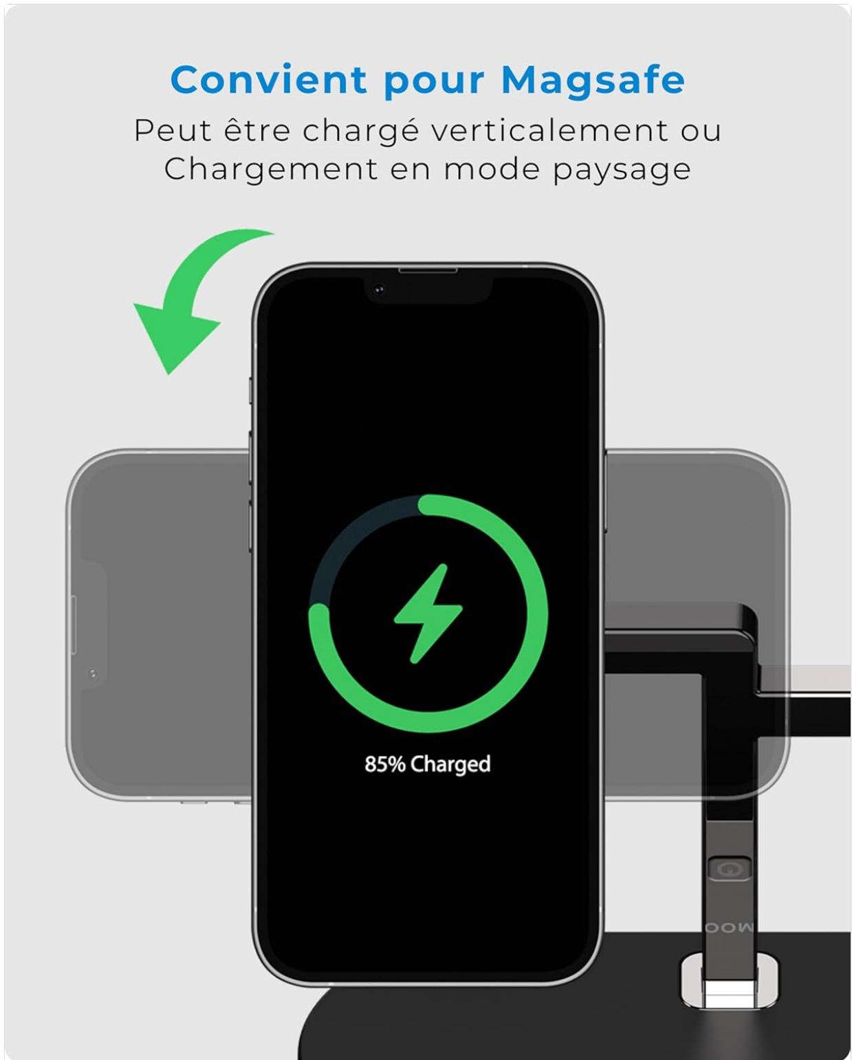
Image: A smartphone charging on the MagSafe-compatible stand, demonstrating both vertical and horizontal charging positions.