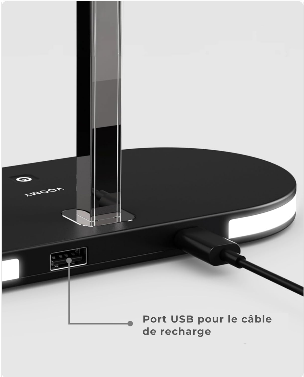
Image: A detailed view of the charging station's side, showing the USB-C input port for power and an additional USB-A output port for wired charging.