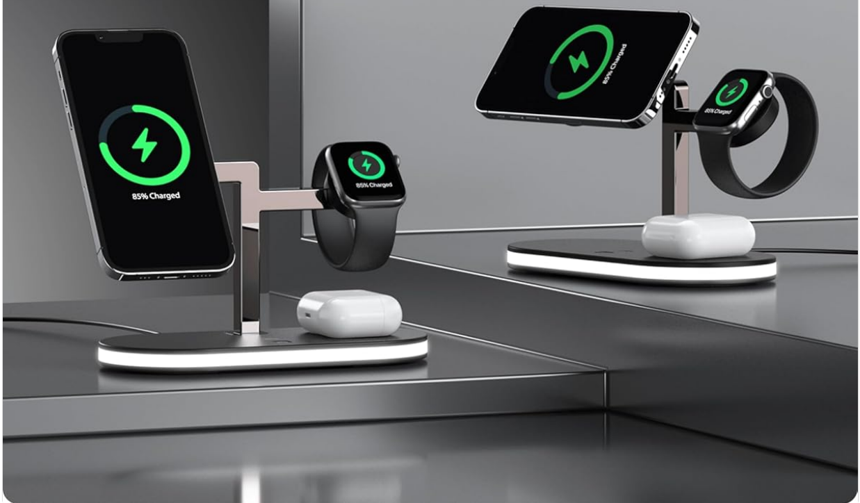
Image: An illustration highlighting the station's capabilities: three wireless charging zones, 15W fast charging, and a 3-position LED light.