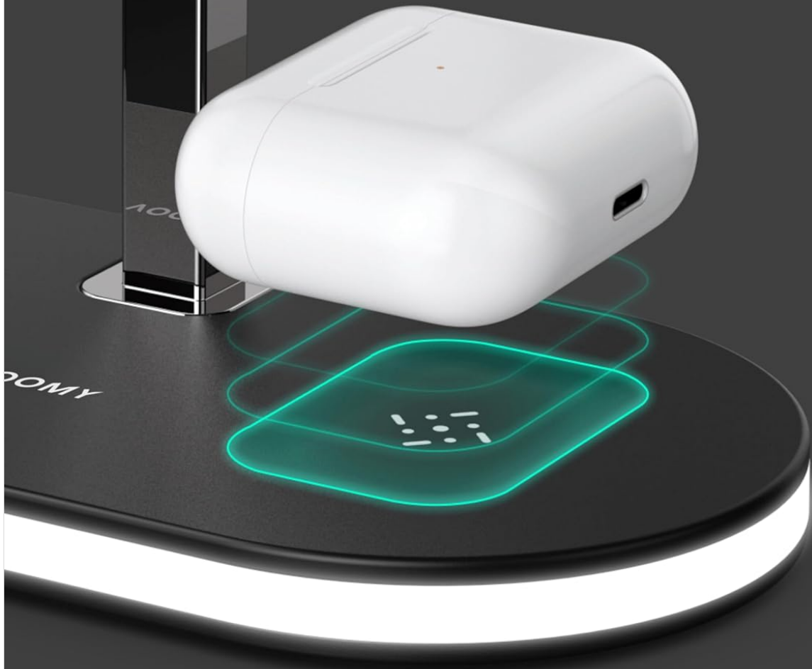
Image: A wireless earbud case placed on the charging base of the station, indicating wireless charging in progress.