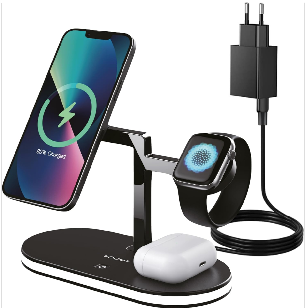
Image: The VOOMY 3-in-1 Wireless Charging Station, showcasing a smartphone charging vertically, a smartwatch on its dedicated pad, and wireless earbuds on the base, alongside the included power adapter.