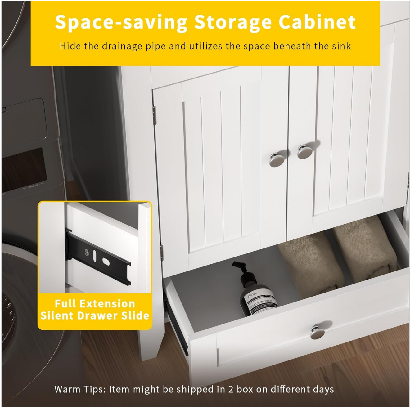
Image 4.1: Detail of the full extension silent drawer slide for the cabinet drawer.

Video 4.1: Demonstration of 3-in-1 connector and wooden drawer installation for VINGLI cabinets. This video illustrates key assembly steps for cabinet components.