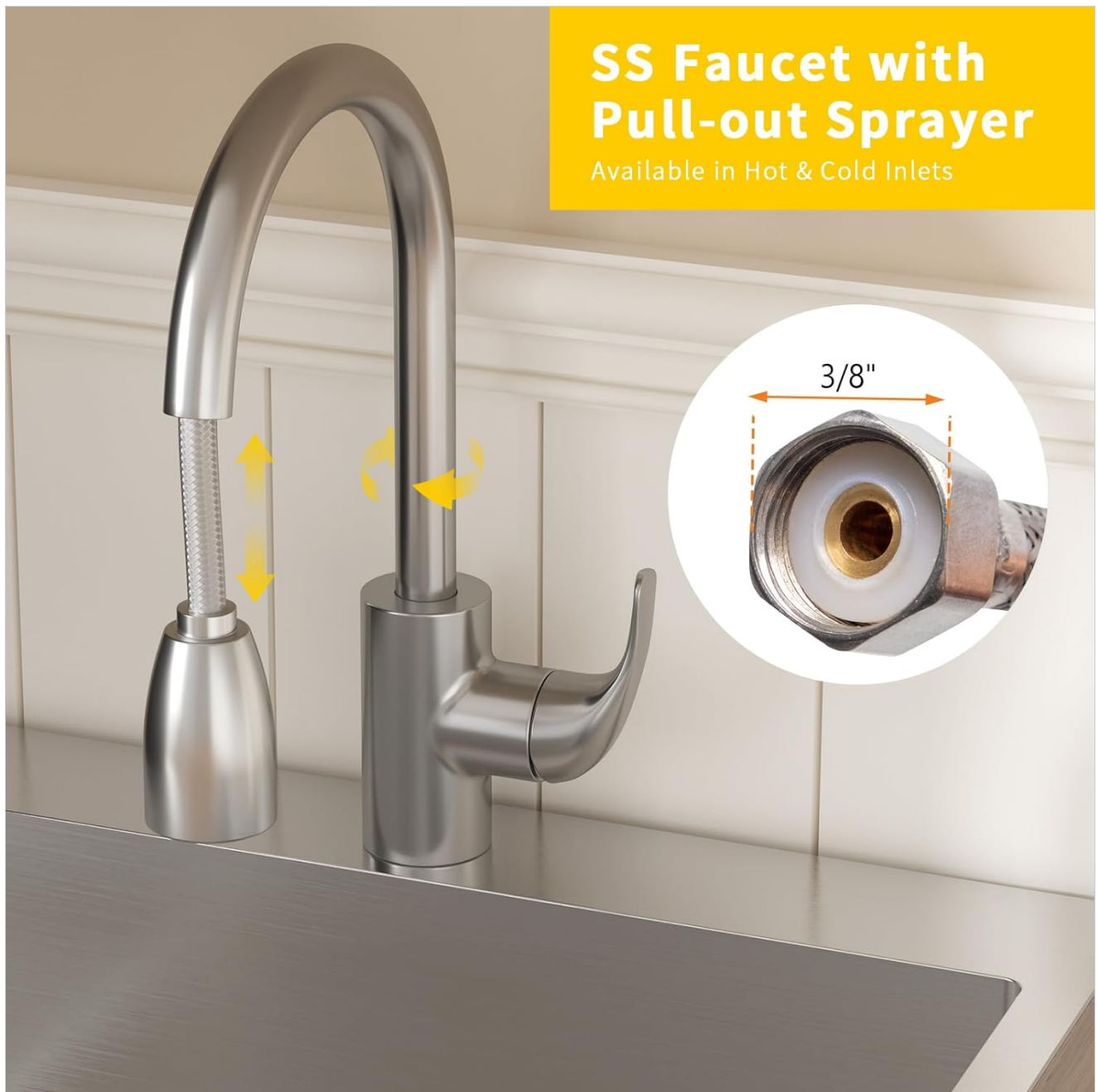
Image 4.3: Detail of the stainless steel pull-out sprayer faucet, showing hot and cold inlets.