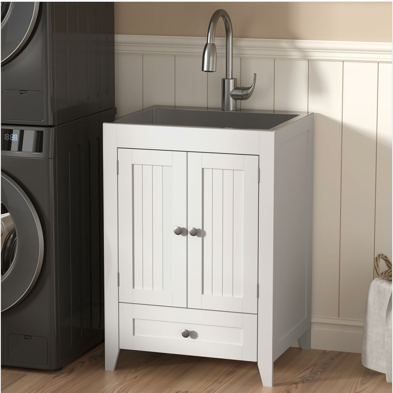
Image 1.1: VINGLI 24-Inch Laundry Sink with Cabinet and Pull-Out Sprayer Faucet.