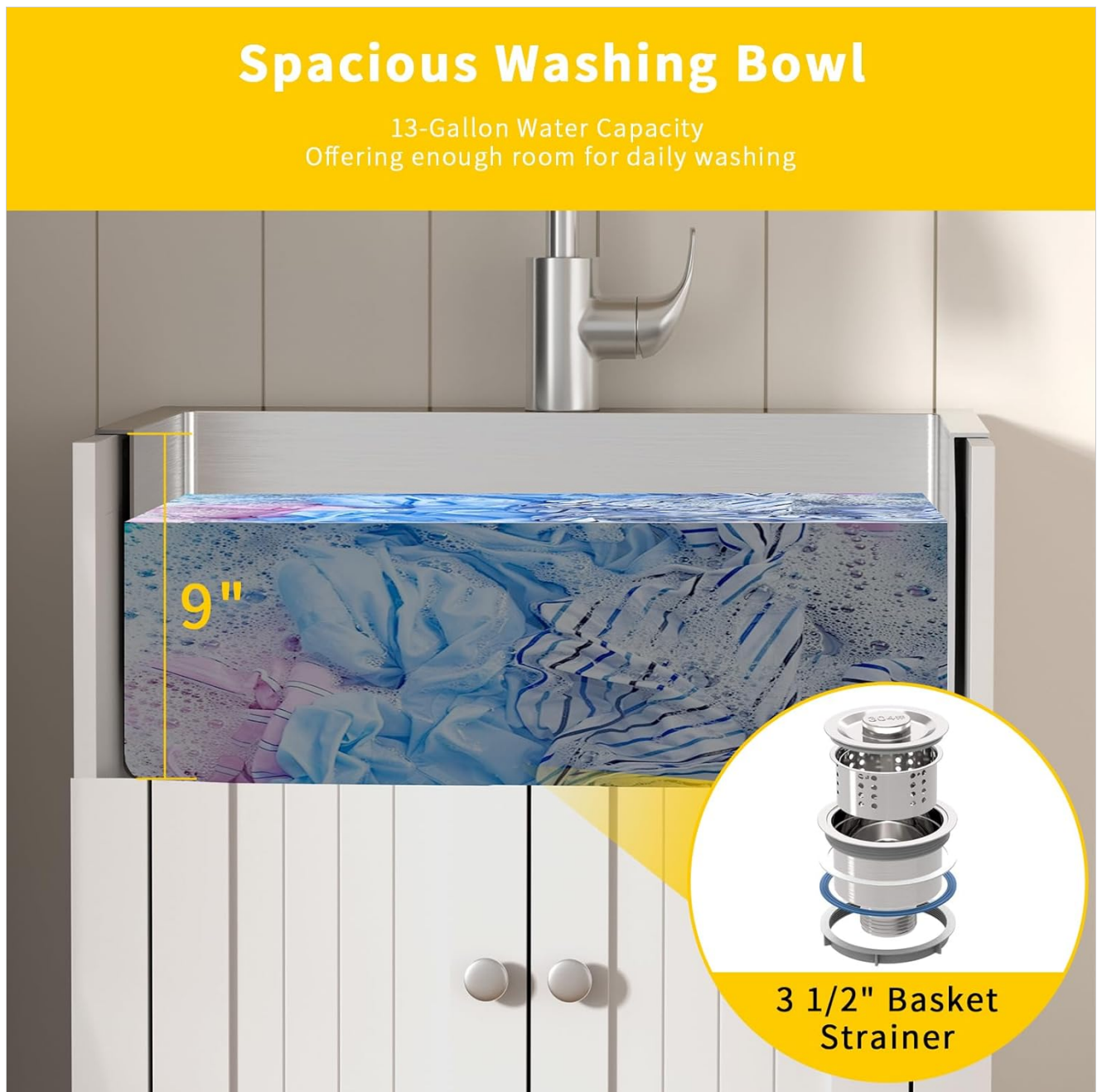
Image 5.1: The spacious washing bowl, illustrating its 9-inch depth and 13-gallon water capacity.

The 9-inch deep stainless steel sink provides ample space for various tasks, including handwashing laundry, cleaning tools, or bathing small pets. The 3 1/2" basket strainer helps prevent clogs.