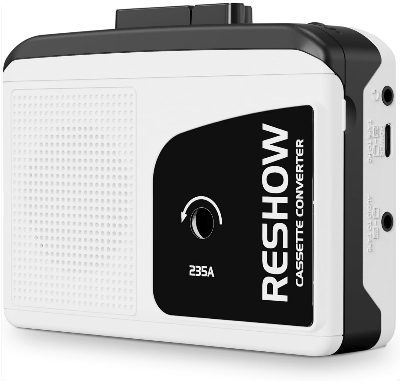
Figure 1: Reshow Portable Cassette Recorder Player (White model).