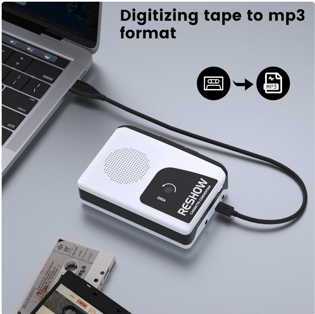
Figure 4: The Reshow Cassette Player connected to a laptop via USB-C for digitizing tapes to MP3 format.

Video 5: A demonstration of how to convert cassette tapes to MP3 format using the USB-C connection and audio software.