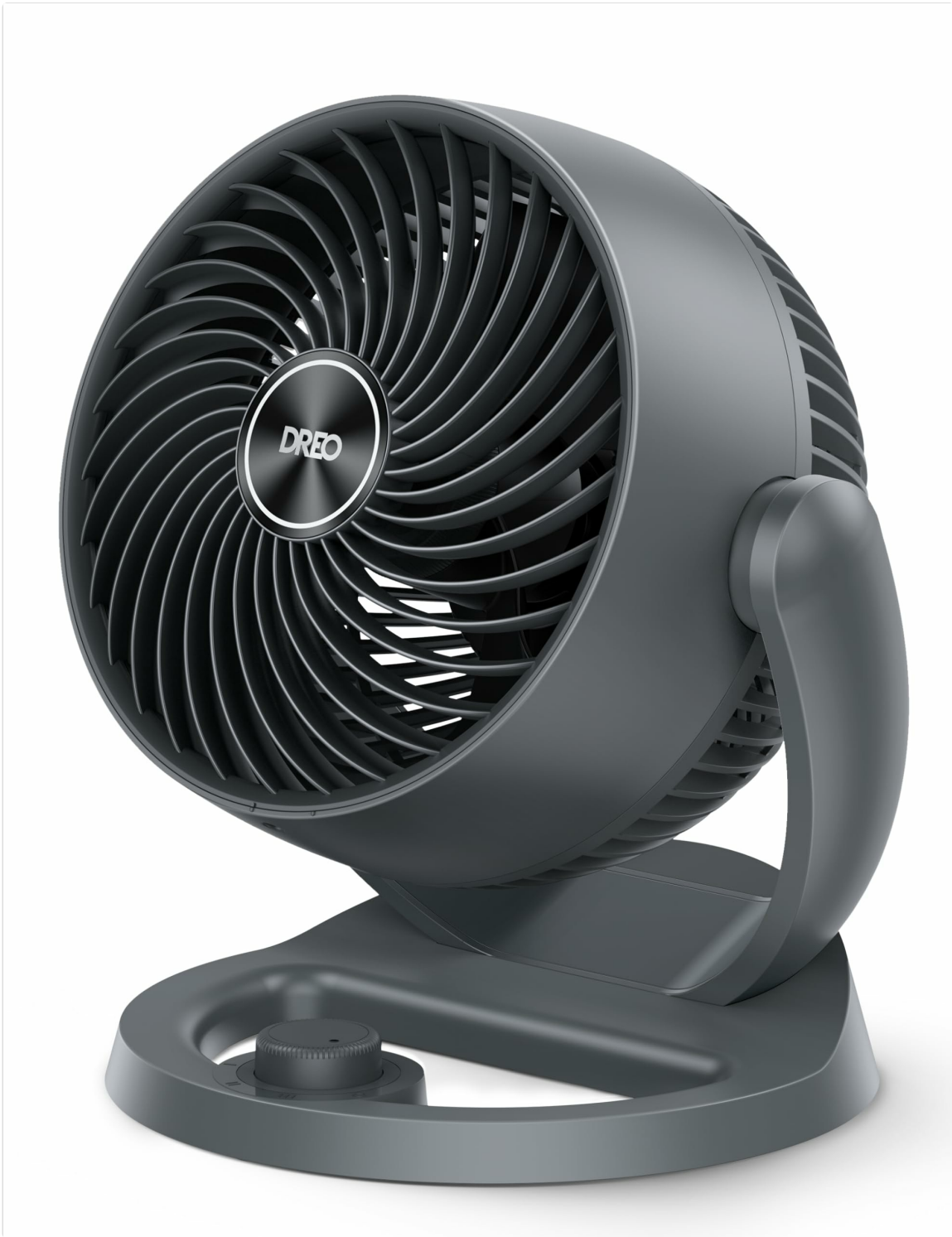
Figure 2.1: Front view of the Dreco Desk Fan DR-HAF002.