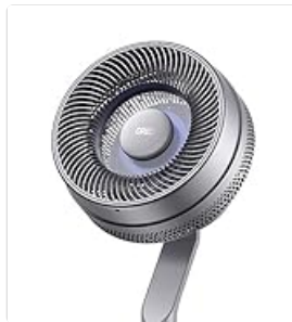
Figure 4.1: The fan offers a 120° adjustable tilt for precise airflow direction.

Your browser does not support the video tag.