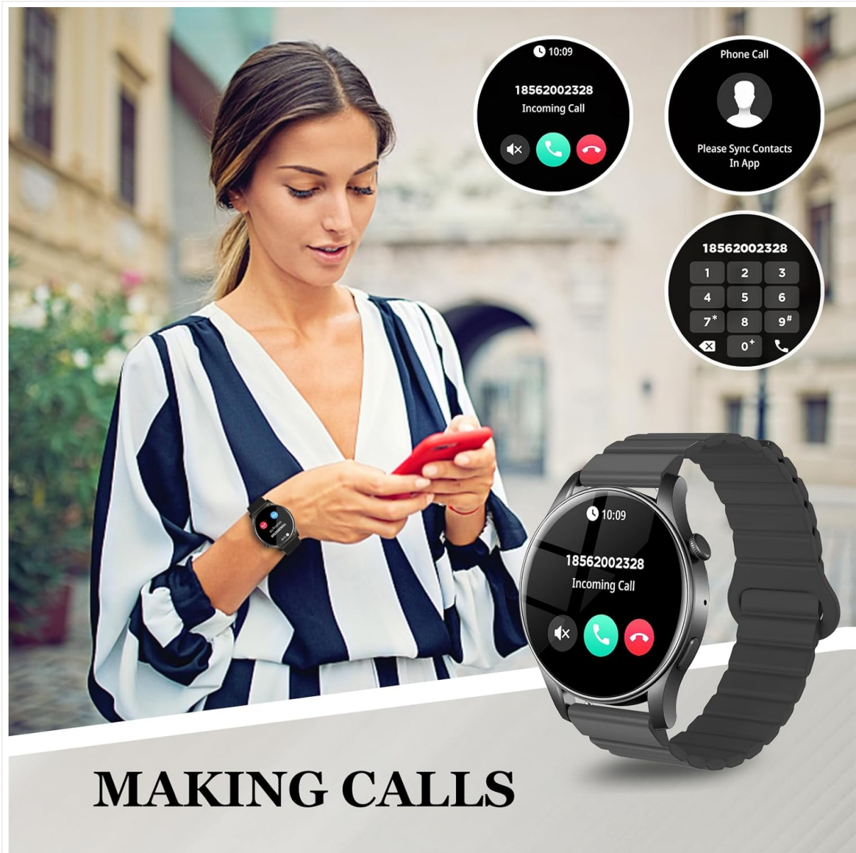
Image: A woman interacting with her Efolen Smart Watch, which displays an incoming call. Insets show the call interface and a dial pad.