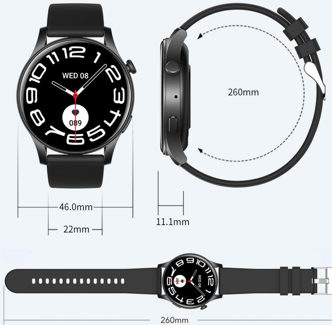
Image: A technical diagram illustrating the dimensions of the Efolen Smart Watch, including its diameter and thickness.