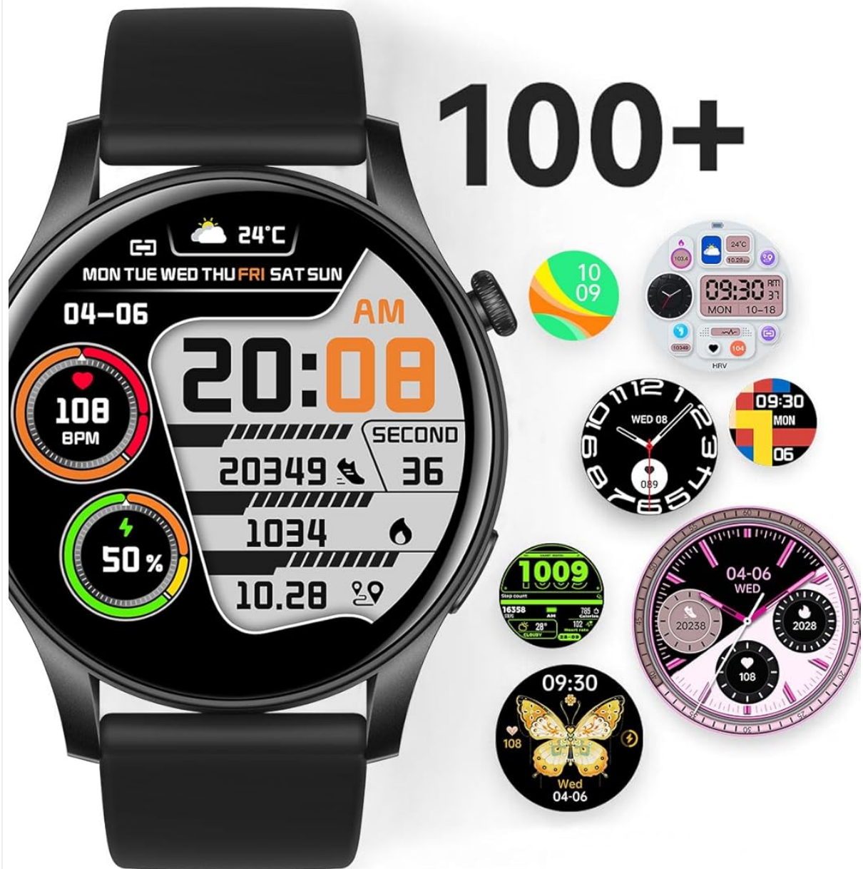
Image: The Efolen Smart Watch displaying various customizable watch faces, highlighting the "Self styled fashion dial" feature.

Simplicity, sportiness, fashion Various styles of dials allow you to switch freely, Pair with different styles of clothing for sports, daily life, and business, Make it easy for you to navigate various occasions.