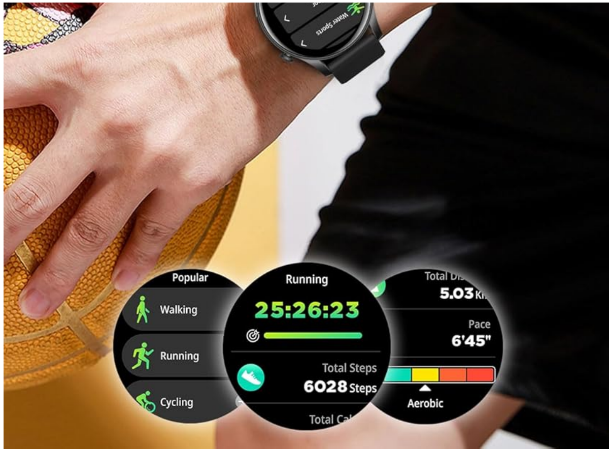
Image: A person wearing the Efolen Smart Watch during a workout, with the watch screen displaying various sports modes and activity metrics.