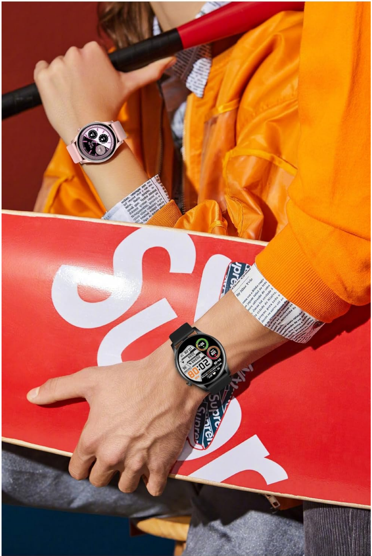
Image: A person wearing the Efole Smart Watch on their wrist, demonstrating proper fit.