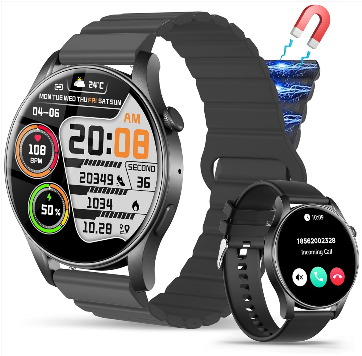
Image: The Efolen Smart Watch with its magnetic charging cable and a second watch showing an incoming call screen.