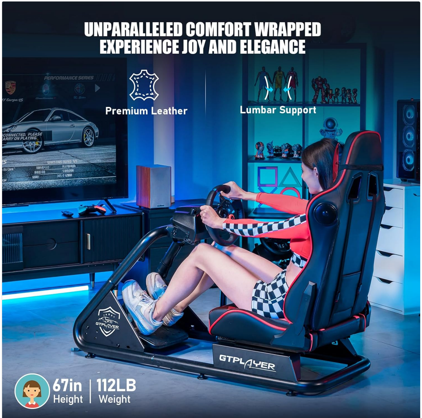
Figure 5: The racing seat offers a wide range of recline options for comfort during long sessions.