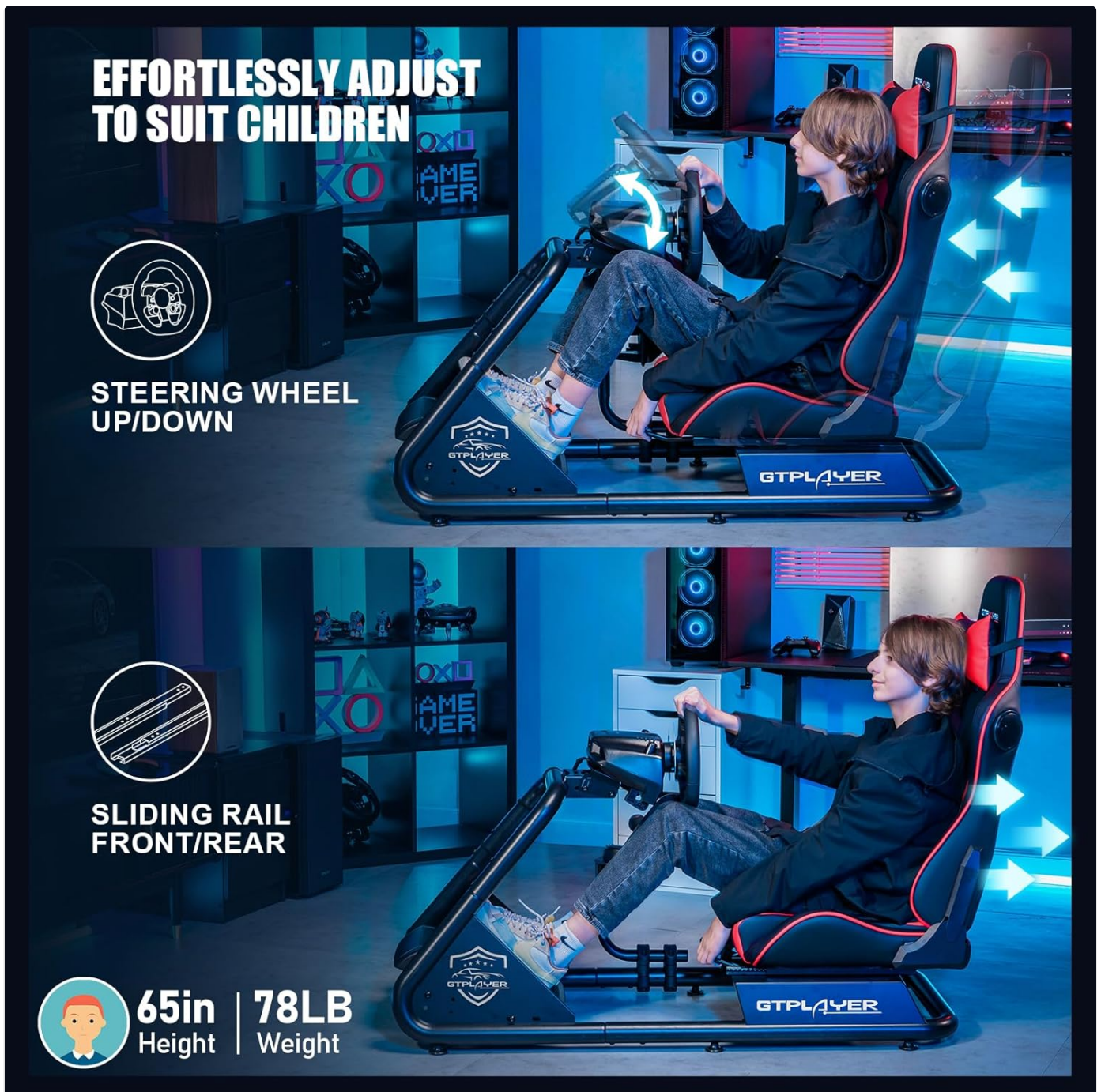
Figure 4: The pedal plate can be adjusted to various positions to optimize pedal reach and comfort.