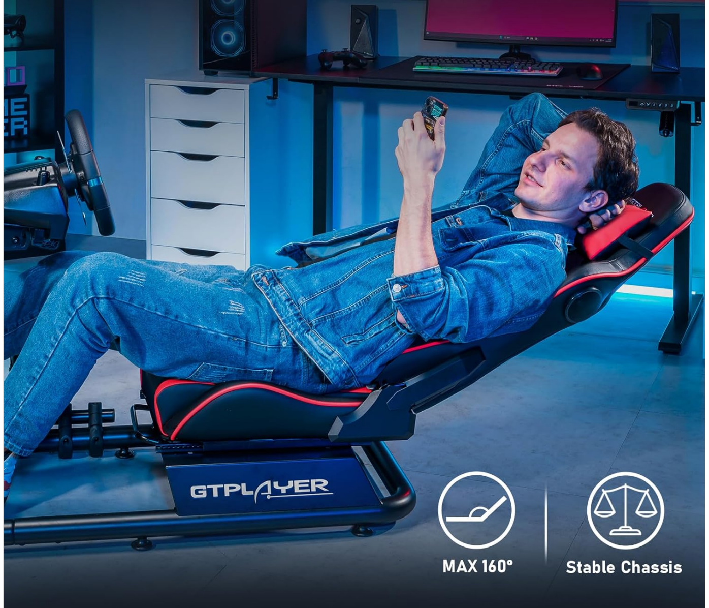
Figure 6: The seat can recline significantly, providing a comfortable position for breaks or different racing styles.