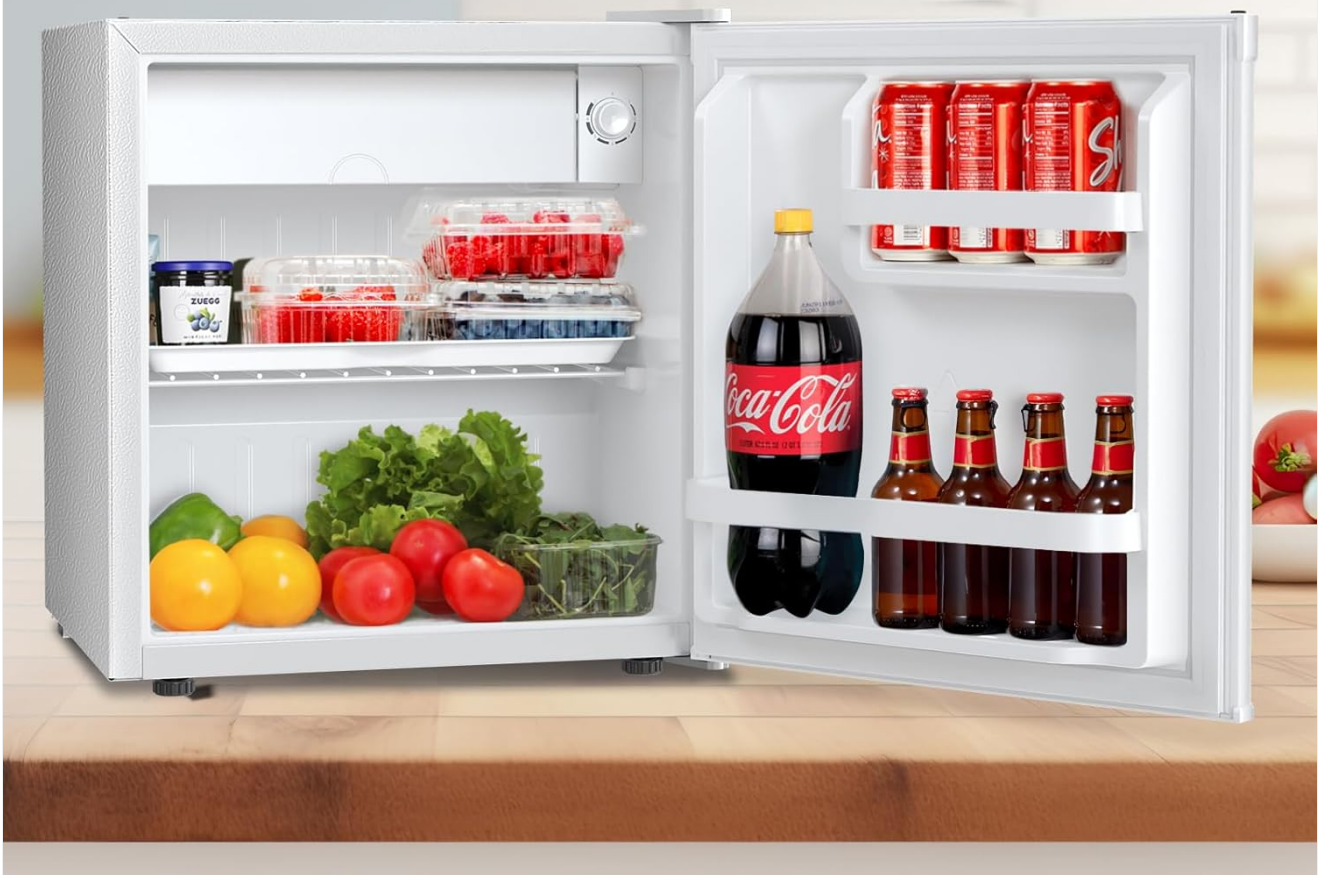
Image 2: Key features highlighting the compact design, energy efficiency, manual defrost, and freshness capabilities.