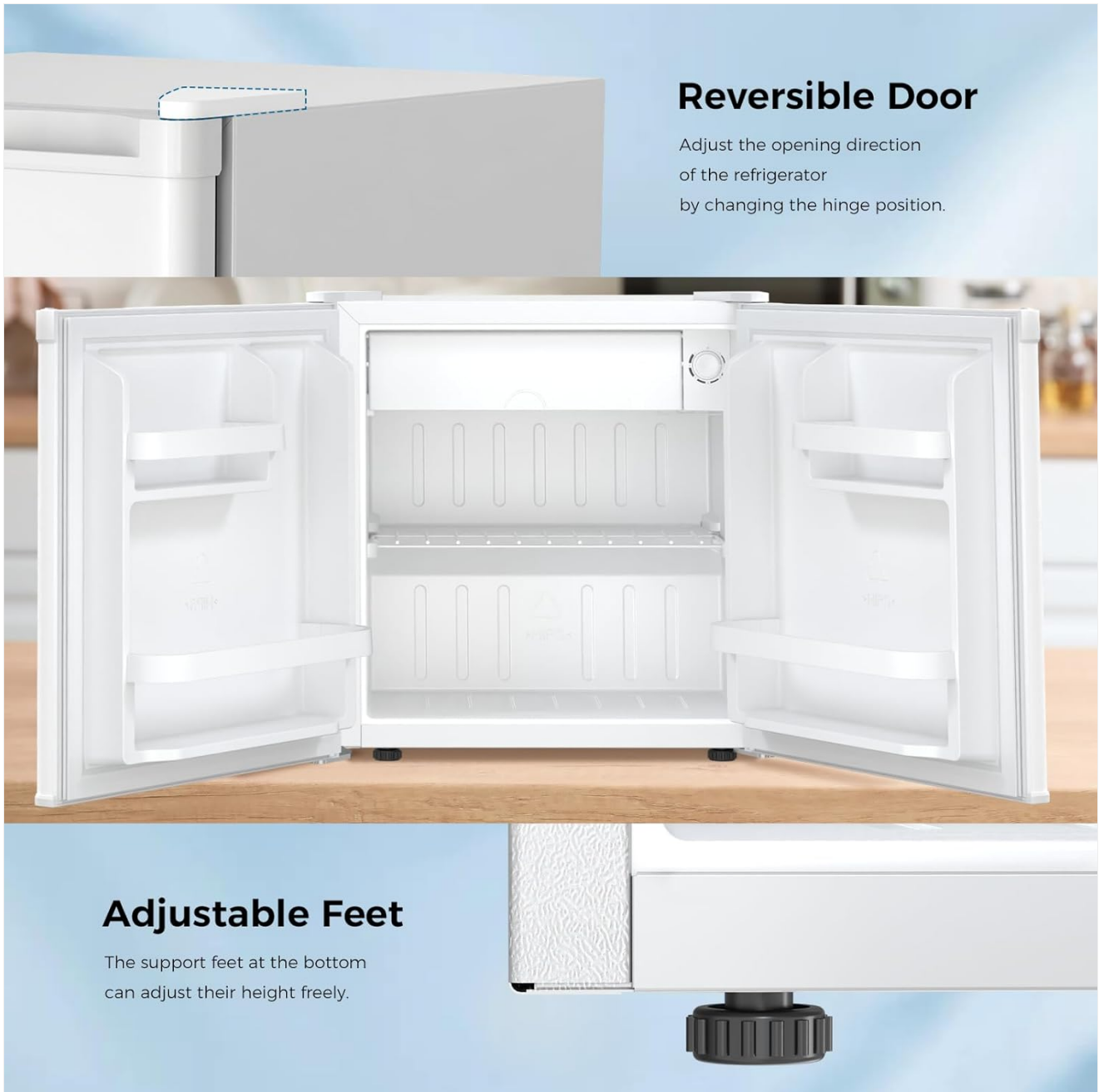
Image 4: Illustration of the reversible door feature and adjustable leveling feet.

The door hinges can be reversed to change the opening direction from right to left, or vice versa. Refer to the detailed diagrams in the full manual for step-by-step instructions on how to perform this procedure. This typically involves unscrewing and reattaching hinges and plugs.