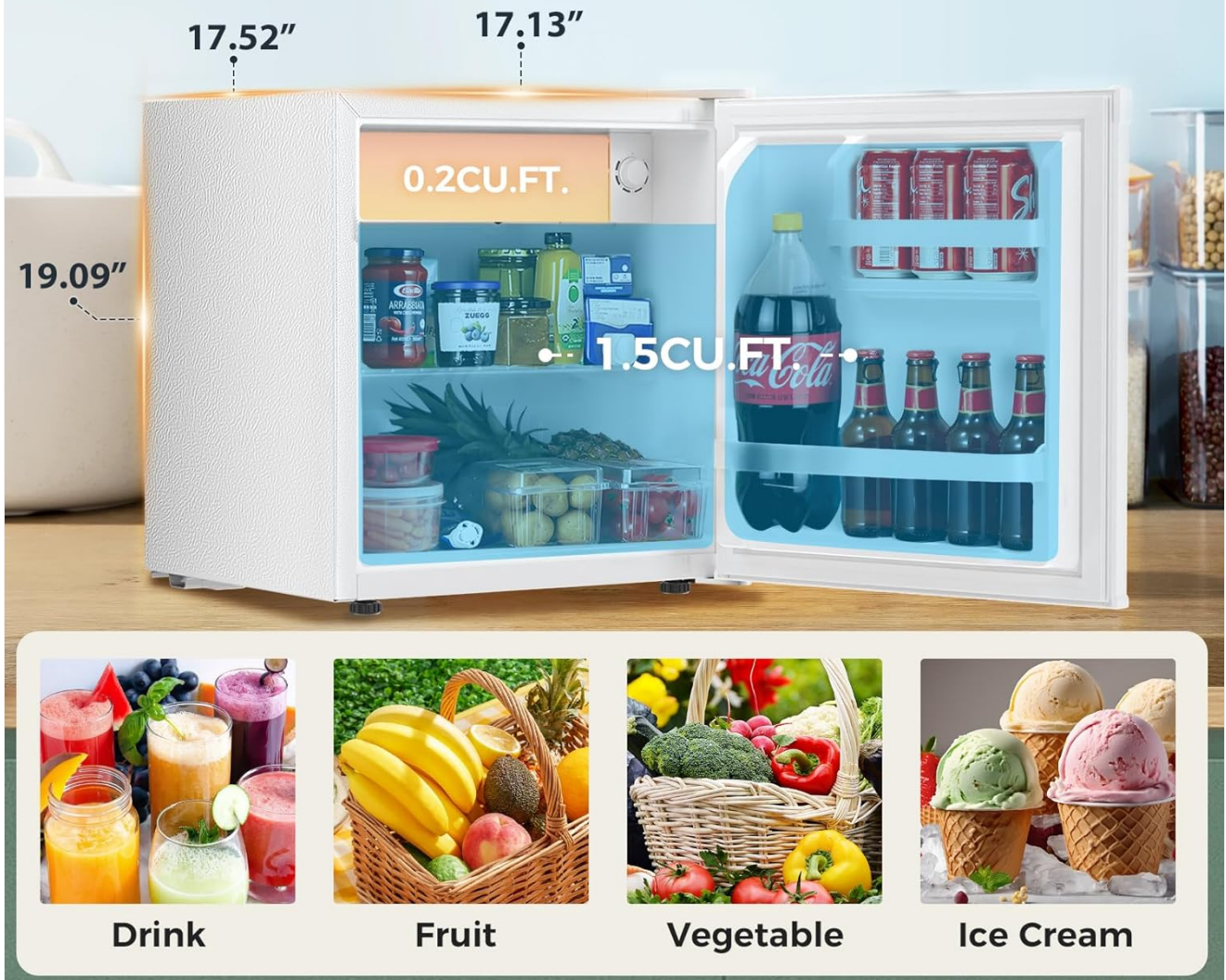
Image 3: Illustration of the interior space and dimensions, indicating 0.2 Cu. Ft. freezer and 1.5 Cu. Ft. fridge area.

Provide you with as much storage space as possible.