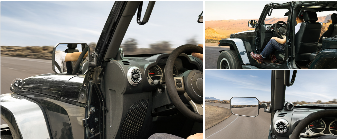
Figure 1: Illustration of doors-off use (top) versus doors-on (bottom). These mirrors are for doors-off configurations only.