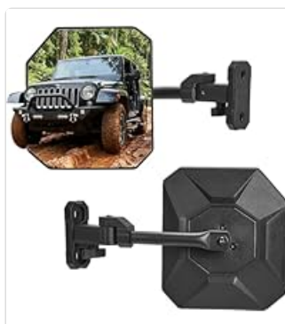
Figure 6: The mirror offers infinite angles, including flipping, tilting, and 360-degree rotation for comprehensive visibility.