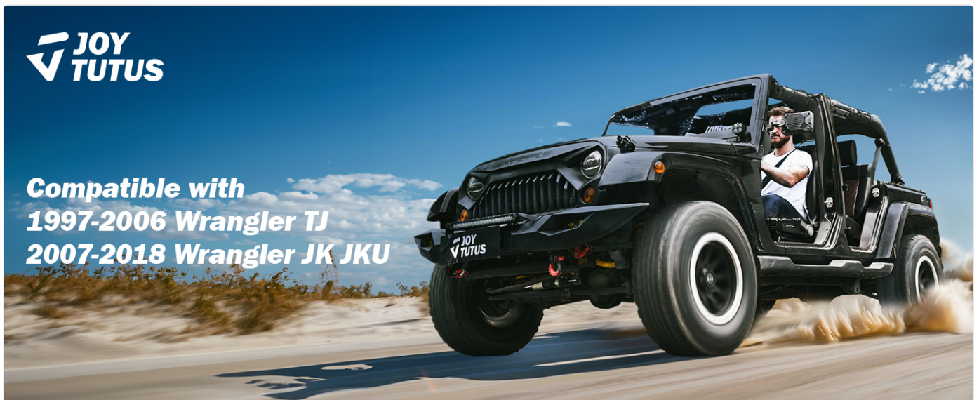
Figure 8: The 8.9-inch wide-view mirror (225mm) offers a significantly larger field of vision, allowing you to see more of what's behind you.

These mirrors provide an 8.9-inch wide-view mirror surface (225mm), offering a broader perspective of your surroundings. The patented dual-lock pivot system (bolt + reinforced joint) is engineered to minimize vibration and wobble, ensuring a stable and clear view even at higher speeds.