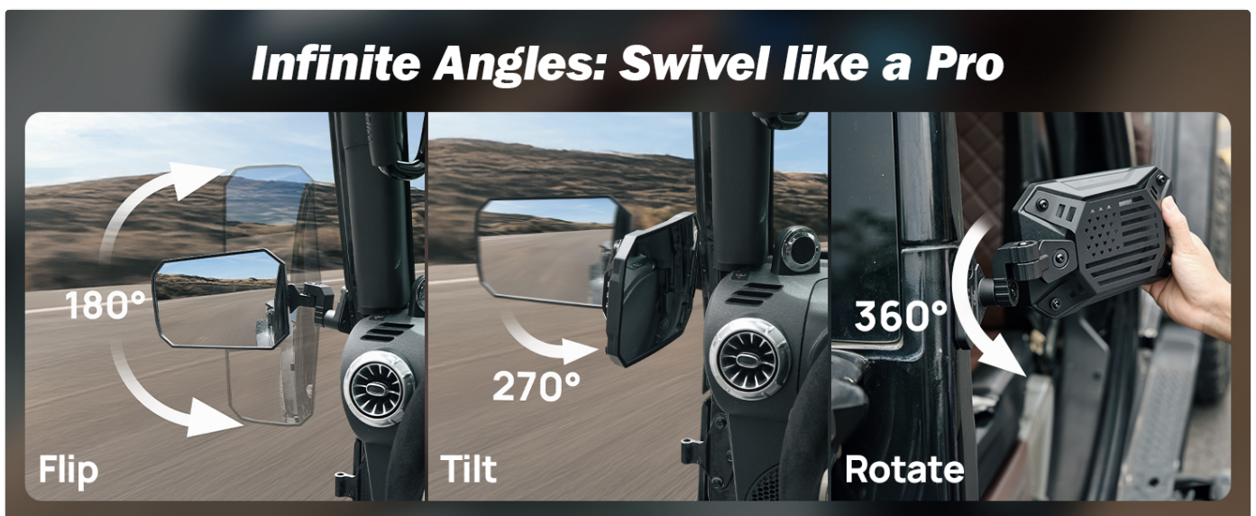
Figure 5: Versatile positioning allows for both vertical and horizontal mirror adjustments.