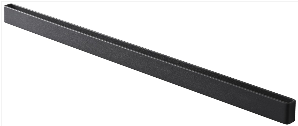
Image: The Yamazaki Tower Magnetic Steel Bar, showing its overall design and approximate dimensions of 60cm (W) x 2cm (D) x 3cm (H).