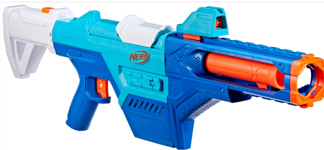
Image: The blaster fully assembled with all accessories.