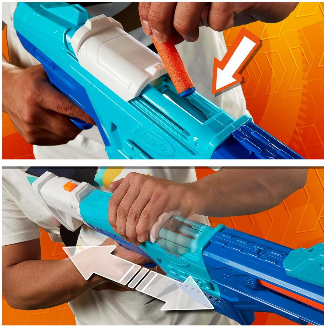
Image: Demonstrating how to load darts into the internal clip.