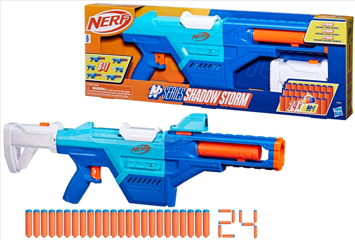
Image: All components included in the Nerf N Series Shadow Storm Blaster package.