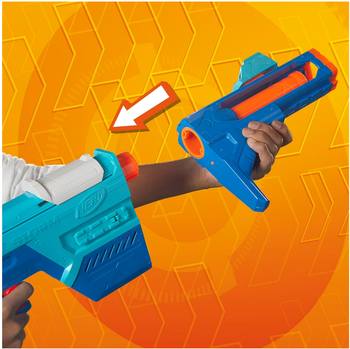
Image: Step-by-step illustration of attaching the stock to the blaster.