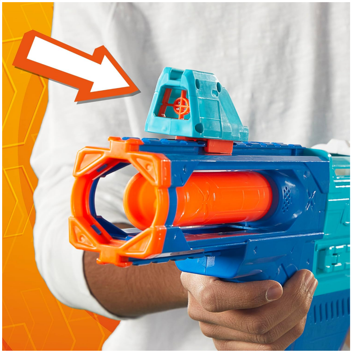
Image: Step-by-step illustration of attaching the sight to the blaster.