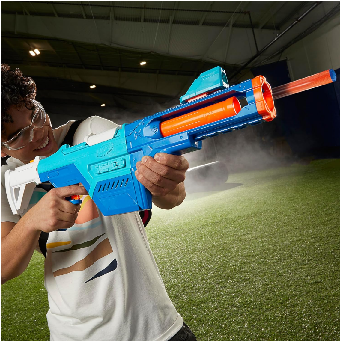
Image: A user demonstrating firing the blaster.