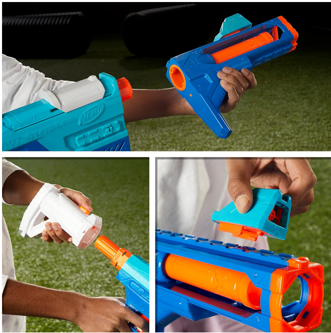
Image: Step-by-step illustration of attaching the barrel to the blaster.