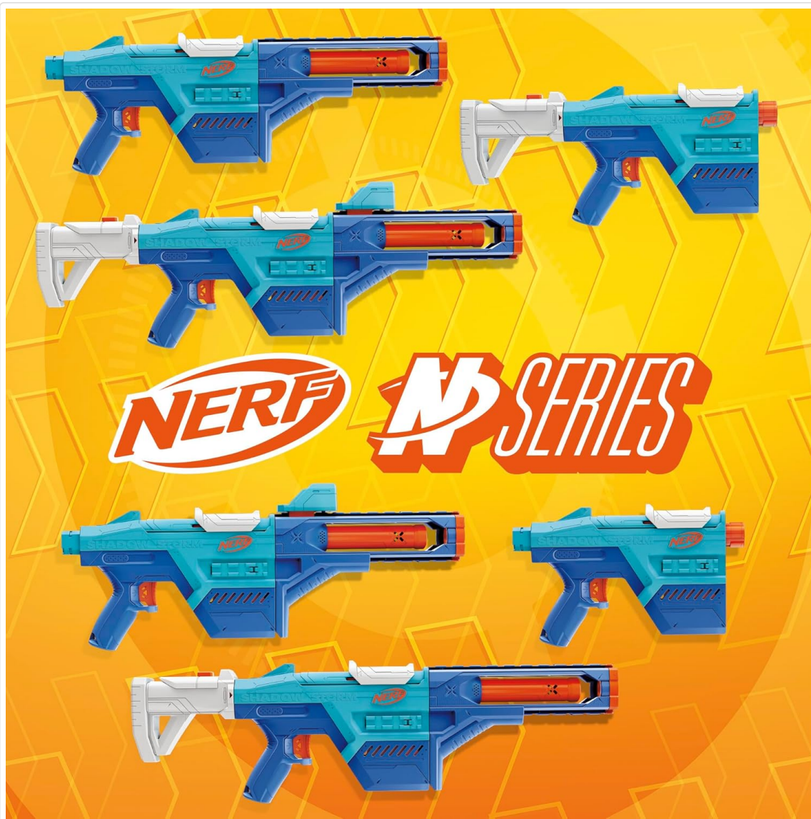
Image: Visual guide to the six possible configurations of the blaster.