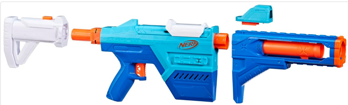
Image: The blaster's main body with its detachable stock, barrel, and sight separated.

The Nerf N Series Shadow Storm Blaster features modular components allowing for customization. Follow these steps to assemble your blaster.