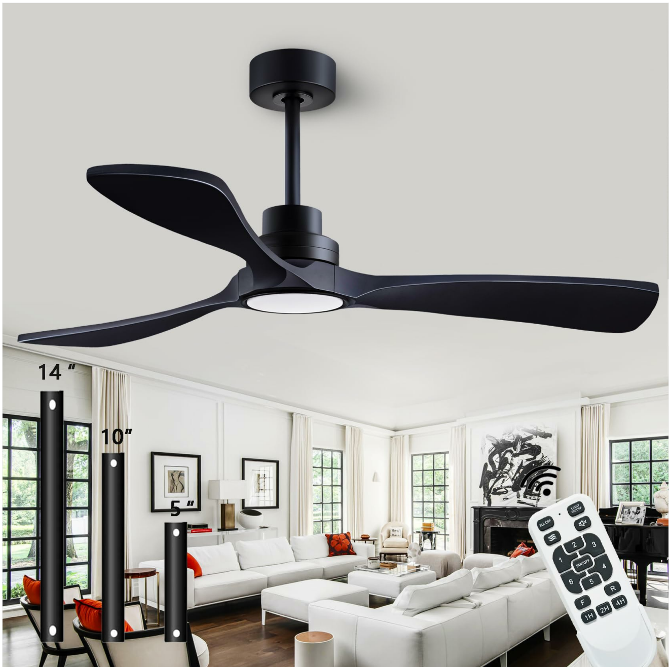
Image: The dearnow 52-inch Black Ceiling Fan with Lights and Remote Control, featuring three sleek blades and an integrated LED light, installed in a modern living space.