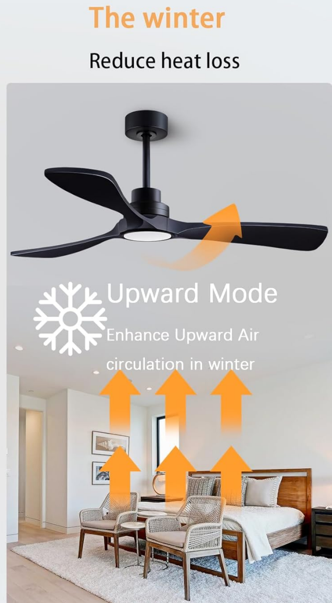
Image: A visual representation of the fan's reversible function, showing downward airflow for cooling in summer and upward airflow for circulating warm air in winter.