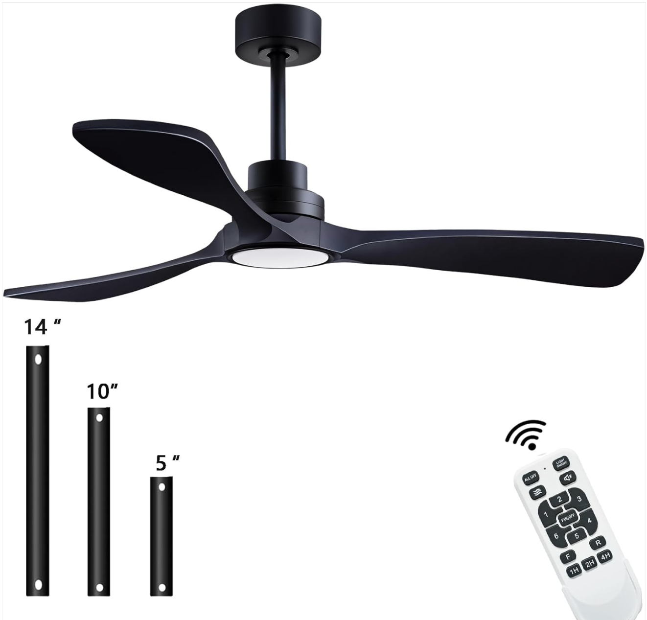
Image: The remote control unit and three different length downrods (5-inch, 10-inch, 14-inch) included with the dearnow ceiling fan.