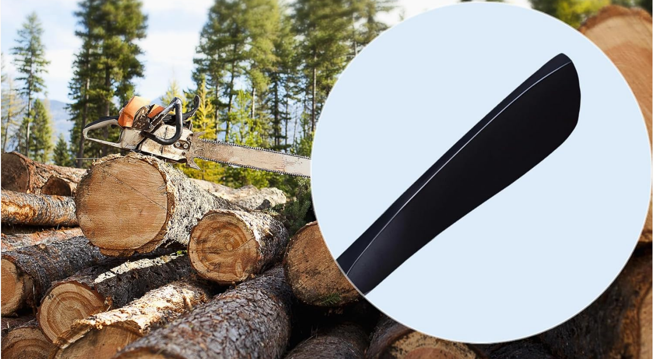
Image: A close-up view of one of the dearnow ceiling fan's solid wood blades, showcasing the natural grain and quality craftsmanship.