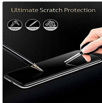
Image: Demonstrates the screen protector's resistance to scratches from common objects.