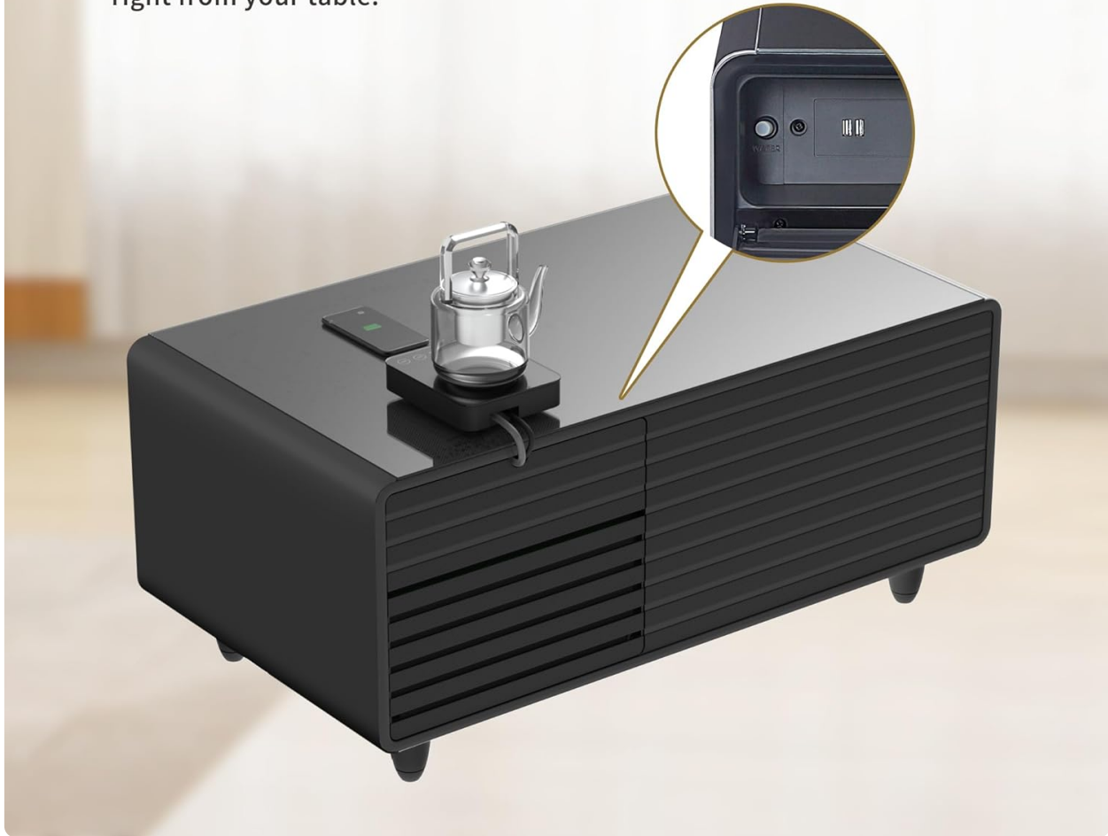
Image 4.5: The rear of the smart coffee table, showing the water inlet port. A small kettle is depicted connected to this port, demonstrating its utility for brewing tea or coffee directly from the table.

Our Smart Coffee Table boasts a convenient water outlet at the back, allowing you to connect a kettle for easy tea brewing or coffee making right from your table.