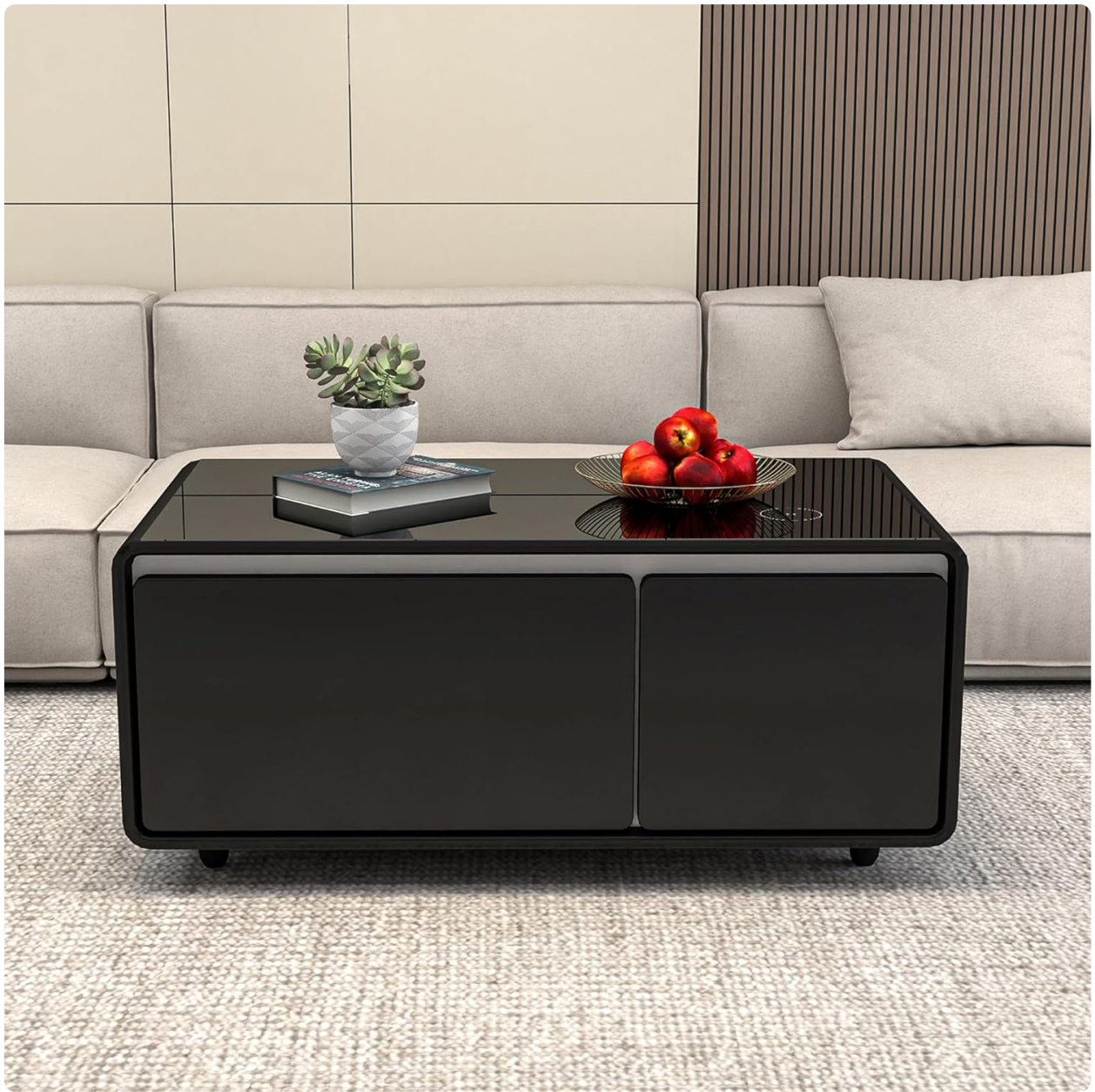
Image 1.1: The Generic Smart Coffee Table in a modern living room. This image shows the table's sleek black design and its integration into a home environment.