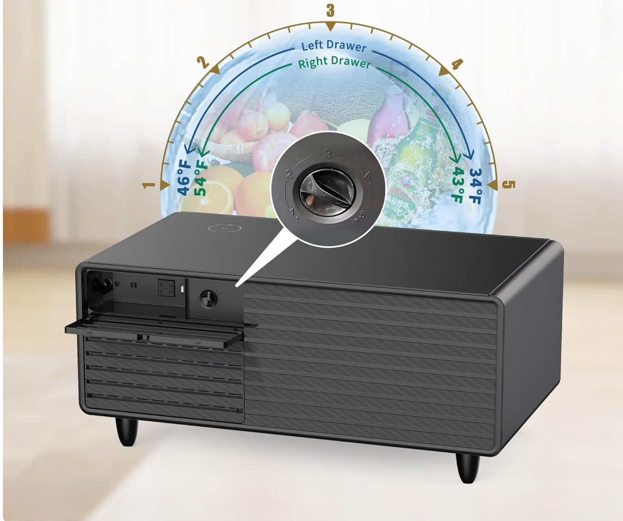
Image 4.2: Close-up of the 5-level temperature control knob on the side of the smart coffee table. This knob allows users to adjust the cooling intensity for the refrigerated drawers.