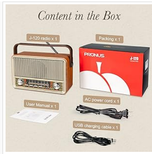
Image: Contents of the PRUNUS J-120 package.