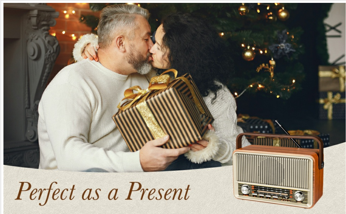
Image: Radio with extended antenna for great reception.