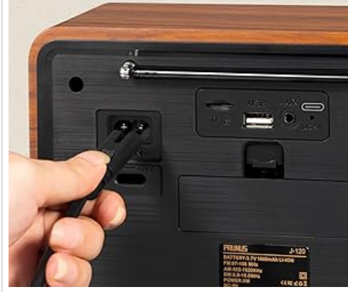
Image: AC power input and media ports.