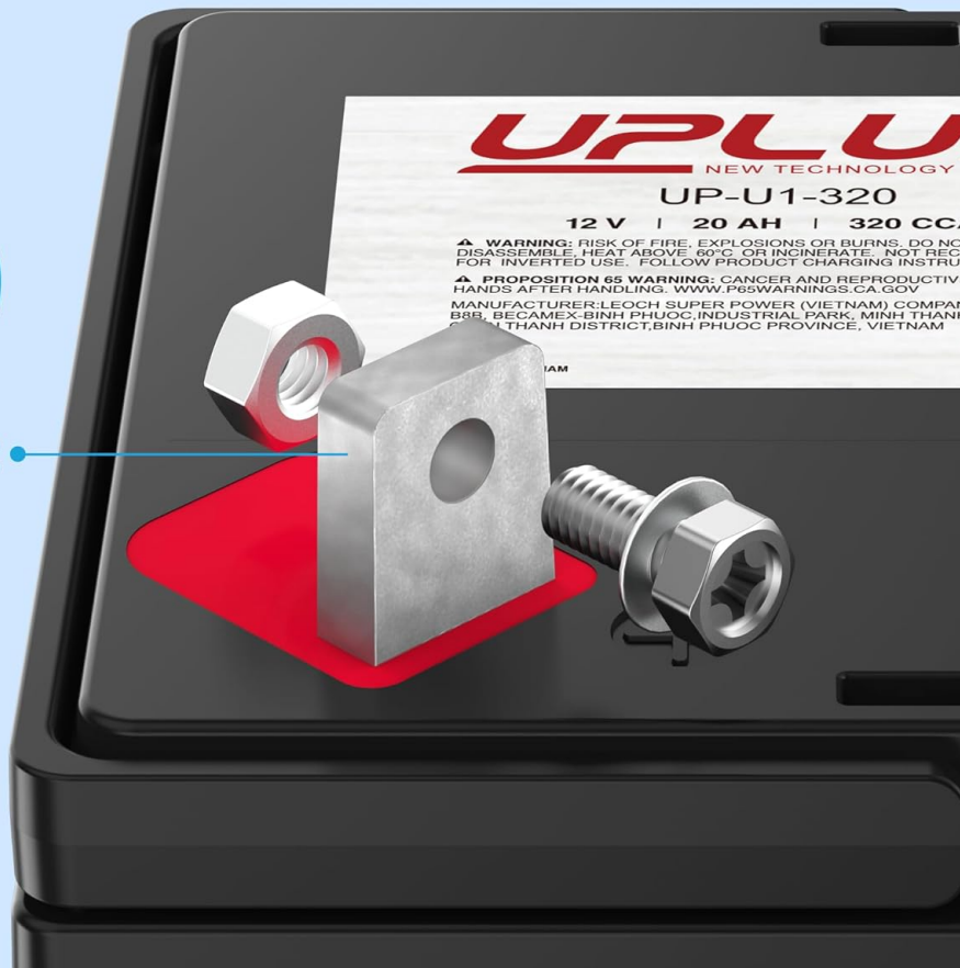
Figure 9.1: UPLUS provides local after-sales support with professional technical assistance and a 12-hour response time.