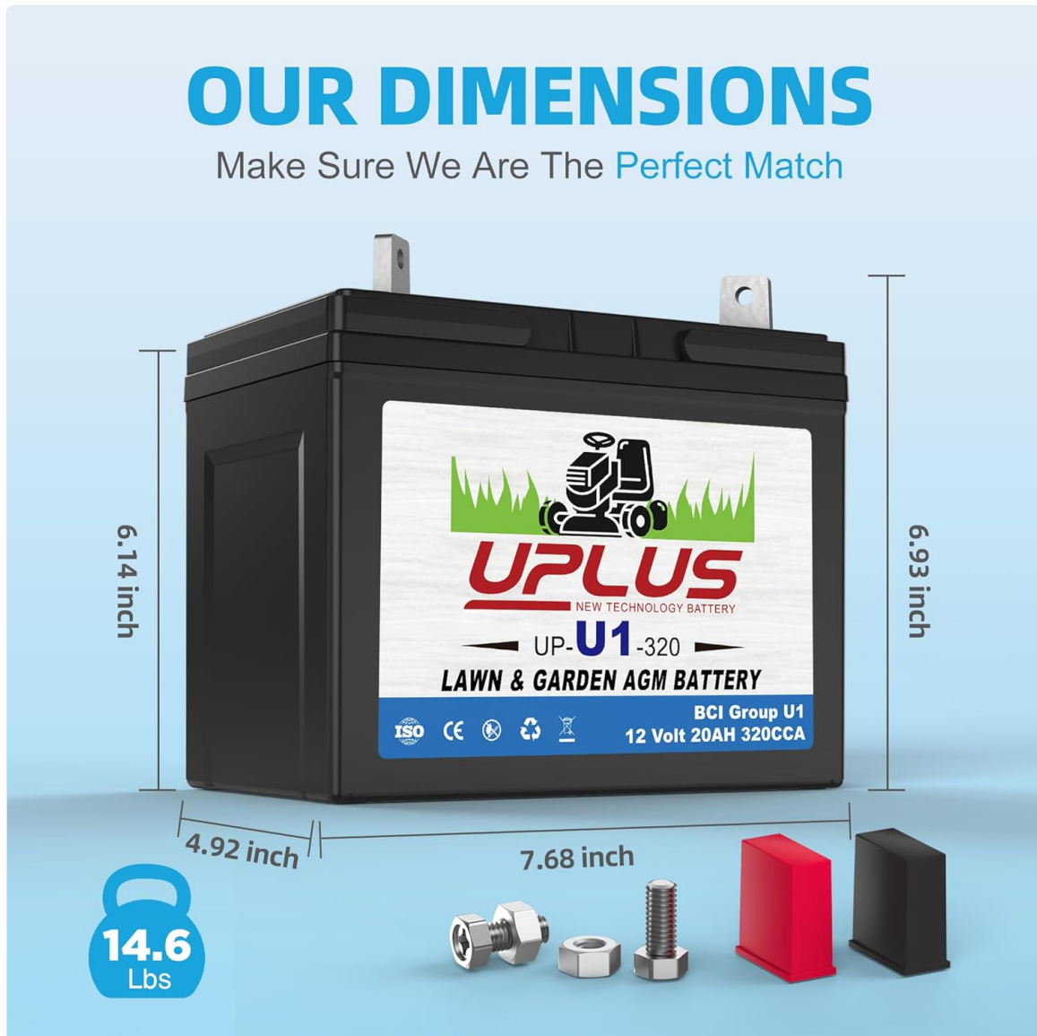
Figure 4.1: Detailed dimensions of the UPLUS U1 battery, weighing 14.6 lbs.