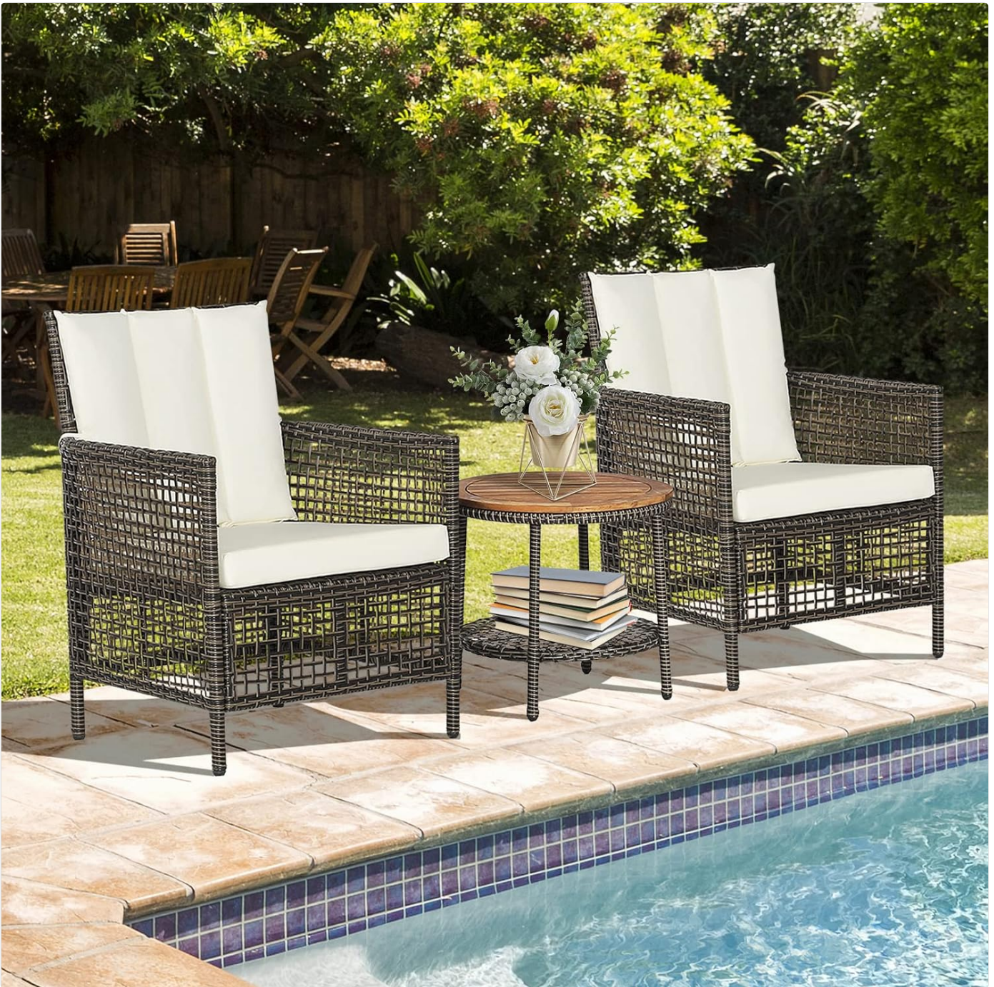
Image: The DORTALA 3-Piece Wicker Patio Furniture Set, featuring two single sofas with cushions and a round 2-tier coffee table, placed by a poolside in a garden setting.