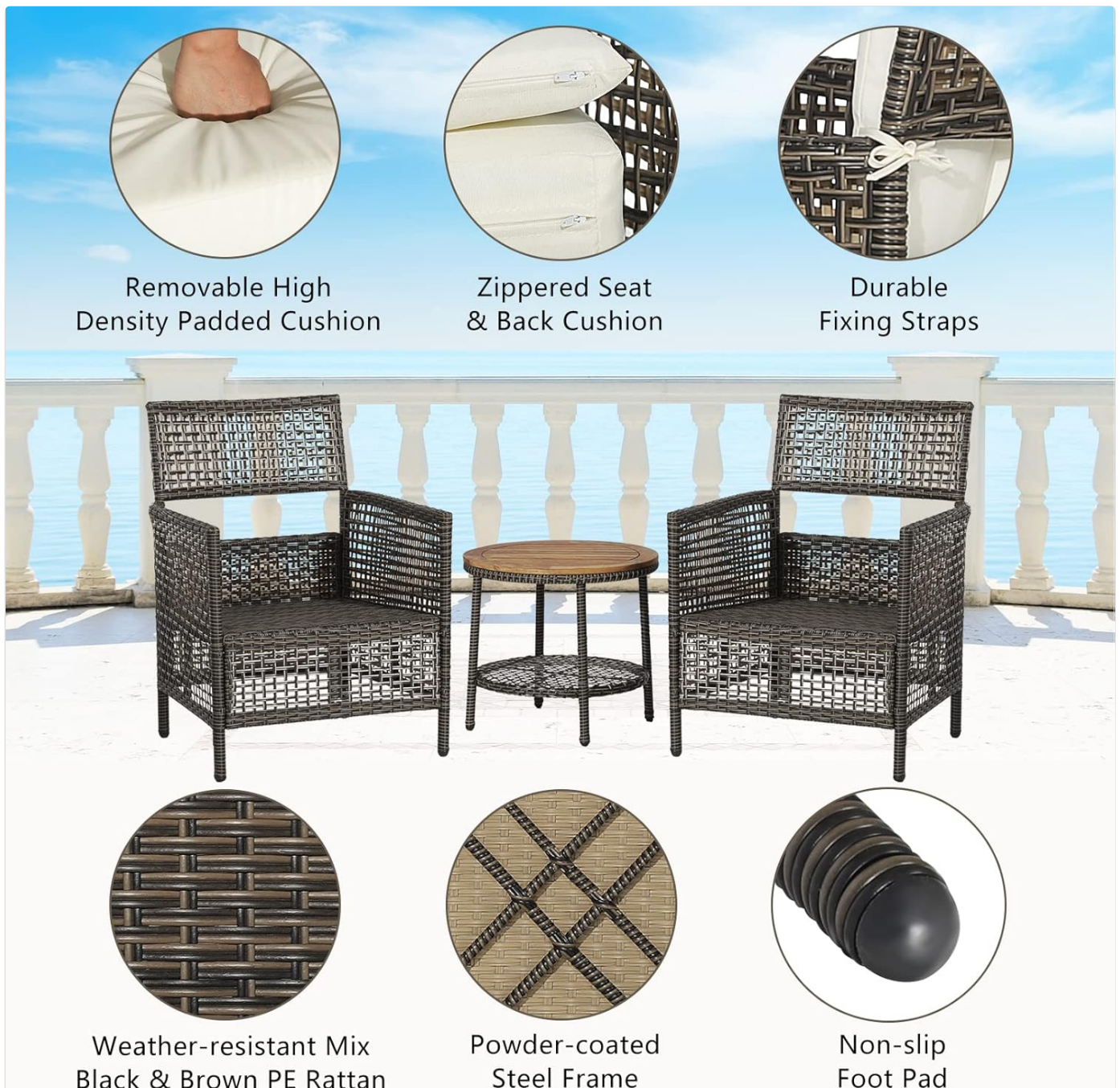
Image: Visual representation of the materials used in the DORTALA patio furniture, including weather-resistant mix black and brown PE rattan, powder-coated steel frame, and non-slip footpads.