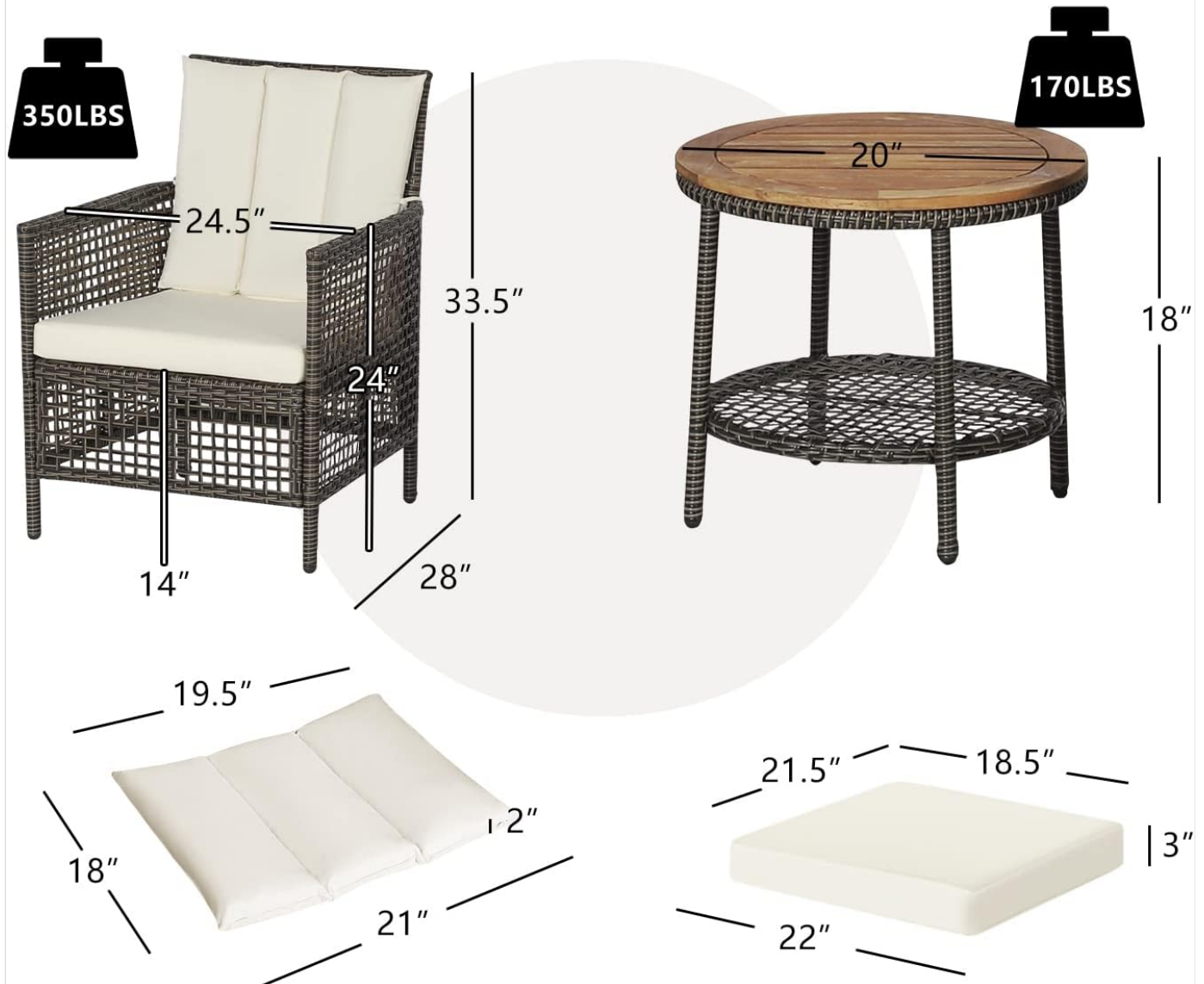
Image: Detailed product dimensions for the single sofa and coffee table, including weight capacities (350 lbs for sofa, 170 lbs for coffee table, 55 lbs for lower shelf). Dimensions are shown in inches.

Please do not tighten all the screws until all the holes are aligned Please refer to the size instructions before purchasing to avoid unnecessary trouble