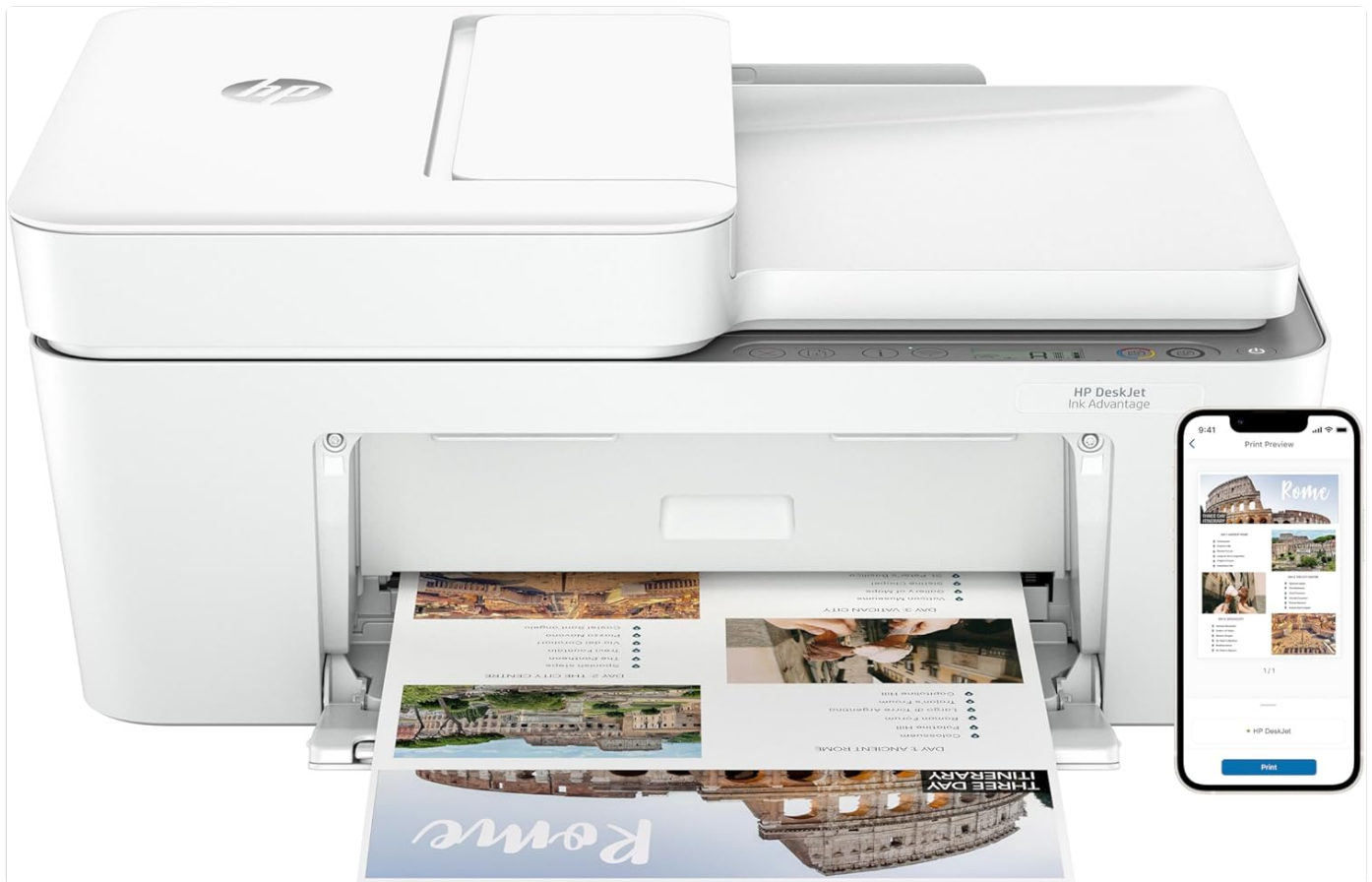
Figure 4: The printer actively printing documents, with a smartphone displaying the HP Smart App interface.