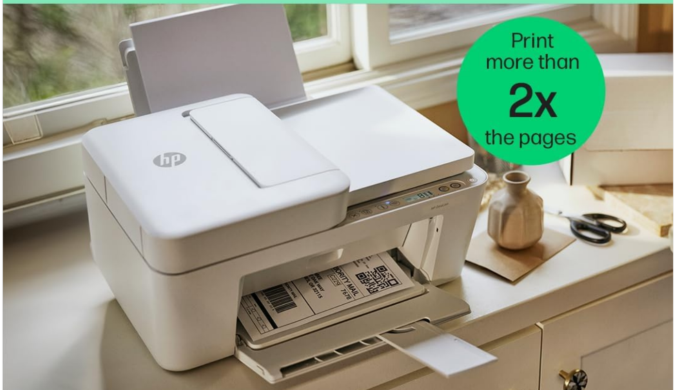
Figure 6: Information regarding the included ink cartridges and page yield for the HP DeskJet Ink Advantage 4276.

With 240 black and 100 color pages in the box