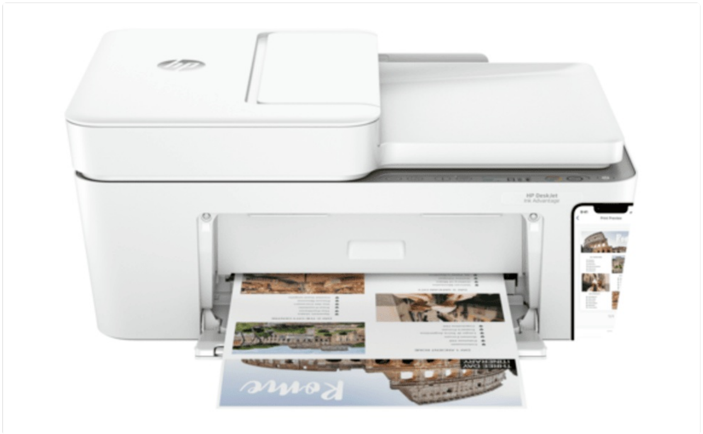
Figure 5: Another view of the printer in operation, demonstrating its printing capabilities.