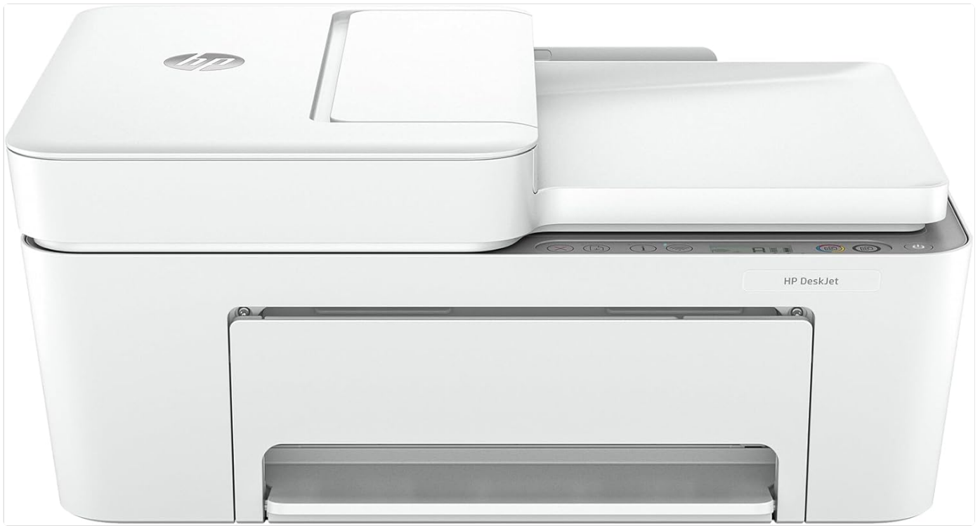
Figure 1: Front view of the HP DeskJet Ink Advantage 4276 printer.