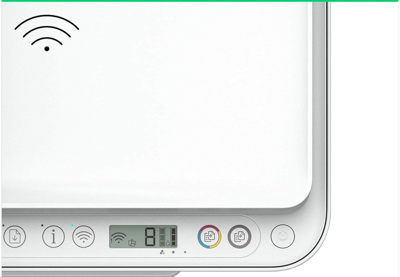
Figure 3: Control panel with Wi-Fi indicator, showing the printer's wireless capability.