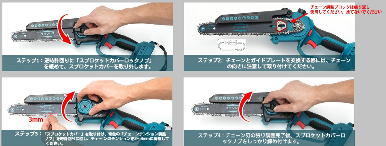
Figure 2: Tool-less Chain Adjustment and Sprocket Cover Installation