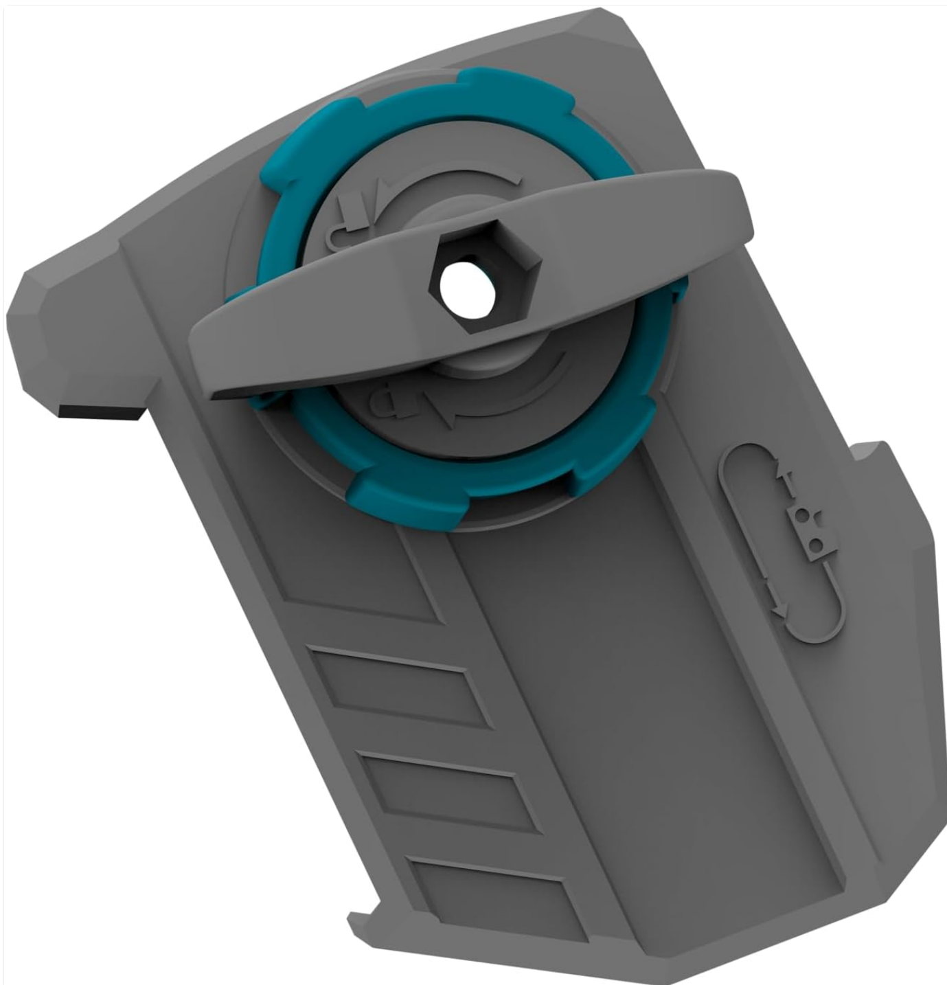
Figure 1: DEOVCVN 8-inch Chainsaw Sprocket Cover (Model 8C8S-GB)