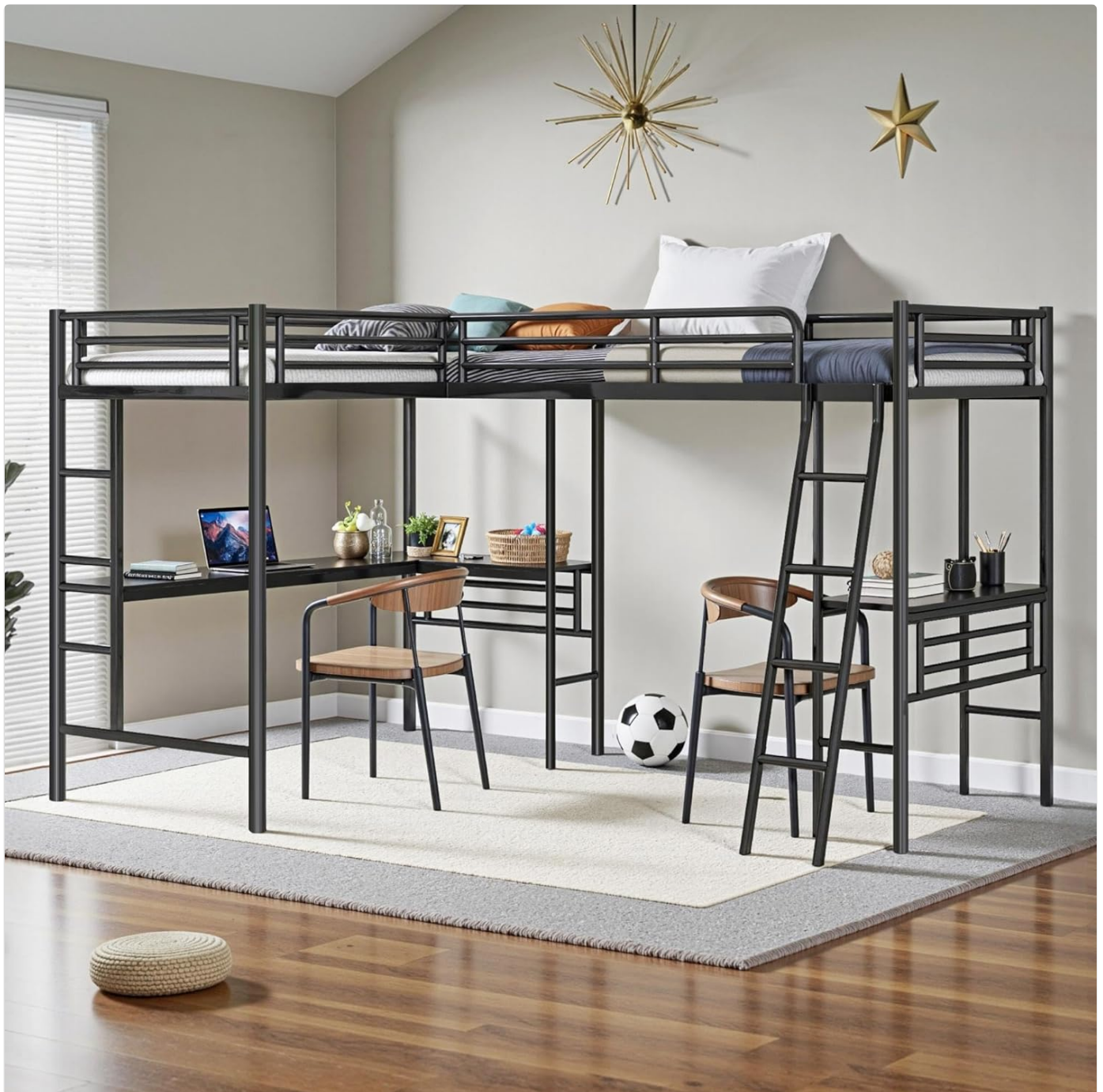
Figure 1: Overall view of the INCLAKE L-Shaped Loft Bed with integrated desks.