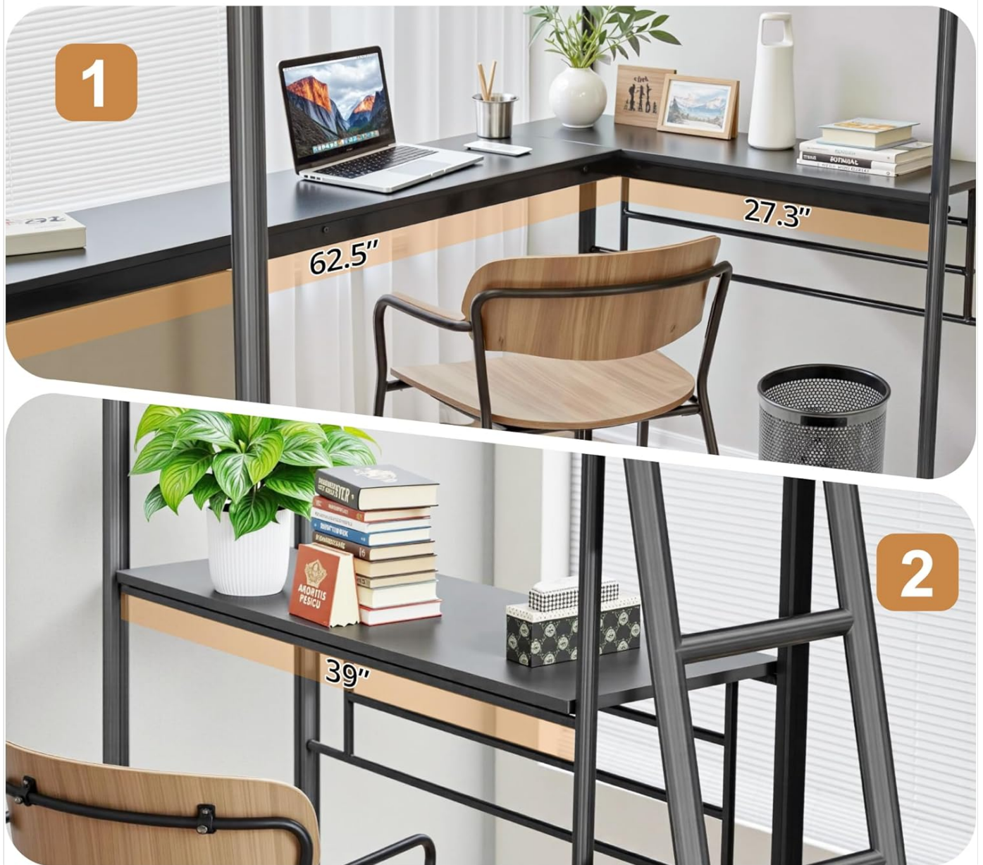
Figure 3: Close-up view of the two built-in desks, highlighting their spacious design for study or work.