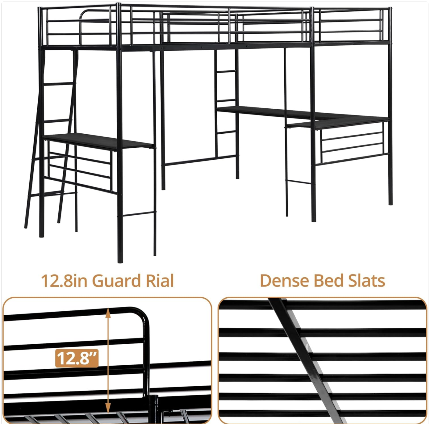
Figure 5: Detail of the 12.8-inch high guard rail and dense bed slats, emphasizing safety and mattress support.