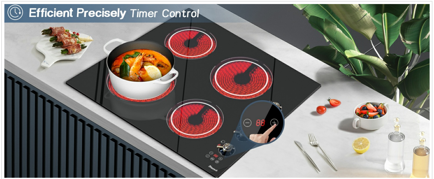
Image: A user interacting with both the rotary knobs and the touch controls on the cooktop, highlighting the dual control interface.

Each burner has a dedicated rotary knob. Once the cooktop is unlocked, turn the corresponding knob to select one of the 9 power levels. The selected power level will be displayed digitally next to the knob.