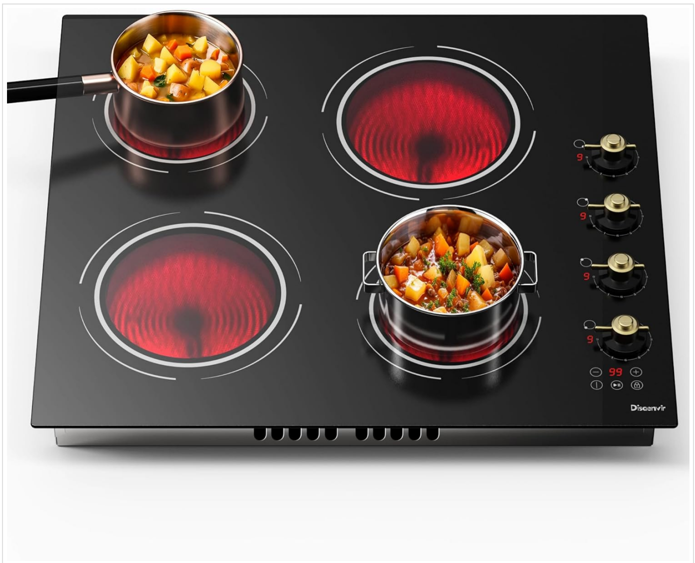
Image: The Disaenvir 24 Inch Electric Cooktop, showcasing its four radiant heating zones and combined touch and knob controls. Two pots are visible on the active burners, demonstrating its cooking capability.