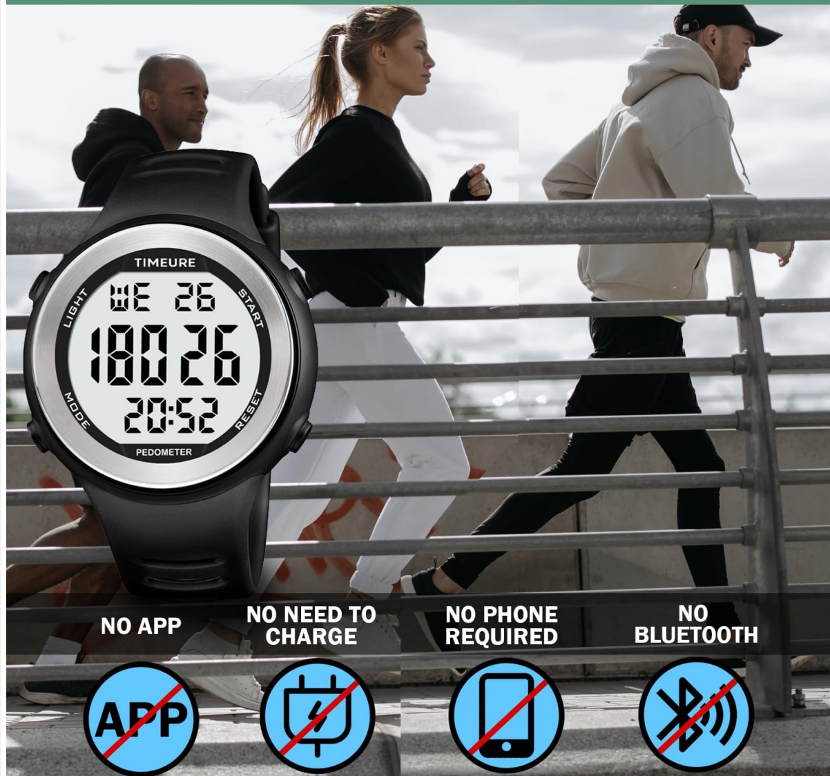
Figure 2.2: Standalone Operation