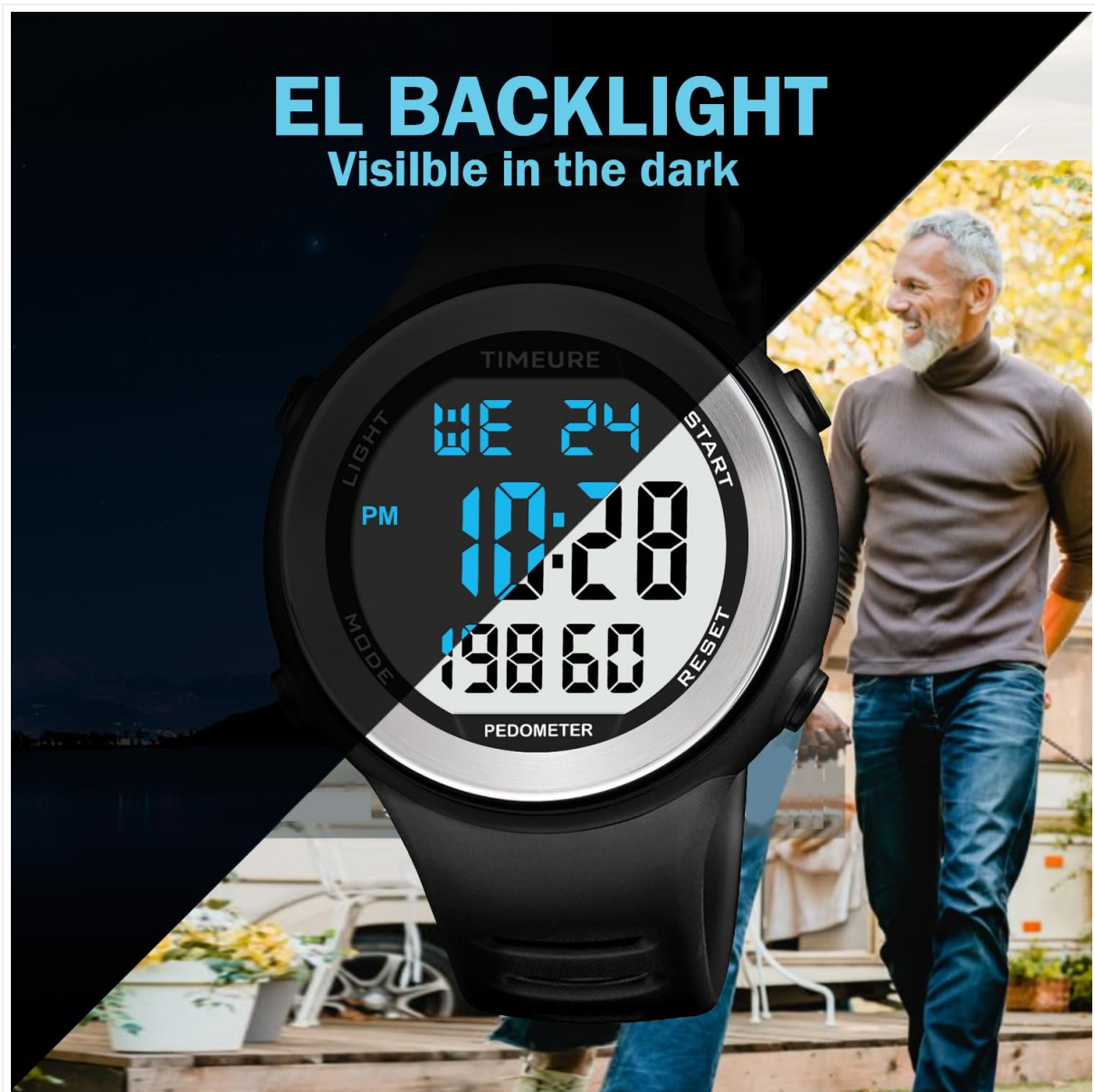
Figure 4.2: EL Backlight in Use

Press the LIGHT button to activate the EL backlight. The display will illuminate for approximately 5 seconds, providing visibility in dark environments.