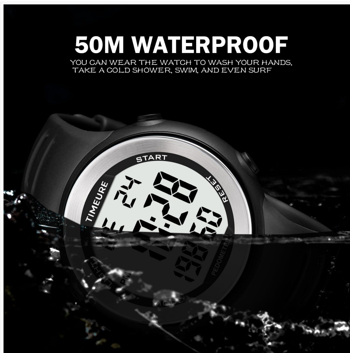
Figure 5.1: 50M Water Resistance

Important: Do not press any buttons while the watch is submerged in water. Avoid exposure to hot water, steam, or extreme temperature changes, as this can compromise the watch's water-resistant seals.