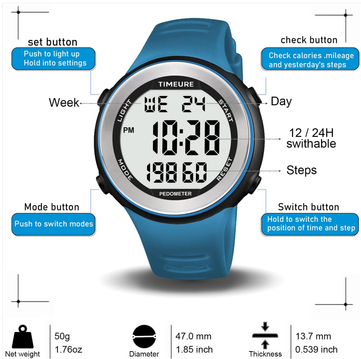
Figure 3.1: Watch Buttons and Display Elements