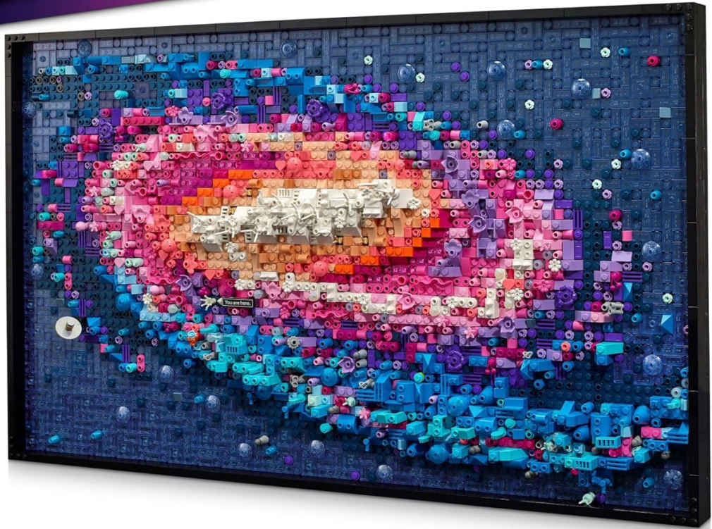
Image 1.1: The LEGO Art The Milky Way Galaxy Building Set 31212, showing the product box and the completed wall art.