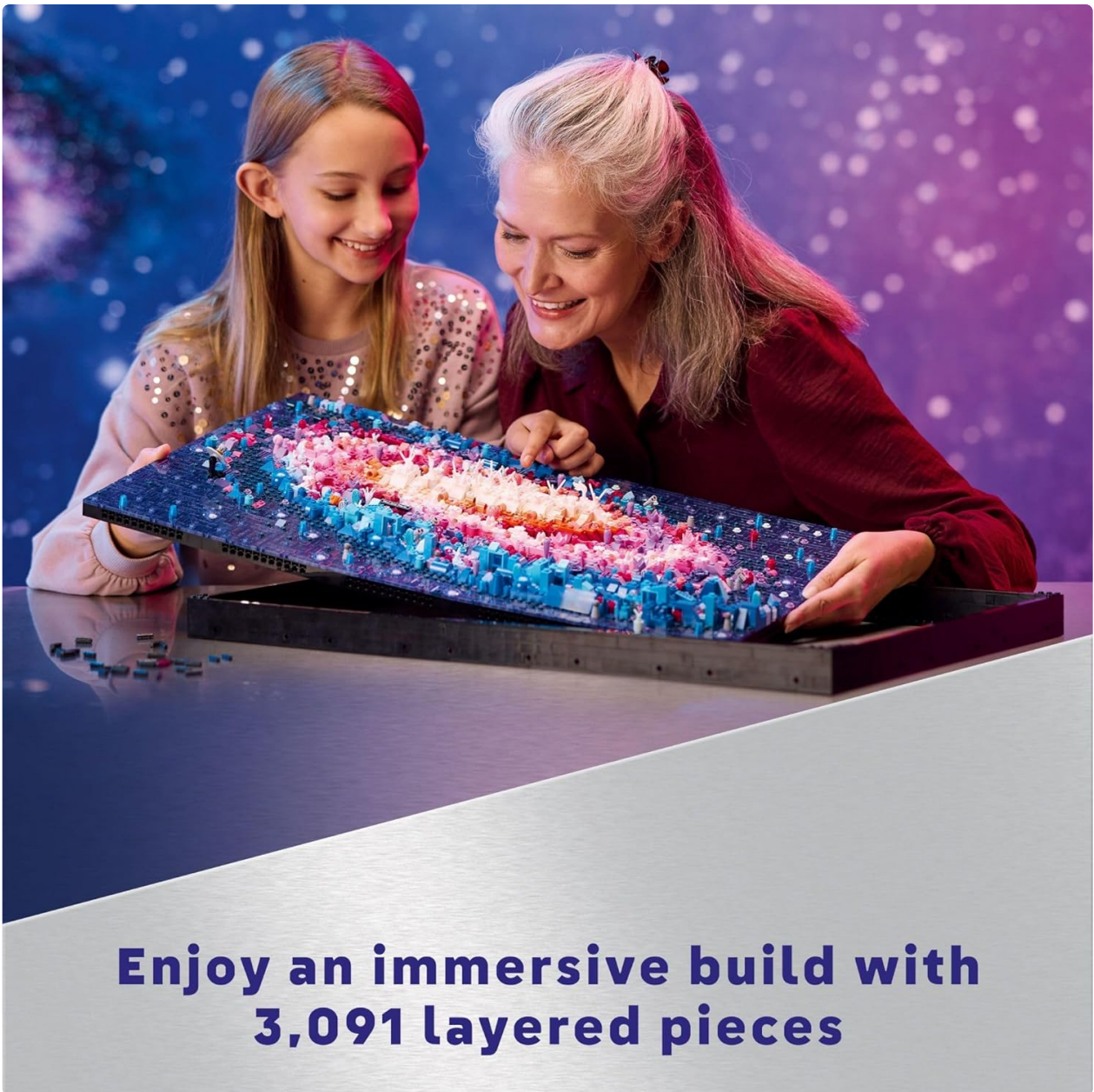
Image 2.1: Two individuals engaged in the collaborative building process of a LEGO Art The Milky Way Galaxy panel.