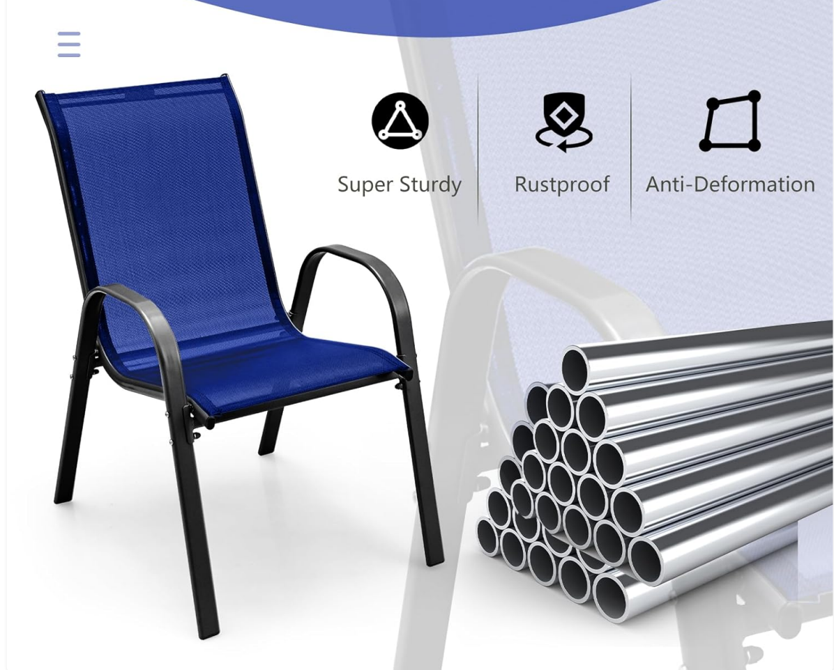
Image: High-grade, breathable, and quick-drying fabric.