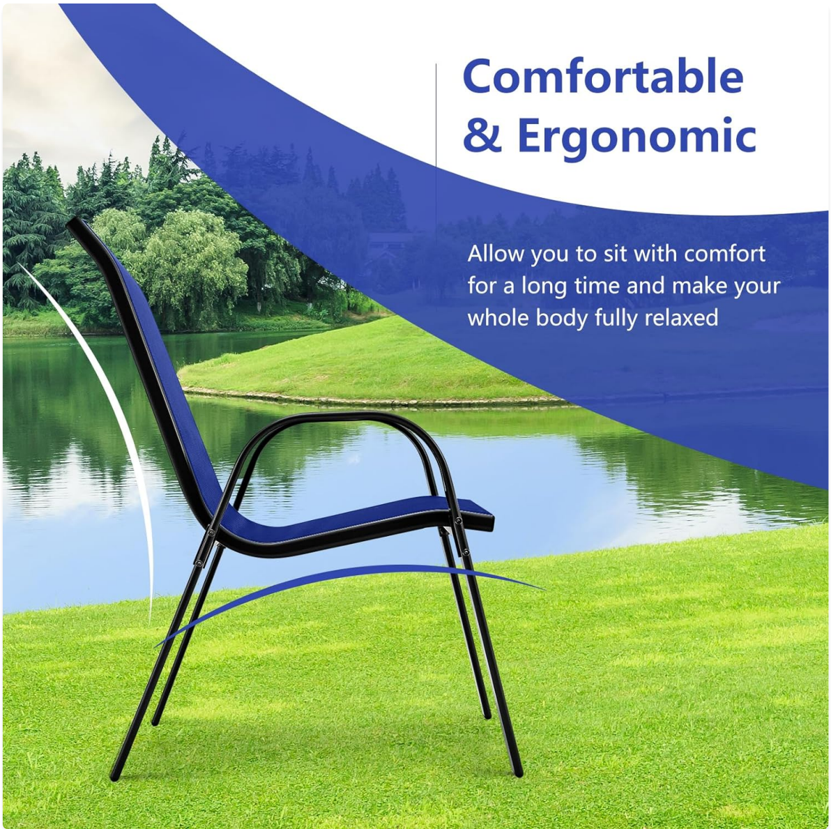
Image: Plastic-sprayed steel frame for durability.

Allow you to sit with comfort for a long time and make your whole body fully relaxed