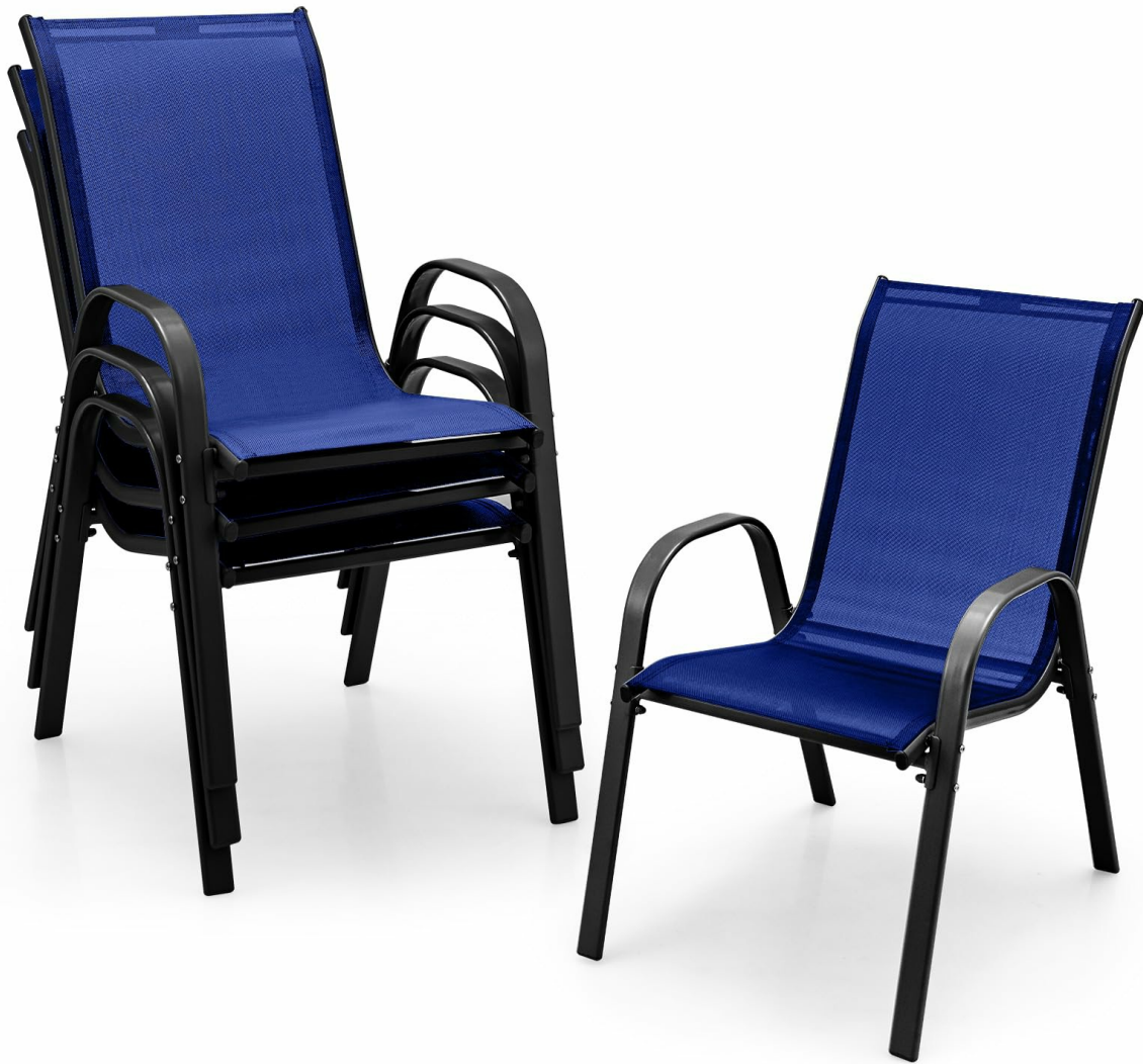
Image: Giantex Set of 4 Patio Chairs in an outdoor setting.