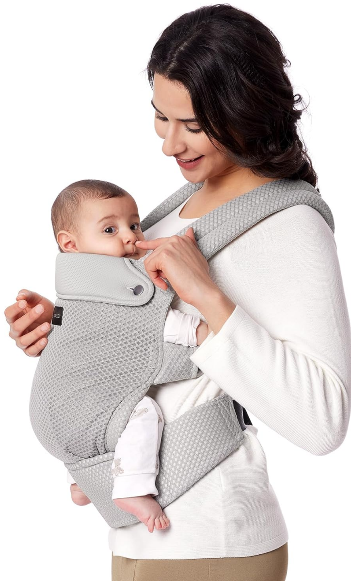
Image: The Momcozy Breathable Mesh Baby Carrier in Air Mesh-Grey, showcasing its sleek design.