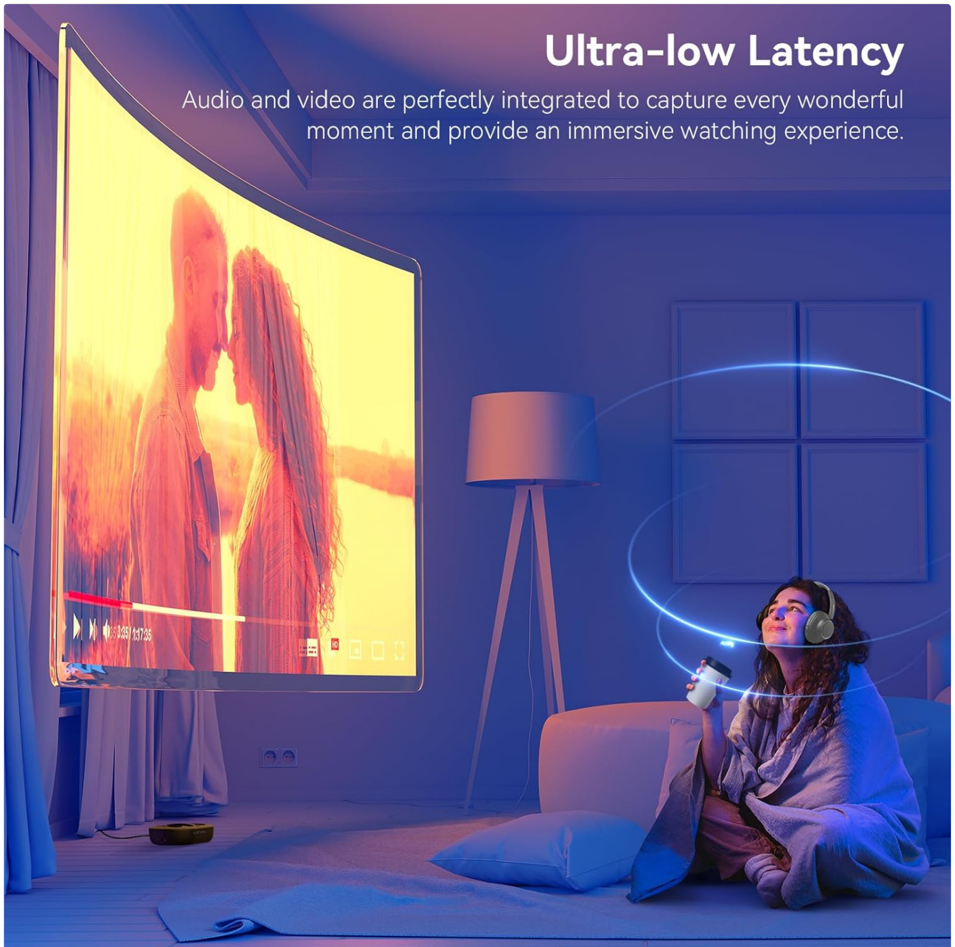
Image: A person comfortably watching a large screen TV with LEVN wireless headphones, with graphics indicating ultra-low latency for synchronized audio and video.

Audio and video are perfectly integrated to capture every wonderful moment and provide an immersive watching experience.