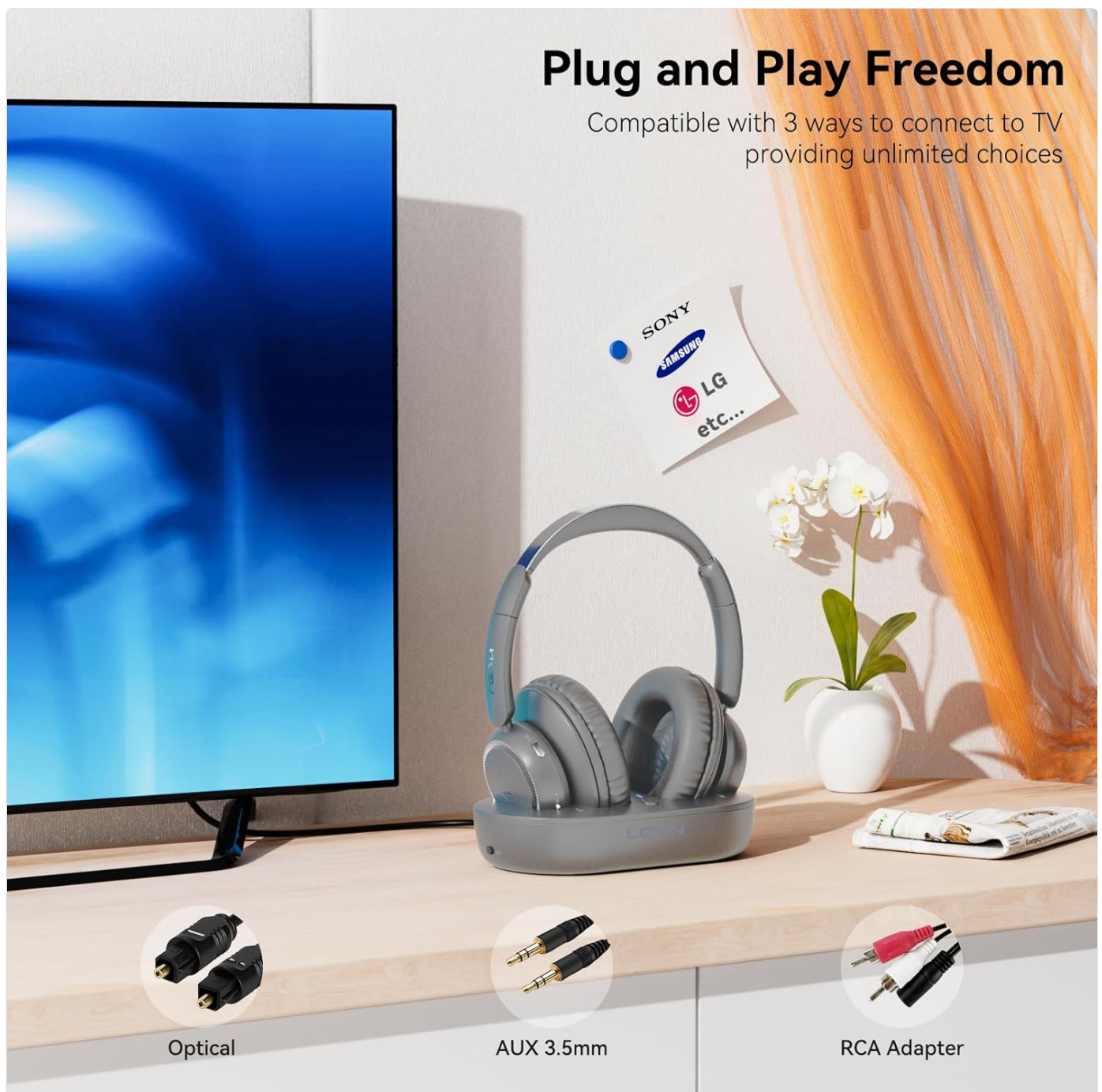
Image: The LEVN transmitter base shown with three types of audio cables: Optical, AUX 3.5mm, and RCA, illustrating its versatile

The transmitter base offers multiple audio input options. Choose the one compatible with your TV or audio source. Only one audio input connection is required.