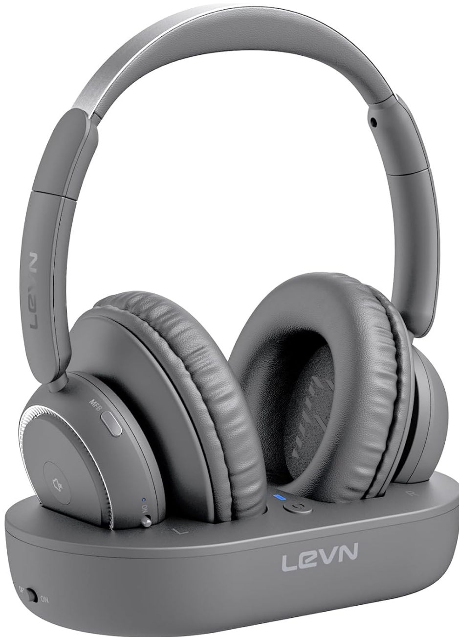
Image: The LEVN wireless headphones resting on their grey transmitter charging base. The headphones are over-ear style, grey in color, with the LEVN logo visible on the headband and base.