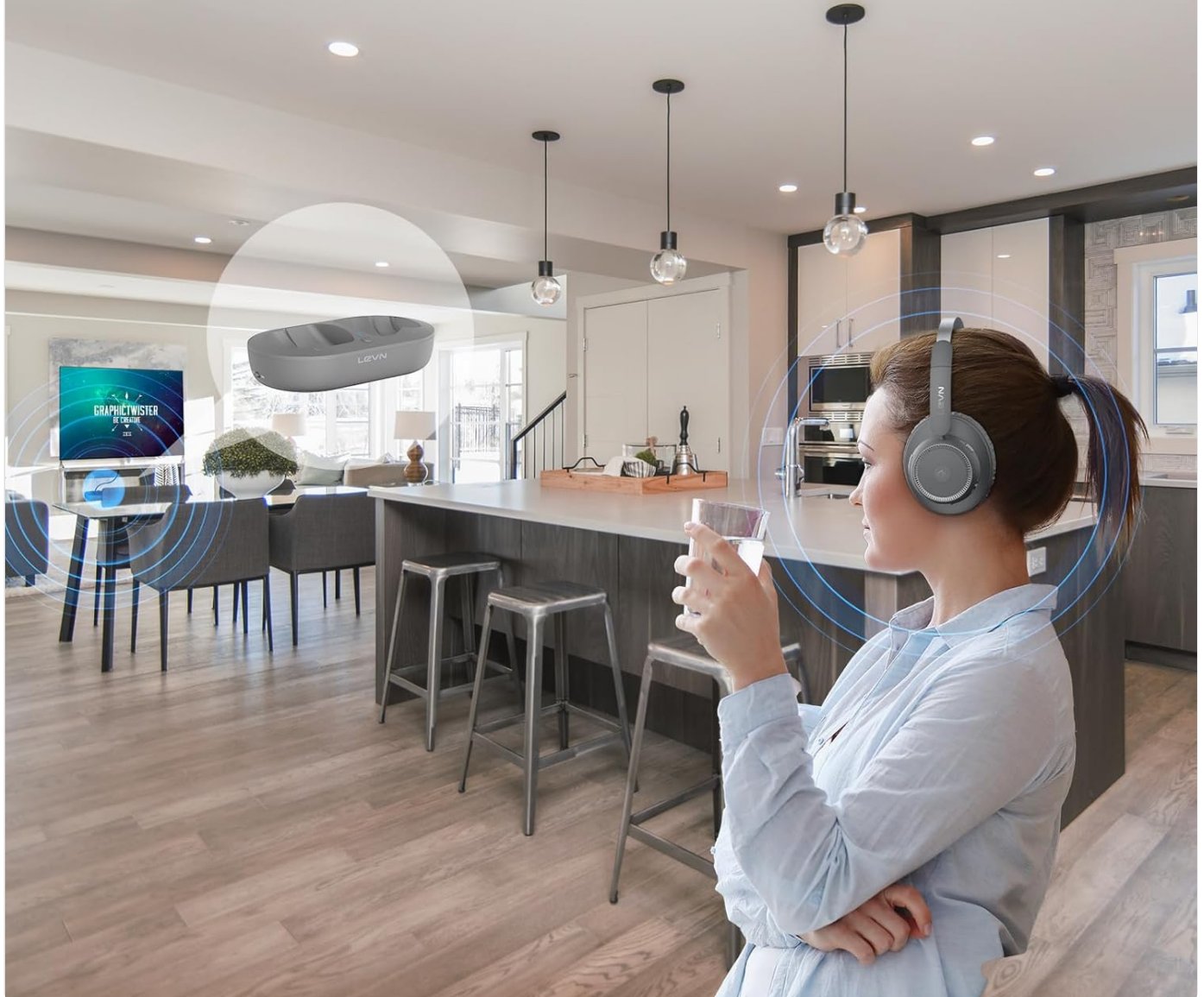
Image: A person wearing the LEVN wireless headphones in a kitchen setting, with circular graphics indicating a connection range of up to 30 meters (100 feet) from the transmitter, allowing freedom of movement.

With a connection range of up to 30 meters (100 feet), the headphones deliver superior sound quality no matter where you are.