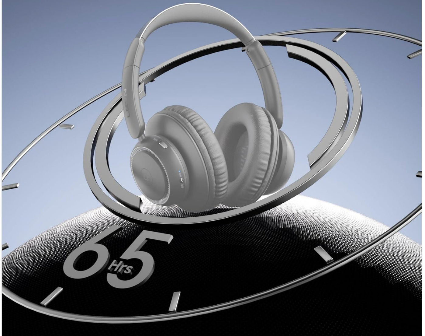
Image: A graphic illustrating the LEVN wireless headphones with a clock showing "65 Hrs", emphasizing the long battery life of up to 65 hours on a single charge.

Get 1 week of use on a single charge for uninterrupted watching fun