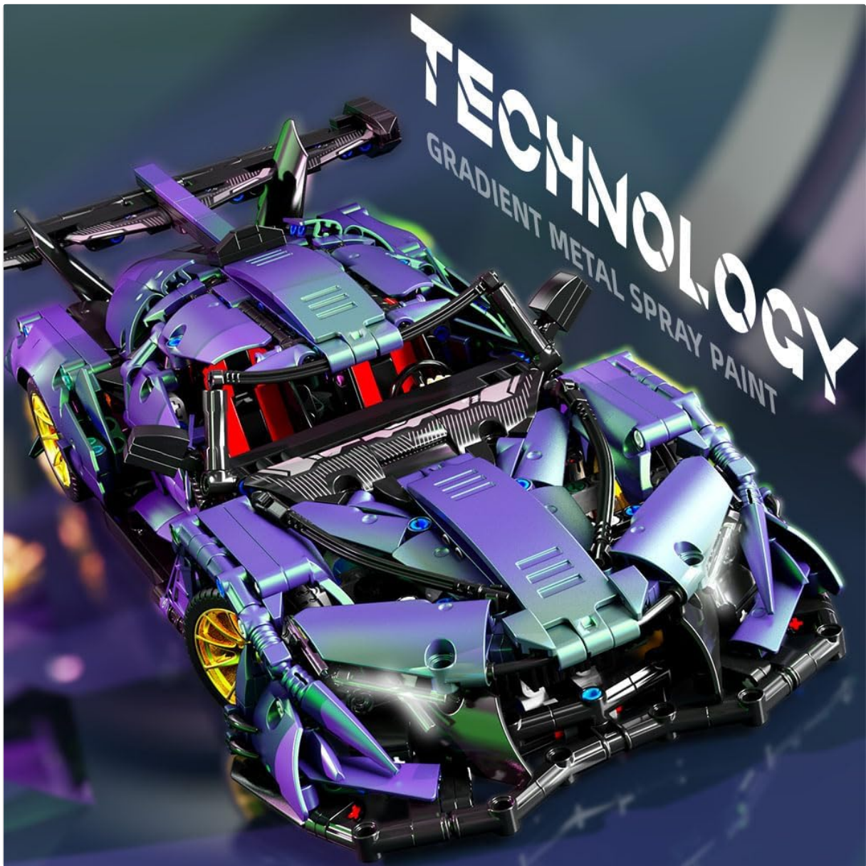
Figure 4.1: The completed Mesiondy racing car showcasing its electroplated gradient metal spray paint finish, which changes color under different lighting conditions.

The model features a classic sports car modular design, allowing for precise and detailed construction. Pay close attention to the connections to ensure structural integrity.