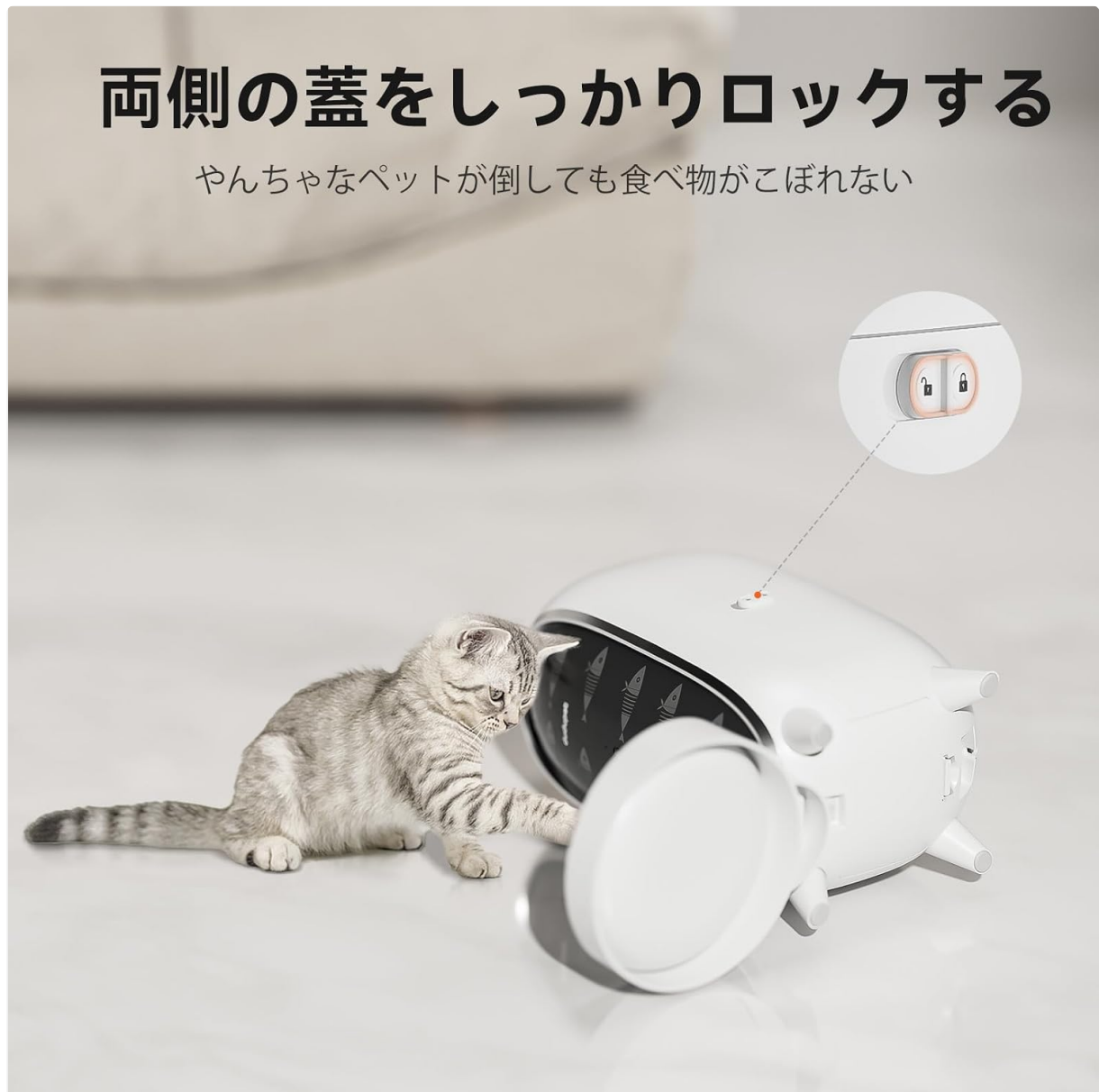
Image: The feeder's secure locking mechanism, demonstrated with a cat interacting with the device, ensuring food