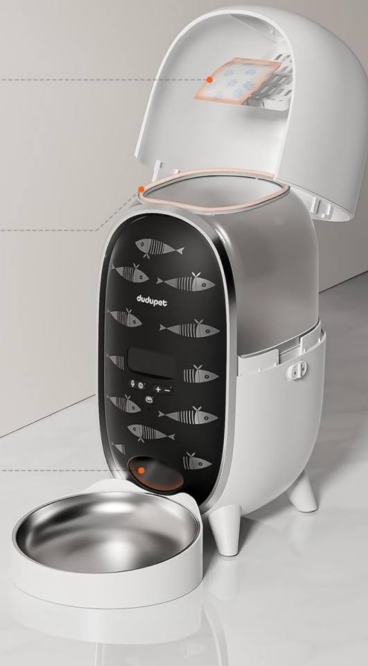
Image: Diagram illustrating the upgraded sealing performance, including the desiccant compartment and silicone ring for food freshness.