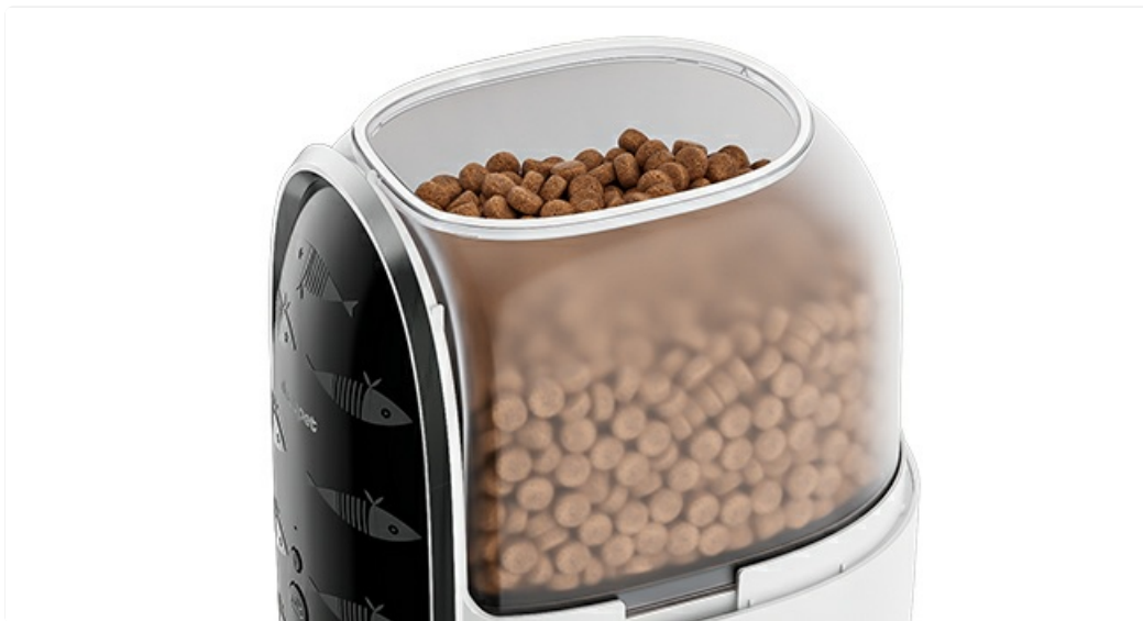
Image: Close-up of the food tank, showing dry pet food being loaded into the transparent container.