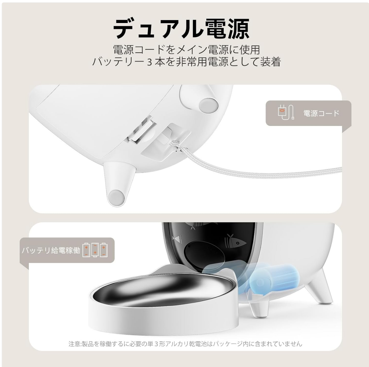
Image: Illustration of the dual power supply, showing both the AC power cord connection and the battery compartment for backup.